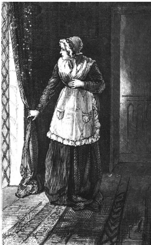
"AND TOWARD THE OPENING THUS MADE SARAH NOW ADVANCED."

With that discourteous answer, the nurse closed the door again. Just as Sarah turned away from it she looked toward the inner end of the passage. The door of the nursery was situated there. It was ajar, and a dim gleam of candle-light was flickering through it.