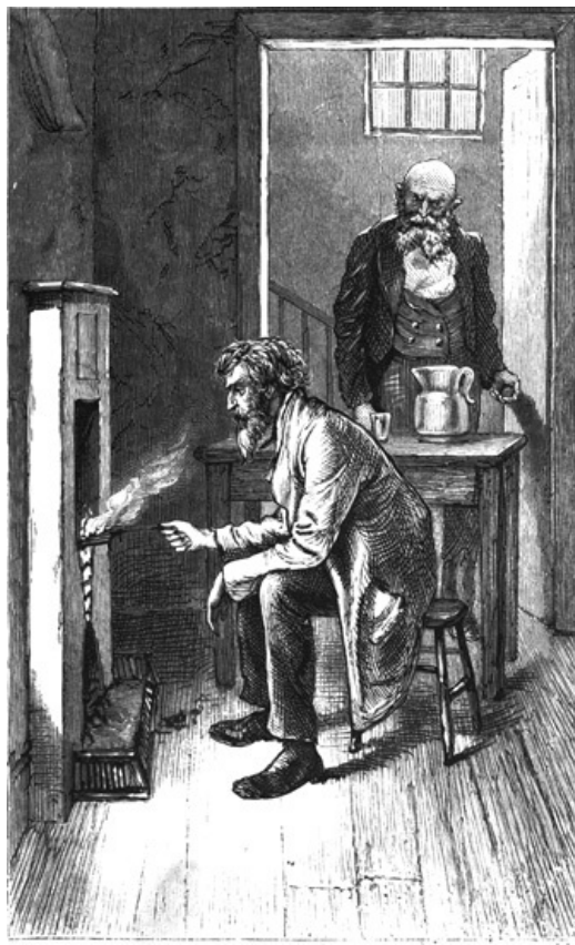
"HE HAD JUST TURNED THE RASHER, WHEN THE DOOR OPENED, AND SHROWL ENTERED THE ROOM."

Neither master nor servant exchanged a word or took the smallest notice of each other on first meeting. Shrowl stood stolidly contemplative, with his hands in his pockets, waiting for his turn at the gridiron. Mr. Treverton finished his cooking, took his bacon to the table, and, cutting a crust of bread, began to eat his breakfast. When he had disposed of the first mouthful, he condescended to look up at Shrowl, who was at that moment opening his clasp-knife and approaching the side of bacon with slouching steps and sleepily greedy eyes.