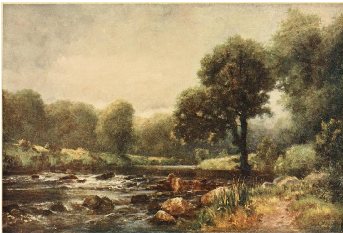
ON THE RIVER SLANEY AT BALLINTEMPLE