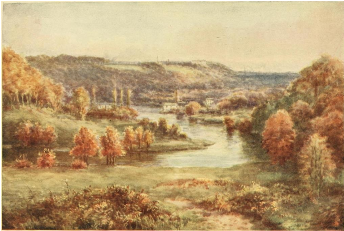
THE RIVER LIFFEY AT PALMERSTON