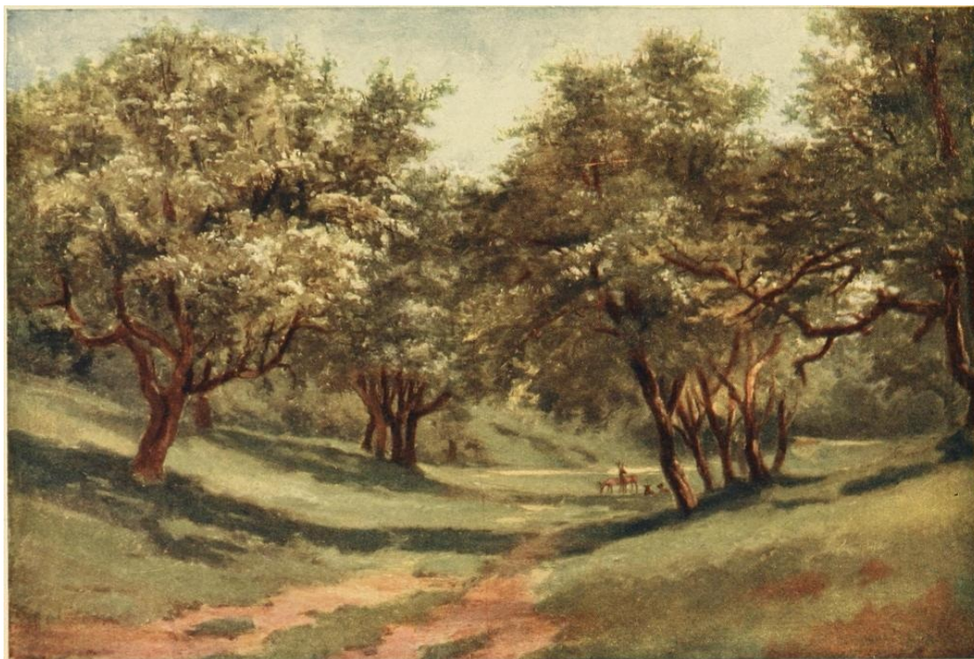
A HAWTHORN GLADE, PHOENIX PARK