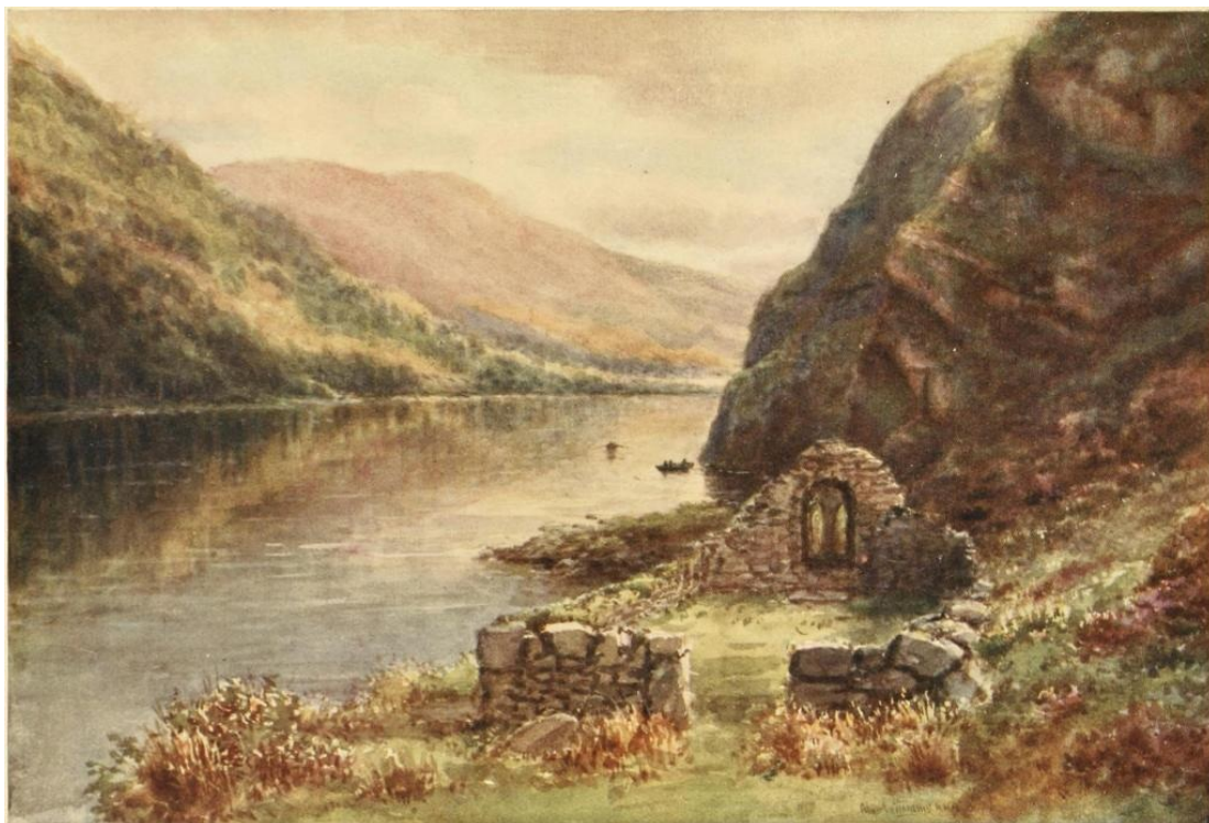
ST. KEVIN'S BED AND THE CHURCH OF THE ROCK, UPPER LAKE GLEN DALOUGH

However that be, Kevin fled from the society of men—and women—to take up his abode in the lovely but peaceful spot for ever associated with his name: "a valley closed in by lofty and precipitous mountains beside a lake". "On the northern shore", says the Life, "his dwelling was in a hollow tree: but on the southern shore of the lake, he dwelt in a very narrow cave, to which there was no access except by a boat, for a perpendicular rock of immense height overhangs it from above."