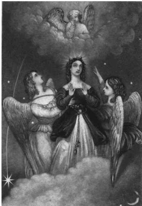
THE SPIRIT LAND.