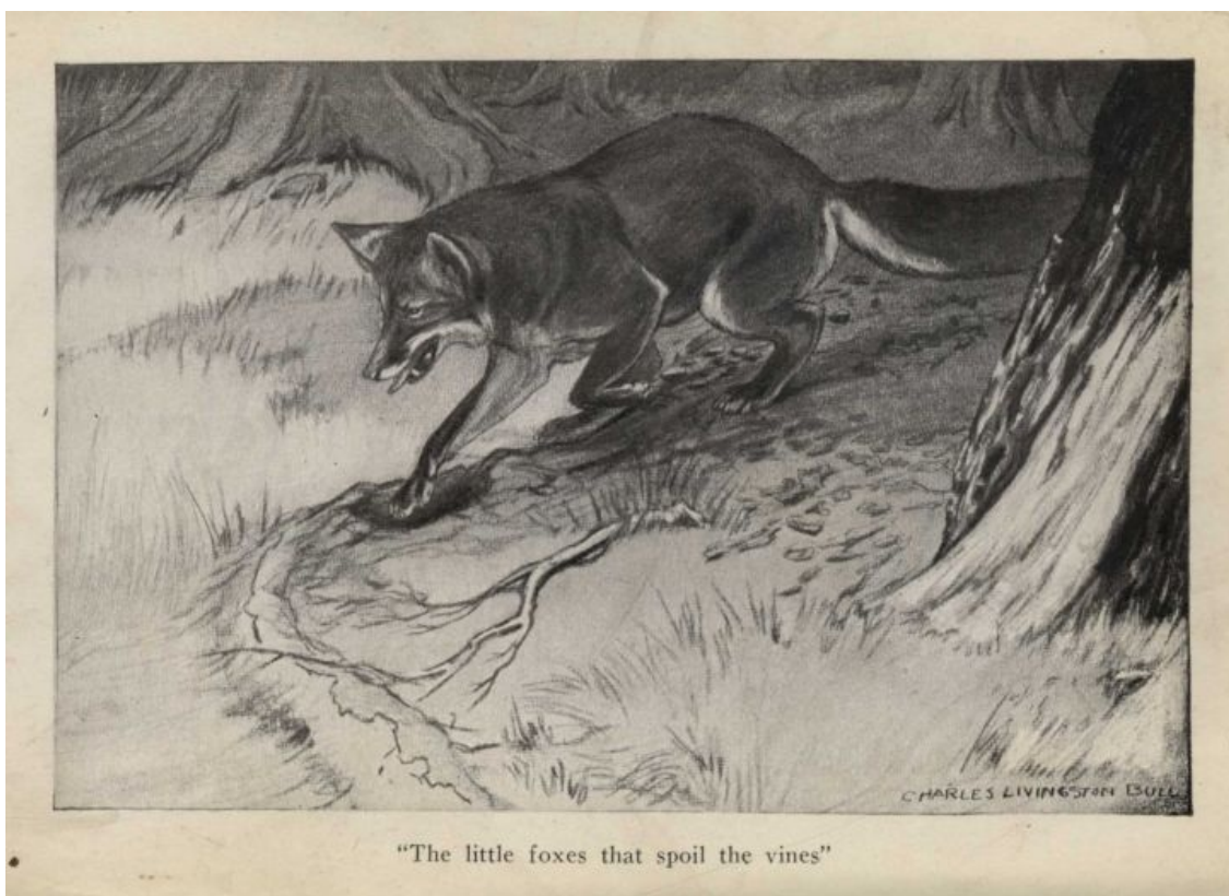
"The little foxes that spoil the vines"

*** START OF THE PROJECT GUTENBERG EBOOK LITTLE FOXES: STORIES FOR BOYS AND GIRLS ***