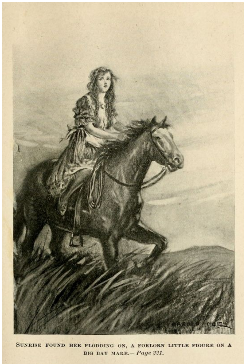
SUNRISE FOUND HER PLODDING ON, A FORLORN LITTLE FIGURE ON A BIG BAY MARE.— Page 221.