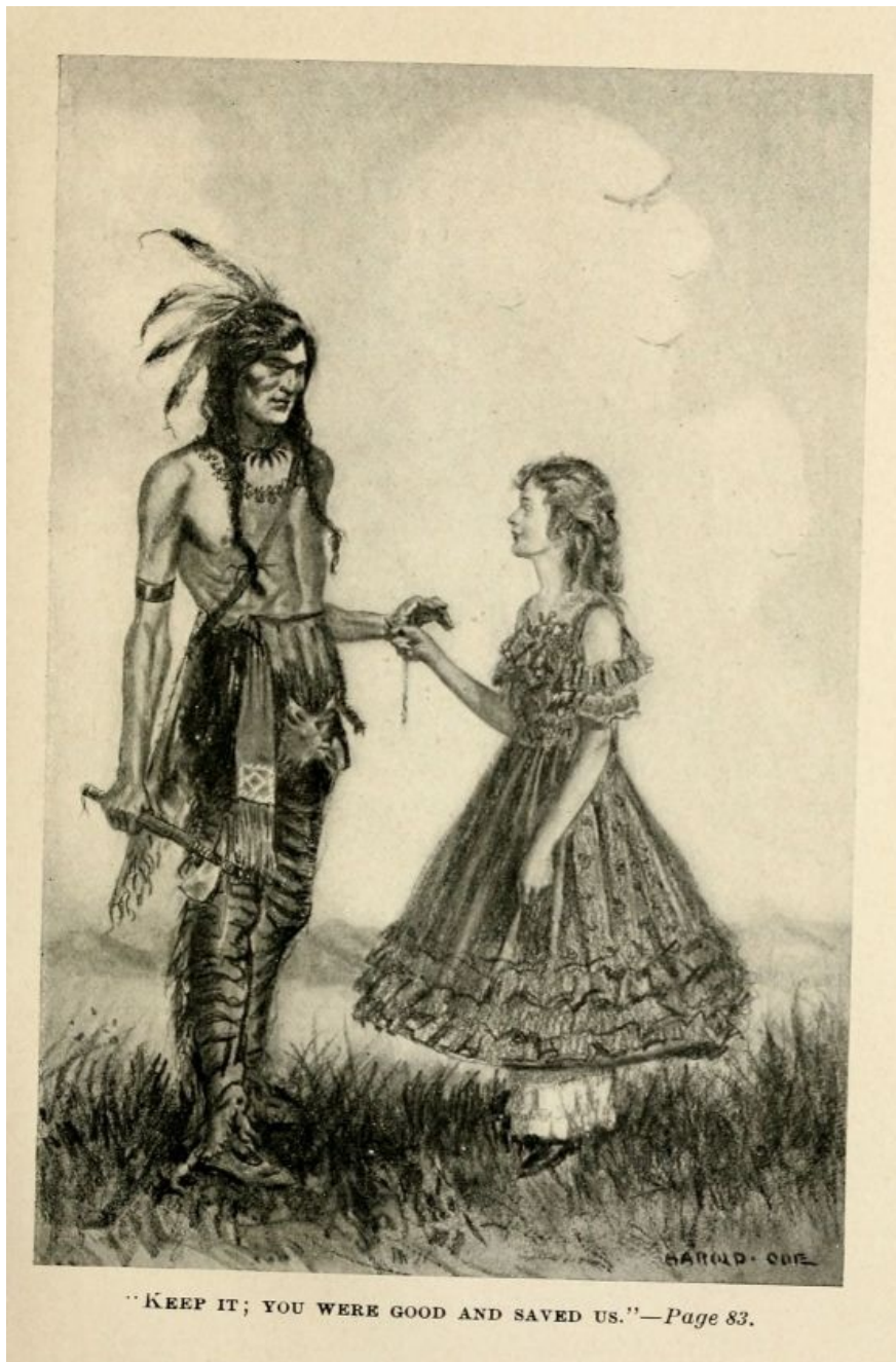
"KEEP IT; YOU WERE GOOD AND SAVED US."—Page 83.