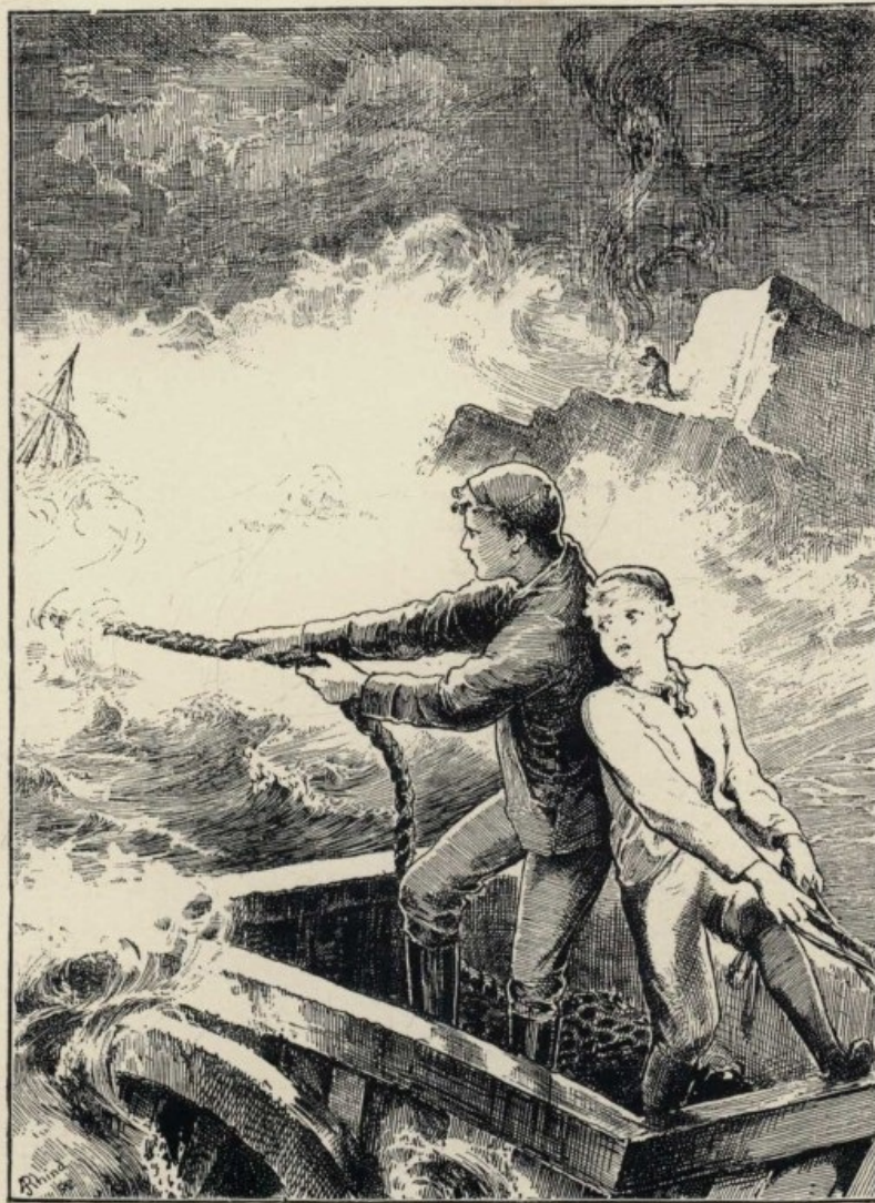
A PERILOUS RESCUE.