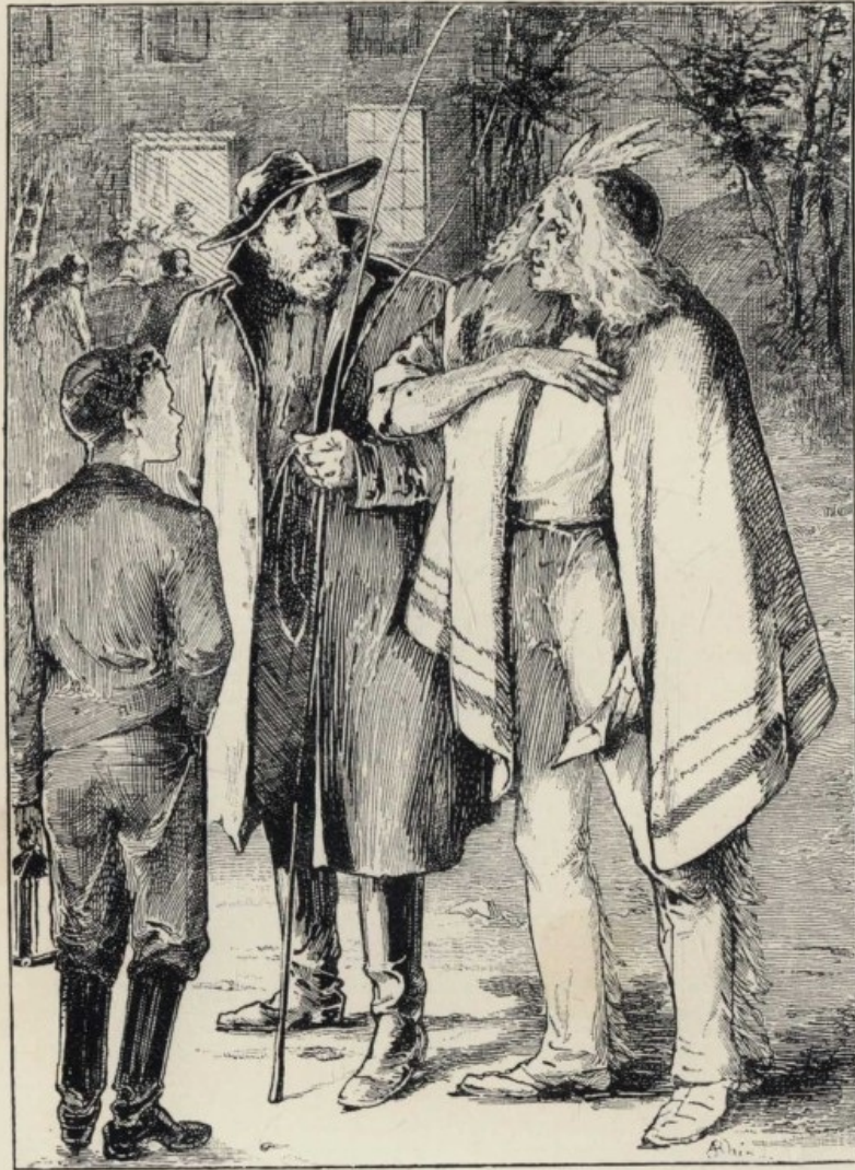
THE OLD CHIEF.