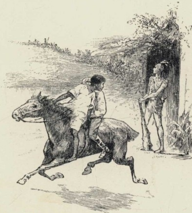
FLEEING FROM THE TANA.