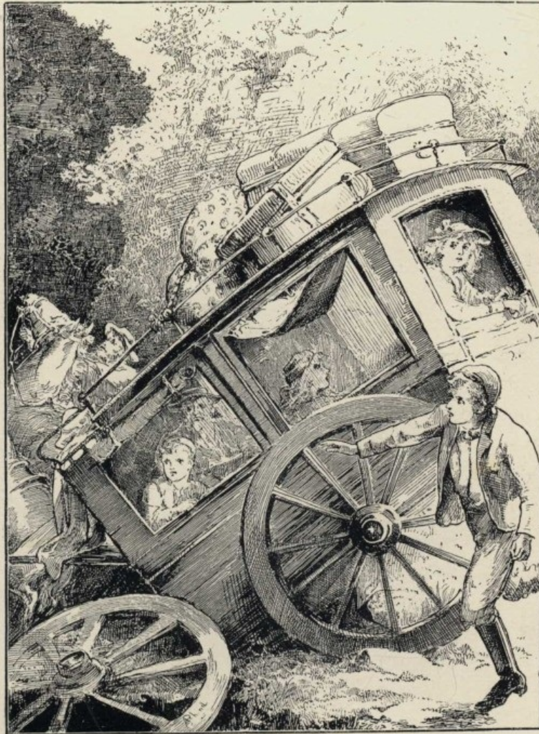
AN AWKWARD PLIGHT.