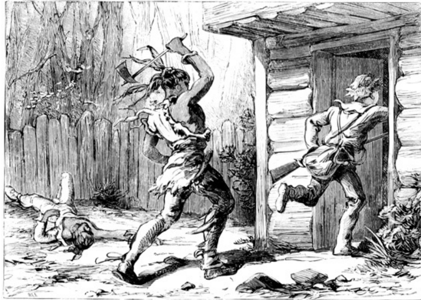
NED MAKES A NARROW ESCAPE.

As may be supposed, the Wyandot had not run half the intervening distance, when another blue puff, floating aside from the loophole, accompanied the report of a rifle. Jim Turner had fired at the approaching Wyandot, but he did it so hastily that he missed him altogether.