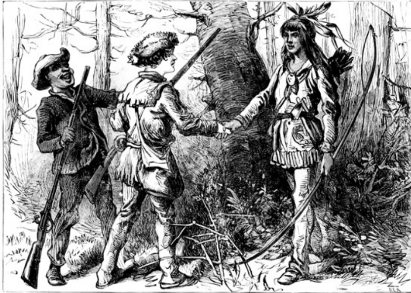
THE MEETING WITH DEERFOOT.

As the single word fell from his lips, his eyes rested on the figure of a young Indian of singular grace and beauty, who, without regarding the bewildered Blossom, walked forward to greet Ned Preston.