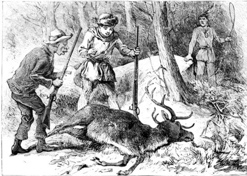
THE TELL-TALE ARROW.