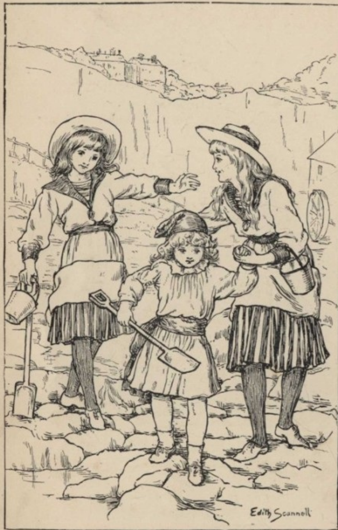
THE SLIPPERY ROCKS.