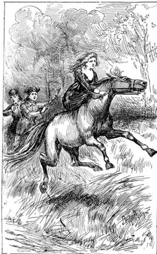
The colt darted forward at full speed with Mrs. Dillard.—Page 113.

"Shall we do it?" Evan asked, for even now it was in his mind to disobey the brave woman's commands.