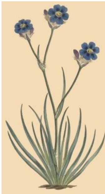
N o 458.