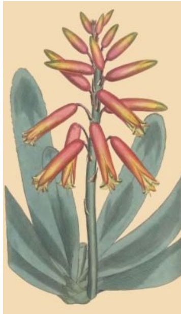
N o 457.

"The Fan Aloe grows to the height of six or seven feet, with a strong stem, towards the upper part of which are produced two, three, or four heads, composed of long, compressed, pliable leaves, of a sea-green colour, and ending obtusely; these are placed in a double row, lying over each other, with their edges the same way; the flowers are produced in short loose spikes, are of a red colour, and appear at different times of the year." Mill. Dict.