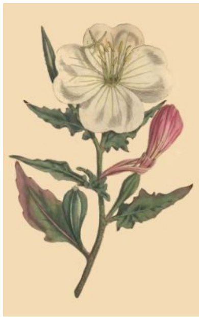
N o 468.

Of this genus we have already figured six different species; this is another newly discovered one, which, like most of its kind, displays its beauties chiefly in the night. It is the only one, as far as we yet know, that has white blossoms; these, when first expanded, are beautifully so, but in the morning they change to a purple colour, fade, and their place is supplied by a fresh succession. In this remarkable change of colour, it bears some affinity to the Enothera anomala , which may be considered as strengthening our opinion that the latter plant belongs to this genus rather than to that of Gaura . The Enothera tetraptera is a native of Mexico, its duration as yet not certainly ascertained, but may be treated as a tender annual; and such plants as do not flower the first year, may be preserved under glasses through the winter. It was raised from seeds sent by Mr. DONN, from Cambridge; but was probably first introduced into this country from seeds sent to the Marchioness of BUTE, by Prof. ORTEGA, of Madrid.