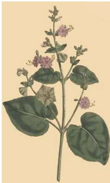
N o 434.

MIRABILIS viscosa floribus racemosis; foliis cordatis orbiculato-acutis tomentosis. Cav. Icon. I. n. 17. t. 19.