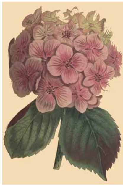
N o 438.

It appears to be a point not yet fully determined, whether the present plant exhibits the appearances belonging to it in a state of nature, or those which are in a certain degree the effect of accident, or of art; in its fructification it certainly is not so completely barren as the Guilder Rose, Viburnum Opulus , cultivated in our gardens, since it has most of its parts perfect; yet as none of the authors who have seen it in China or Japan (where it is said not only to be much cultivated but indigenous [1] ) describe its fruit, we are inclined on that account to regard it, in a certain degree, as monstrous.