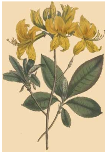
N o 433.

DESCR. Shrub from two to three feet or more in height, the thickest part of the stem not exceeding the size of the little finger, covered with a smooth brown bark, irregularly branched; Flowers appearing before the leaves are fully expanded, and produced in umbels at the extremities of the branches, from eight to twelve or more in an umbel, of a fine yellow colour and agreeable fragrance; each blossom is about the size of that of the horse-chestnut, and as some of them are produced much earlier than others, the plant of course continues a considerable time in bloom, standing on short peduncles; Calyx very short, viscous, and irregularly divided, most commonly into five ovato-lanceolate segments; Corolla, tube cylindrical, viscous, grooved, brim divided into five segments, undulated and somewhat wrinkled, ovate, pointed, three turning upwards, two downwards, of the three uppermost segments the middle one more intensely yellow than the others and inclining to orange, with which it is sometimes spotted; Stamina usually five, yellow, projecting beyond the corolla, and turning upwards near their extremities; Antheræ orange-coloured; Pollen whitish and thready; Germen somewhat conical, evidently hairy, and somewhat angular; Style yellowish, filiform, projecting beyond the stamina, and turning upwards; Stigma forming a round green head.