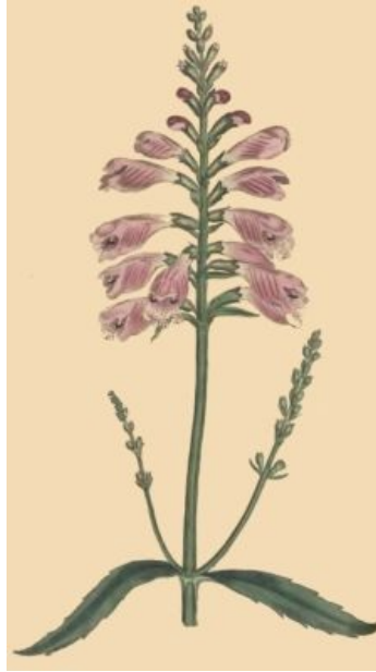
N o 467.

DRACOCEPHALUM virginianum floribus spicatis confertis, foliis lineari-lanceolatis serratis. Ait. Kew. v. 2. p. 317.