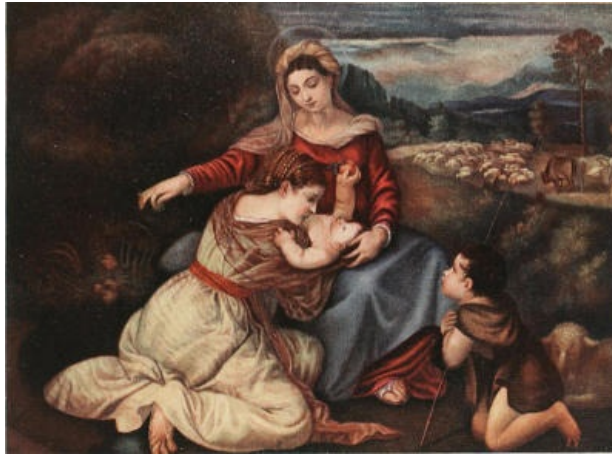
PLATE V.—THE MARRIAGE OF ST. CATHERINE (In the Pitti Palace, Florence)

dagger, his left on the dog's collar, he wears the chain of the Golden Fleece, and seems a man born to command. Belonging, of course, to a much later date is the other portrait of Charles at the Battle of Mühlburg, perhaps even less a monument of Titian's skill than an enduring record of the terrible craze for repainting that beset Spain until recent years, and is not unknown to-day, though public opinion has had some effect even in Madrid. It is not generally known that there is a Spanish official who has a salaried engagement to assist the old masters whose work shows signs of fading, and without wishing to be hypercritical it is reasonable to remark that these officials in a laudable anxiety to earn their stipend have done irreparable damage to much work that they were not fit to approach.