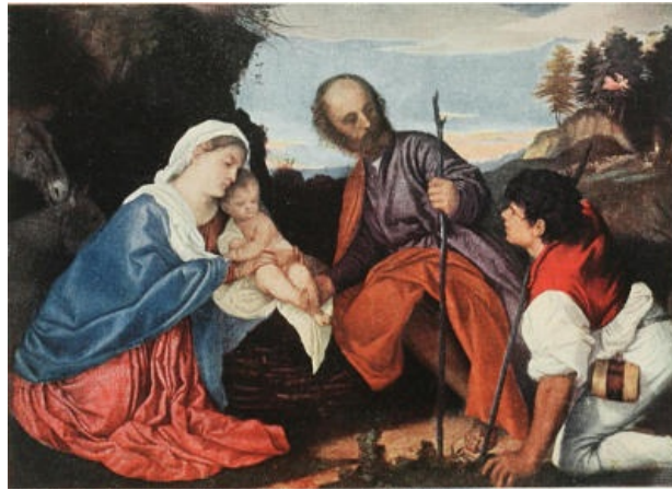
PLATE VIII.—THE HOLY FAMILY (In the National Gallery, London)

disinfection were not practised properly. Historians tell us that some 40,000 people perished, the greatest panic prevailed, and while the plague was at its height Titian died. If his own insinuation of the year of his birth be correct he must have been in his ninety-ninth year, but even if we accept the date given by those who believe that he was born as late as 1482, he would have been within seven years of his centenary. The epidemic is recorded in the famous Church of the Redentore on the Giudecca, dedicated to Christ by the Doge Mocenigo, whose portrait painted by Tintoretto may be seen in the Accademia to-day.