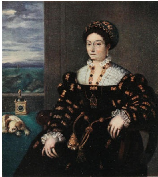
PLATE I.—THE DUCHESS OF URBINO. Frontispiece