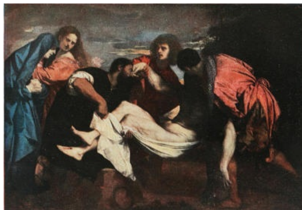
PLATE III.—THE ENTOMBMENT

Serious troubles were upon the Republic. The League of Cambrai, one of the least scrupulous political arrangements in European history, had resulted in an attack upon the Venetian domains that had been entirely successful, though statecraft was destined to recover from the Philistines of Europe a part at least of what they had taken, and finding that the Republic was too beset to give much thought to art or artists Titian left Venice for Padua. This must have been very shortly after the completion of his work with Giorgione. His hand is to be seen in the very pleasant and learned city of Padua among the frescoes in the Scuola del Santo, and he may have been within its walls when the plague, on one of its periodical visits to Venice, added his friend and fellow-worker Giorgione to a heavy list of victims.