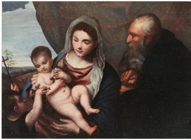
PLATE IV.—THE HOLY FAMILY