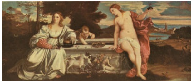
PLATE VII.—SACRED AND PROFANE LOVE