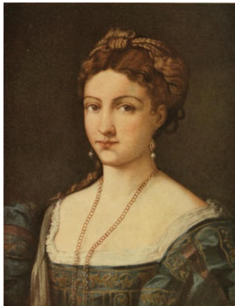
PLATE II.—LA BELLA (In the Pitti Palace, Florence)

There are well over one hundred important works, dealing with the life and art of Titian, written by enthusiasts in half-a-dozen languages, for of all the artists of the Renaissance he makes perhaps the most direct appeal to the man moyen sensuel .