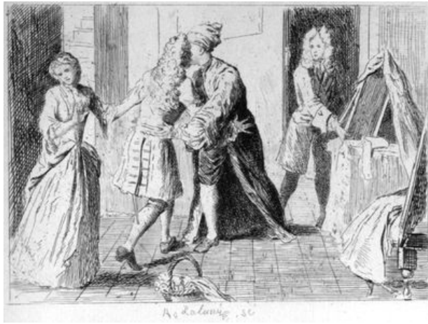
Ad Lalauze, sc