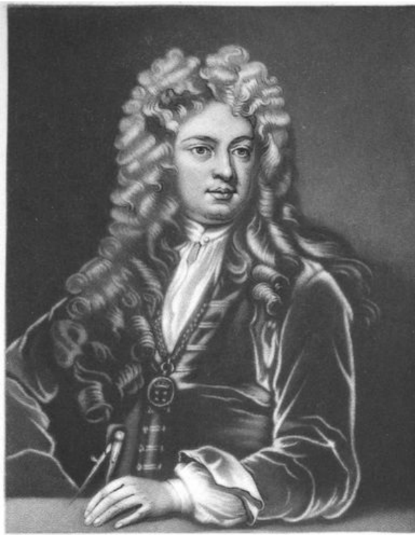
SIR JOHN VANBRUGH.