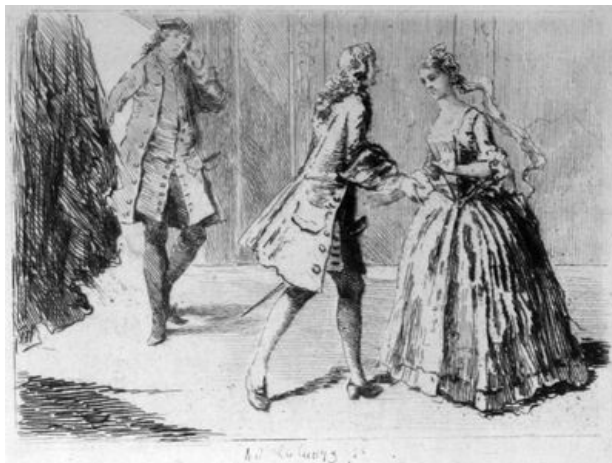
Ad Lalauze, sc