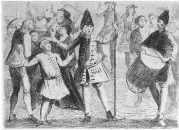
Ad Lalauze, sc