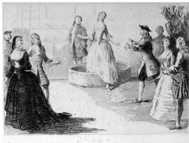
Ad Lalauze, sc