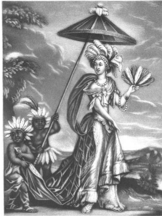
MRS BRACEGIRDLE AS "THE INDIAN QUEEN".

During these Contentions which the impolitick Patentees had rais'd against themselves (not only by this I have mentioned, but by many other Grievances which my Memory retains not) the Actors offer'd a Treaty of Peace; but their Masters imagining no Consequence could shake the Right of their Authority, refus'd all Terms of Accommodation. In the mean time this Dissention was so prejudicial to their daily Affairs, that I remember it was allow'd by both Parties that before Christmas the Patent had lost the getting of at least a thousand Pounds by it.