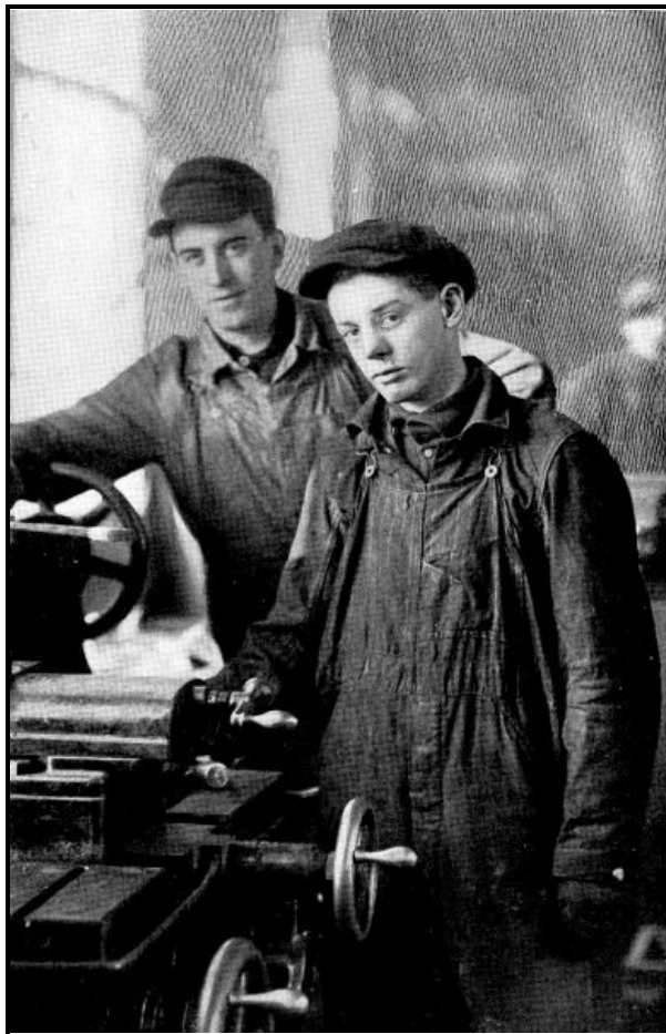
AUBURN, WASHINGTON, HIGH SCHOOL BOYS IN RAILROAD SHOPS

Several high schools have sent us reports of their plans for giving credit for work outside of school. Some of these schools use plans that differ considerably from those of the elementary schools where the movement began; they lay emphasis on improvement in work, and to this end they require that all the work be supervised by the teachers of home economics, agriculture, commerce, or manual training. Other high schools try to encourage the habit of industry, no matter what the kind of work, and offer credit for such tasks as running errands, delivering groceries, or carrying a paper route. In my opinion both ideas are good; there is no end to the possibilities of developing skill in home work under the instruction of one who really knows how to do it, and there is also great value in the encouragement of faithful industry in routine tasks.