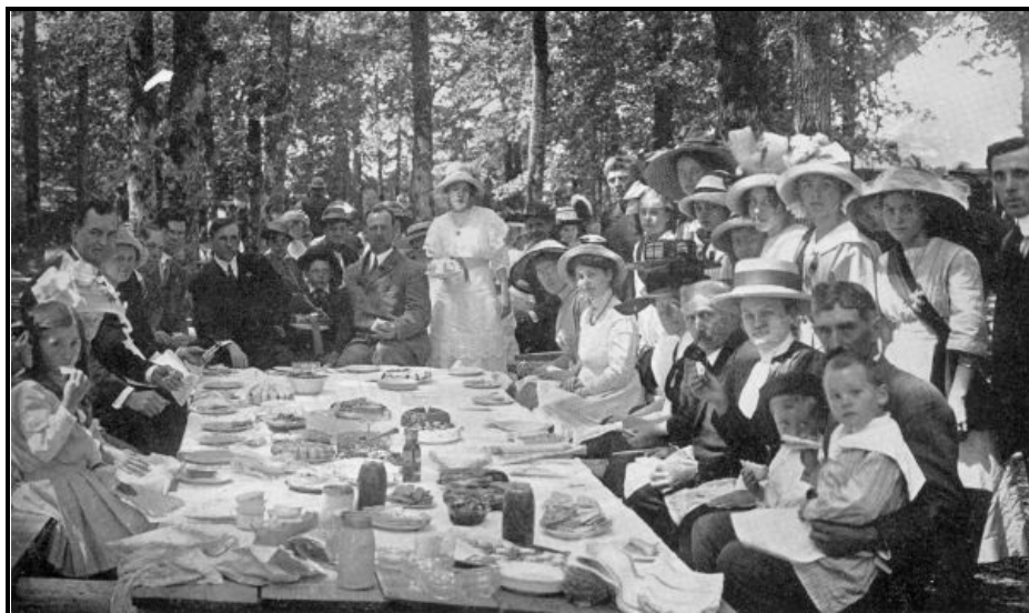
PICNIC LUNCHEON COOKED AND SERVED BY SPRING VALLEY CHILDREN