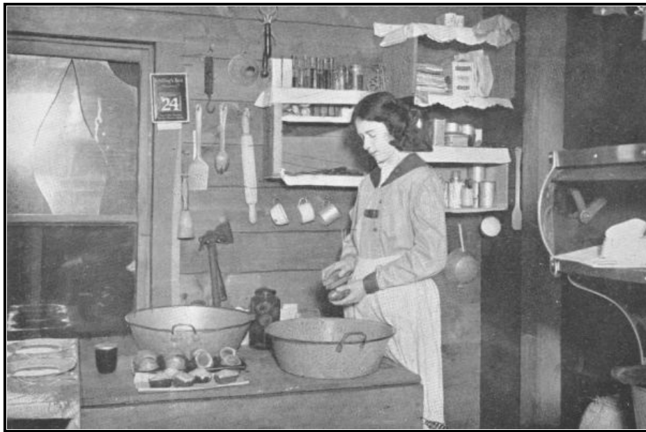
ALGONA, WASHINGTON, GIRL, AGED 12, EARNING HOME CREDITS

Politeness—a show of consideration for the rights and feelings of others—is partly a habit. Careful watching by parent and teacher is needed to establish this consideration as a permanent attitude of mind. It is with much pleasure that I note that many of the home credit cards bear the items, "Cheerfulness," "Kindness," "Politeness," "Keeping temper," "Doing before told," "Care of language," "Courtesy to parents," and the like. And it is with very great pleasure that I receive letters from parents and teachers saying that the attitude of the children in these things is becoming a habit.