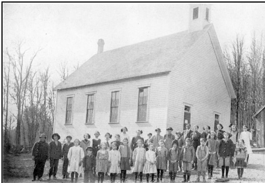
SPRING VALLEY SCHOOL, OREGON, WHERE HOME CREDITS WERE GIVEN, 1911-1912

Every one of the thirty-three pupils in the school was enrolled in this new kind of contest. The registering of the credits each morning meant extra work for the teacher, but it brought extra results. The prospect of a bank account for the winners incited the children to learn for the first time something about banks and banking. There was a "we-are-doing-something" atmosphere throughout the school. [13]