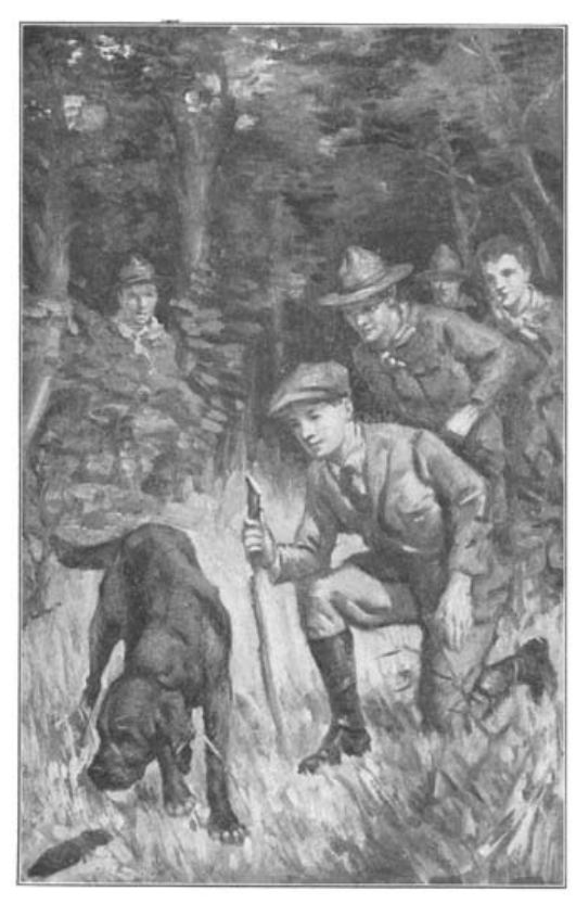
THE BLOODHOUND BEGAN SNIFFING THE FOOTPRINT.