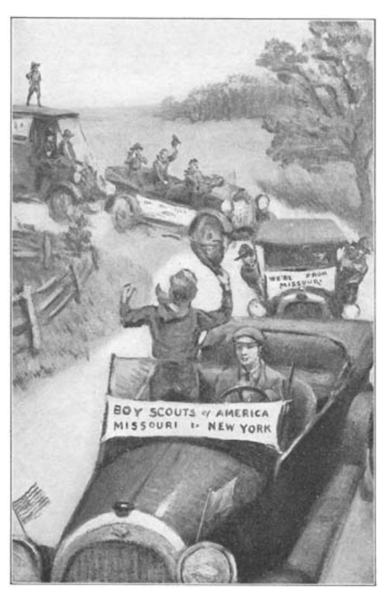
THE MOTOR CARAVAN ON THE WAY.

*** START OF THE PROJECT GUTENBERG EBOOK ROY BLAKELEY'S MOTOR CARAVAN ***