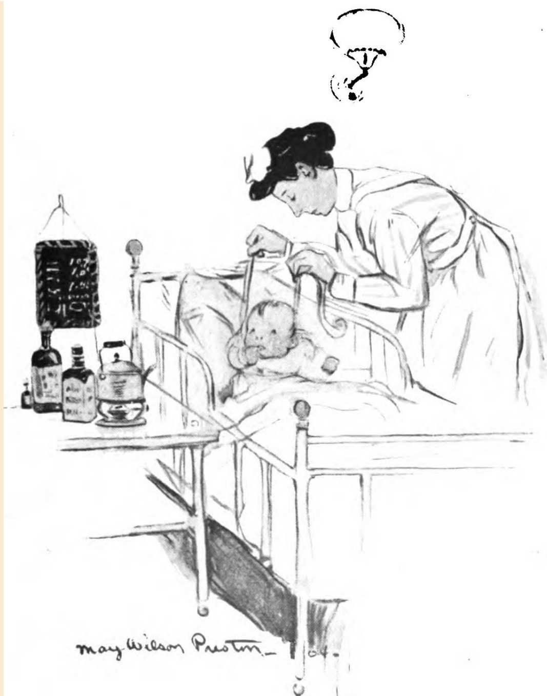
“Chiswick tied her to the head of the crib with a strip of antiseptic bandage”

When the committee met again they passed a resolution of thanks to Chiswick for her prompt action, and Marjorie's private secretary entered it on the records. As she wrote the last word she looked at Marjorie and winked, and Marjorie smiled wickedly.