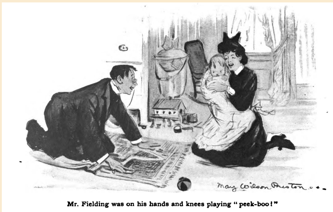
Mr. Fielding was on his hands and knees playing "peek-boo!"

Marjorie looked at him good naturedly. If he was willing to play she could forgive everything. She reached out her hands, and jumped toward her father. Before he knew how it happened, he had pressed his lips to her soft cheek and her hands were entangled in his hair.