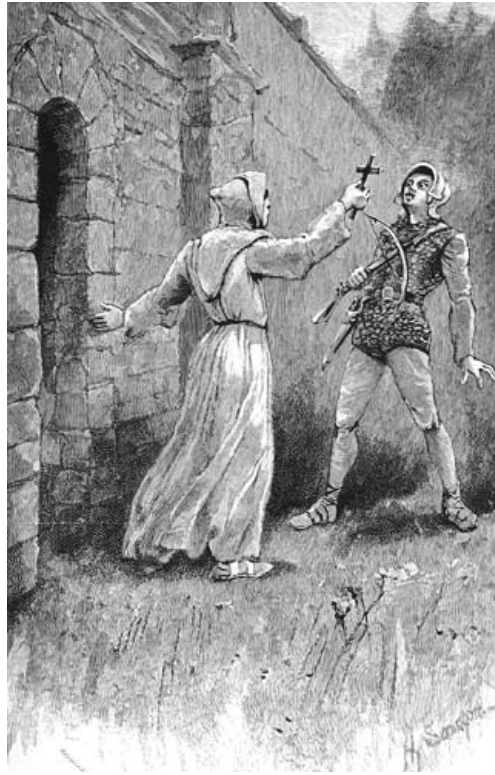
"WHOSE BLOOD IS THIS?"

"Who art thou, churl?" he demanded. "Whose blood is this?"