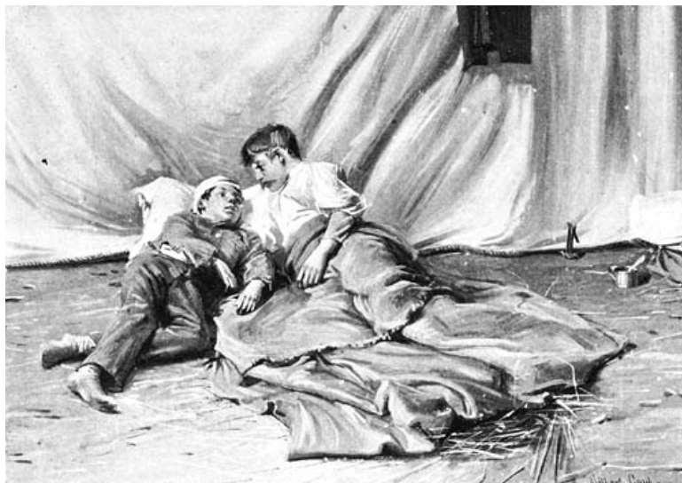
"I'M STEVE HORNBECK'S SON!"

"Say, I'm Steve Hornbeck's son," he said, "and your father was my Uncle Lyme. Do you know, I kind of felt like takin' a shine to you when you spoke to me early this morning."