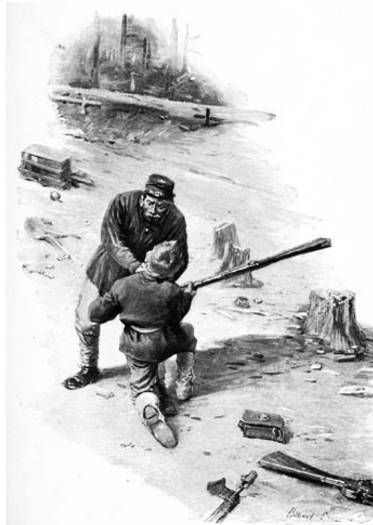
LAFE AND THE BOUNTY-JUMPER.

It might be a desperately foolish thing to do, but Lafe could not hold himself from doing it—and for that matter didn't try.