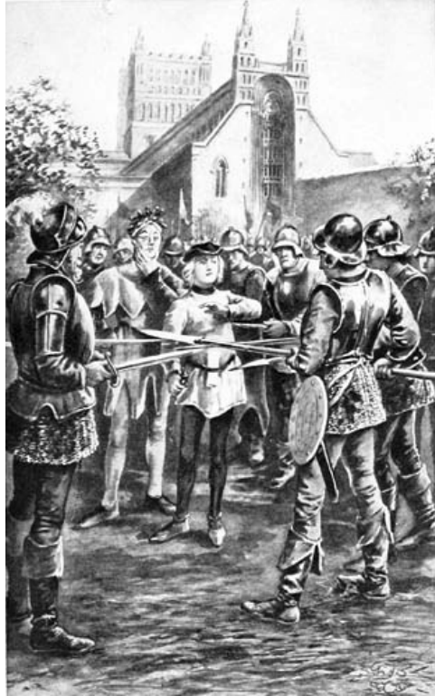
"TWO DOZEN PIKE-HEADS CLASHED DOWN AS BY A SINGLE TOUCH."

The twain, with as bold a front as might be, walked down this passage of pikes until the captain of the watch, a burly, bearded man in Flemish armor, stopped them with uplifted hand; and two dozen pike-heads clashed down as by a single touch, to bar alike progress and retreat.