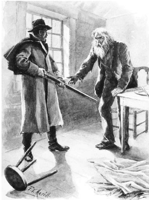
"GIMME THAT GUN!"

The old man nodded. Then he, too, laboriously rose to his feet. Bent as his form was, he stood a taller man than his son. He rested one hand on the table for support, and stretched out the other with a masterful gesture.