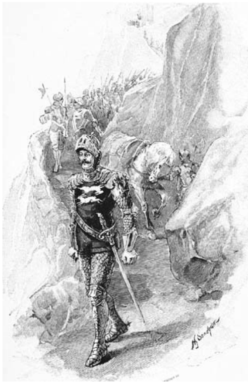
"SIR WATTY CAME STALKING DOWN."

At last Sir Watty came stalking down the broken, winding path, with his chestnut stallion led prancing from rock to rock at his heels. Behind him came a score of men-at-arms, and then still other horses at halter.