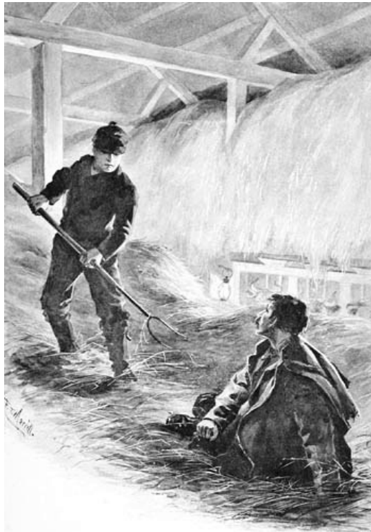
"SH-H! TALK LOWER!"

"Sh-h! Talk lower!" urged Mose under his breath. "I didn't mean to hurt you, sonny. I didn't know who you was. You come tromplin' on me here when I was fast asleep, and I took hold of you when I wasn't hardly woke up, you see, that's all. I didn't hurt you, did I?"