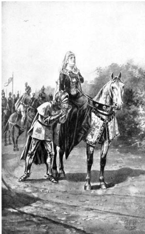
"HE ADVANCED AND KISSED THE LADY'S HAND."

This lady, then,—she with the bold, beautiful face, pale now as an ivory missal-cover, and drawn with stern lines, she with the burning brown-black eyes, and proudly upright carriage,—was the Frenchwoman, the Queen, the great Margaret of Anjou!