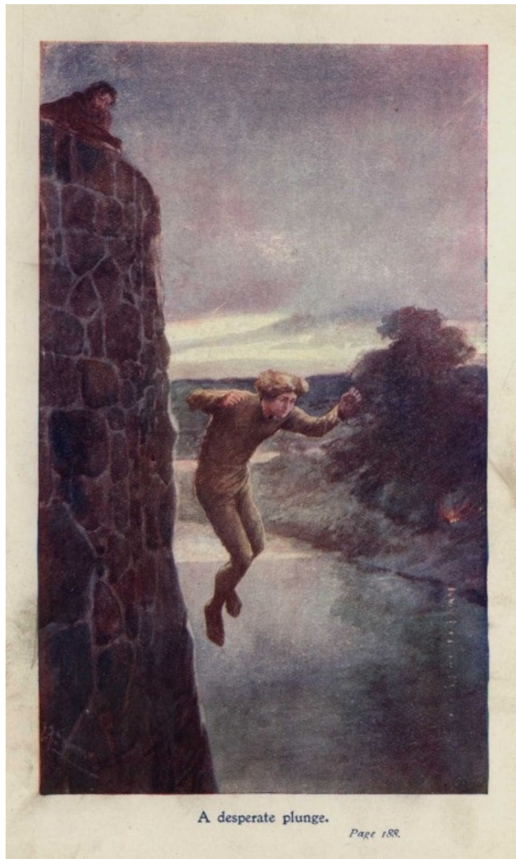
A desperate plunge.

Aliva saw him rise to the surface, and watched him swimming with all his might to the opposite bank.