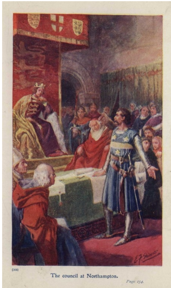
The council at Northampton.

And so it came about that, not many days later, our hero rode over to Northampton, where he found the king in council with the bishops, abbots, barons, and justices.