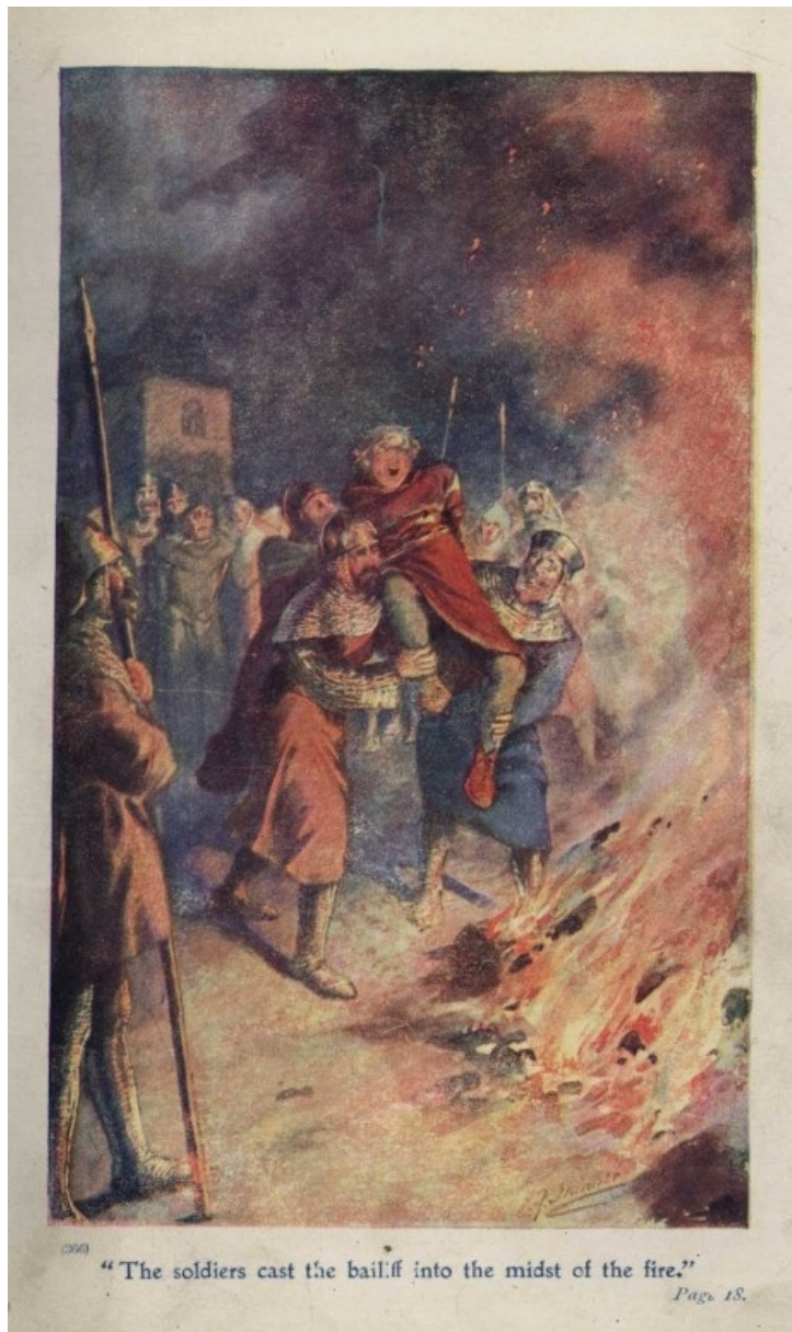
"The soldiers cast the bailiff into the midst of the fire."