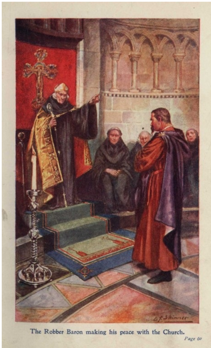
The Robber Baron making his peace with the Church.