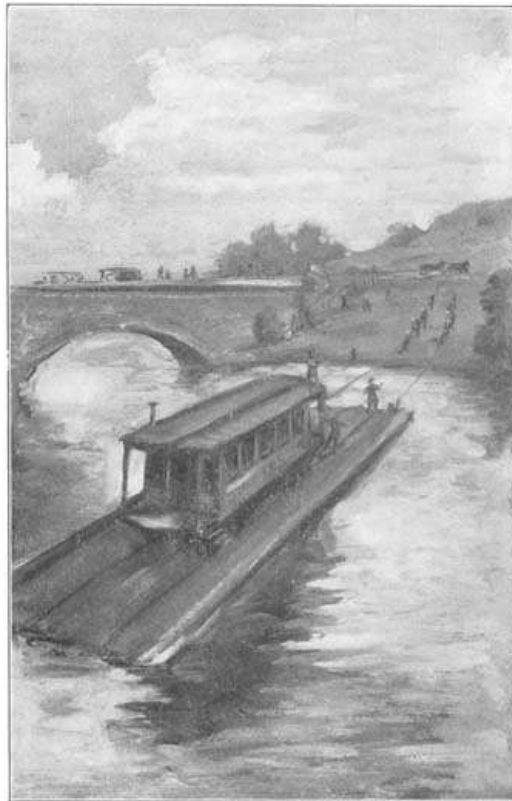
SOME MEN THREW US A ROPE AND PULLED US ASHORE.

So you see we got our car out of the marsh all right and when something goes wrong it's better not to begin grouching till the next day—that's what I say. Wait a couple of days, that's better. Even if you wait a year it won't do any harm.