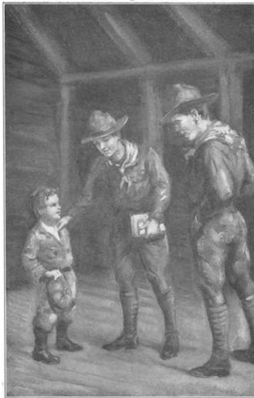
WHAT ARE YOU DOING HERE?

"Some bandit," Westy said. "Who is it, do you know?"