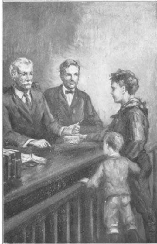
ROY HANDED THE BOX OF MATCHES TO THE JUDGE

The next thing that happened the Ravens and the Elks (they've got forty-two merit badges, the Elks), they started up to Temple Camp; that's where we always go in the summer. My patrol decided to stay home until August, anyway, and camp in the old car and try to get it moved down to the river. Pee-wee is in the Ravens, but he's got about as much patrol spirit as a stray cat. He belongs everywhere, especially where there are eats. No one patrol can hold that kid. He said he was going to stay with us.