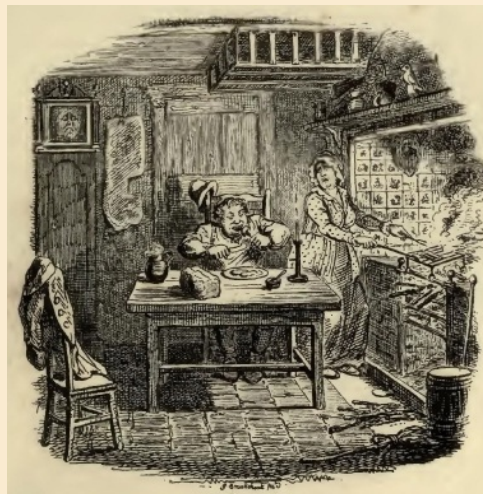
Original Size -- Medium-Size

The wife, overjoyed at getting the candle out of the kitchen without discovery, was in high good humour, so that the miller became in excellent spirits too, both on account of his agreeable reception and the dispersion of his fears, and as a proof of his state of mind gave his wife a hearty kiss, and swore that they would go down and have a cozy bit of supper together before they went to bed. In vain the poor woman resisted, the slice of bacon must be broiled and the eggs poached. With trembling hand she bore the light into the kitchen, and durst not cast a glance upon the clock case where the prisoner, full of horror at the return of the candle, and reduced to a state of insufferable impatience by his miserable plight, uttered a deep low groan of despair as they entered the apartment. Fortunately it was not loud enough to attract the miller's attention, but thrilled through the heart of his unfortunate spouse. The happy pair soon began their culinary operations, the male with a light heart and a hungry appetite, the female sick and trembling at the disclosure which she feared was inevitable. All she could do, she did. She tried to keep up a conversation, she shaded the light, and she spread rasher after rasher before the all-devouring miller, who seemed as if intent to display his prowess before his rival, who was most ruefully and intently gazing upon him from his window of observation.