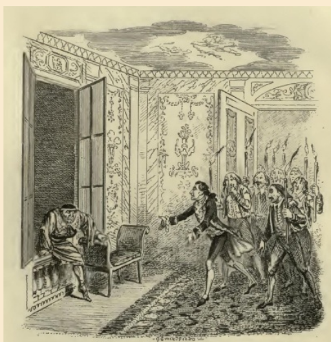
Original Size -- Medium-Size

The Prince, at their head, ran up to the window, and with all courtesy helped in the astonished Cardinal, and turning to the servants said, "Scoundrels! is it thus you pay respect to the sacred person of the Cardinal Bernis? Is it thus, by your negligence, that you compel his Eminence, when coming to my wife, to venture his precious life upon a slight ladder and force him through the window in this miserable plight?" Conceive the situation of the bald-pated, cloakless, and tattered Cardinal, as he stood ashamed and terrified before the jeering Prince and his twenty torchbearers. His trembling knees could scarcely support him, as, half dead with fright, shame, and disappointment, he sneaked out of the room, still lighted by the torches and bowed out by the Prince, who continued to apologize for the carelessness of his servants, much to the annoyance of the poor Cardinal, whose misery was heightened by one stroke more; for, as he was huddling off, he just caught the face of the Princess, peeping through the opening of a door with some friends, all almost convulsed with laughter.