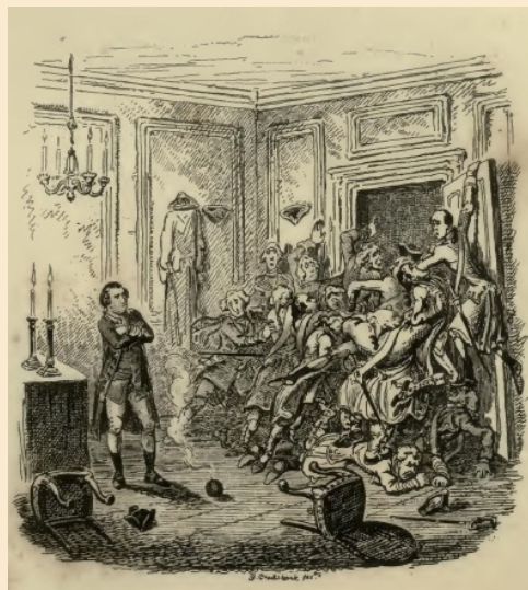
Original Size -- Medium-Size

This point of duty gave occasion to a point of humour which clearly displayed the brilliant points of the officer's character, and exposed the weak ones of his brothers in the service in a very pointed manner. His antagonist gave him the character of a coward through the whole army. Conscious of not having merited the aspersion, and discovering the injury he should sustain in the minds of those unacquainted with him, he repaired one evening to a general meeting of the officers of that line. On his entrance, he was avoided by the company, and the officer who had challenged him, insolently ordered him to leave the room; a request which was loudly re-echoed from all parts. He refused, and asserted that he came there to vindicate his fame; and after mentioning the reasons which induced him not to accept the challenge, he applied a large hand grenade to the candle, and when the fuse had caught fire, threw it on the floor, saying, "Here, gentlemen, this will quickly determine which of us all dare brave danger most."