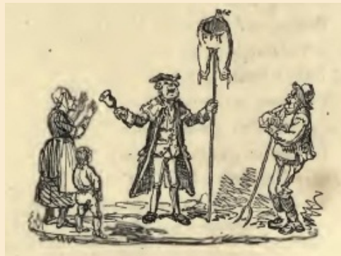
Original Size -- Medium-Size

" The Devil I have, " returned the miller, in a tone which came up like a groan, as he gazed upon his nether man. Quickly comprehending the secret of the exchange, he pocketed the notes, drank up the brandy for his own consolation, and went home, moralizing his pensive path, and gave the hypocritical culprit the soundest beating she ever had in her life. She, poor soul! who had been charitably employed in the meanwhile, in letting the bird out of his cage, was not prepared for this reception; nor did she understand it until the next morning, when the breeches were cried round the town by her malignant husband, who also with no pleasant expression of countenance, made a point of turning over his newly-acquired riches in her presence.