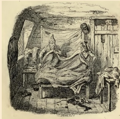
Original Size -- Medium-Size

She sat upon end in bed staring at him, he moved himself into, a similar situation and riveted his eyes upon her, and so they remained for a few instant's both full of perfect wonderment;—at last it struck the poor lady that this was some monster of a man who had succeeded in some horrible design upon her honour; the idea in a moment gave her the look and manner of a fury, she flung out of bed and roared aloud to the admiration of all the inmates of the house, who attracted by her first scream were already peeping in at the door of the room,—“make me an honest woman, thou wretch,” she cried—“villain that you are,—make an honest woman of me, or I'll be the death of thee”—down she sat upon the bed-stocks, and as she attempted to dress herself she interlarded her occupation with calling for vengeance upon her horrible seducer, who sat trembling at the other side of the bed, vainly attempting in his fright to insinuate his legs into his old tattered breeches. The landlord at last interfered with the authority of his station, and on inquiry found that no breach had been made which could not be easily repaired. The old gentleman was asked if he had any objection to take his fair bedfellow for a helpmate during the remainder of his life; he stammered out his acquiescence as well as he could, and the enraged virgin consented to smooth down her anger on satisfaction being made to her injured