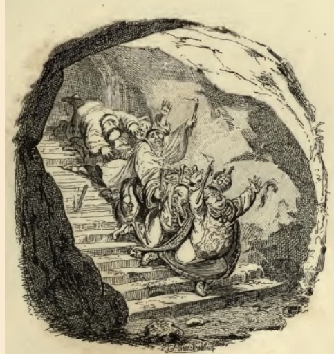
Original Size -- Medium-Size

three on the first dean; all four on the canon; all five upon the archbishop of Riga; when the whole troop rolled helter skelter down the steps, and plumped to the bottom like so many sacks, there remaining senseless!