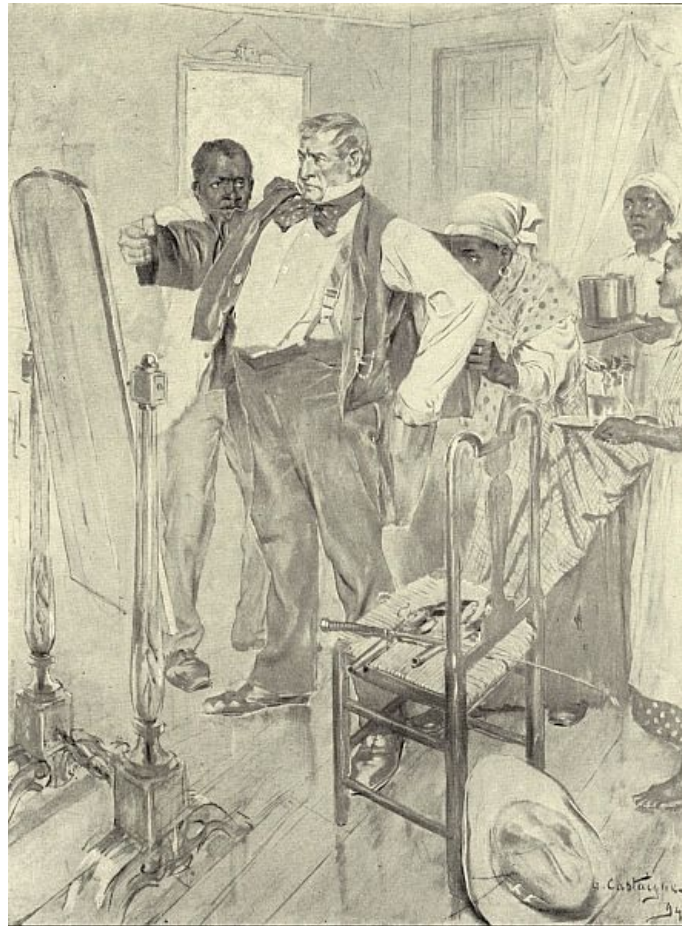
"He made Torm, Charity, and a half-dozen younger house-servants dress him."

When Charity told the Colonel next morning that Polly was gone, the old man for the first time in fifty years turned perfectly white. Then he fell into a consuming rage, and swore until Charity would not have been much surprised to see the devil appear in visible shape and claim him on the spot. He cursed Bob, cursed himself, cursed Torm, Charity, and the entire female sex individually and collectively, and then, seized by a new idea, he ordered his horse, that he might pursue the runaways, threatened an immediate sale of his whole plantation, and the instantaneous death of Bob, and did in fact get down his great brass-mounted pistols, and lay them by him as he made Torm, Charity, and a half-dozen younger house-servants dress him.