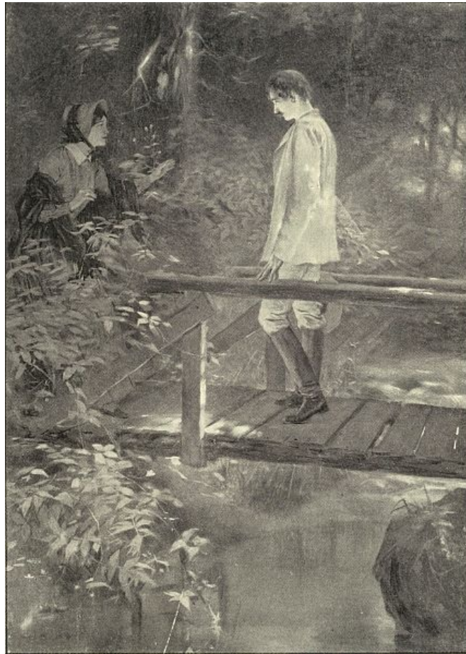
"There he was standing on the bridge just before her."

how kind he had been about making the bridge and hand-rail so strong, and about everything, and how cruel he must think her, and how she would never see him any more as she used to do, she turned the clump of willows to step up on the log, and there he was standing on the bridge just before her, looking down into her eyes! She tried to get by him—she remembered that afterwards; but he was so mean. It was always a little confused in her memory, and she could never recall exactly how it was. She was sure, however, that it was because he was so pale that she said it, and that she did not begin to cry until afterwards, and that it was because he would not listen to her explanation; and that she didn't let him do it, she could not help it, and she did not know her head was on his shoulder.