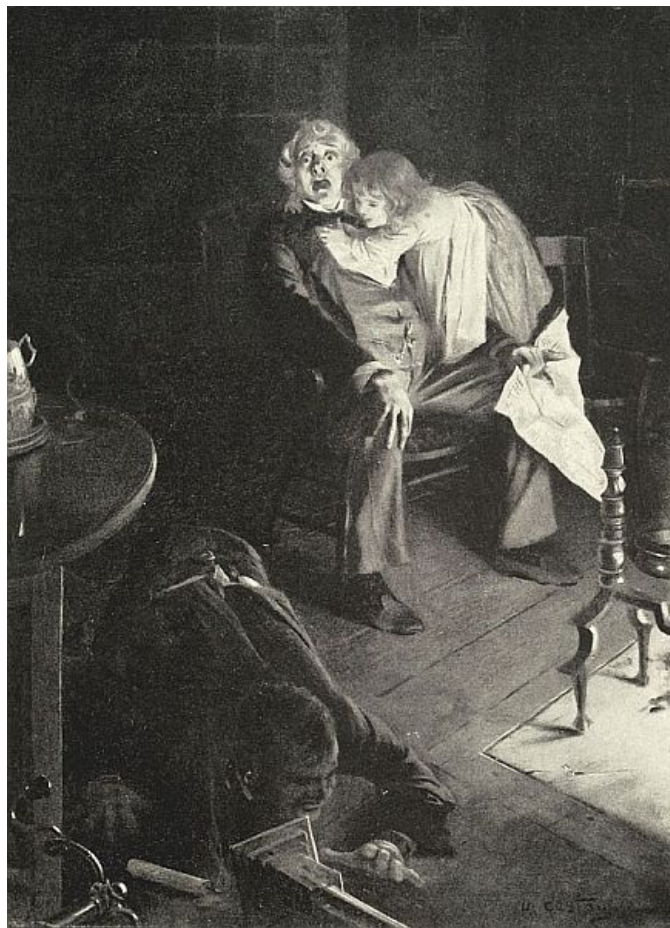
"Drinkwater Torm fell sprawling on the floor."

Bob was there, and it was the last time Polly ever sucked her thumb. She had almost gotten out of the habit anyhow, and it was in a moment of forgetfulness that she let Bob see her do it. He was a great tease, and when she was smaller had often worried her about it until she would fly at him and try to bite him with her little white teeth. On this occasion, however, she stood everything until he said that about a girl who wore a blue silk dress sucking her thumb; then she boxed his jaws. The fire flew from his eyes, but hers were even more sparkling. He paused for a minute, and then caught her in his arms and kissed her violently. She never sucked her thumb after that.