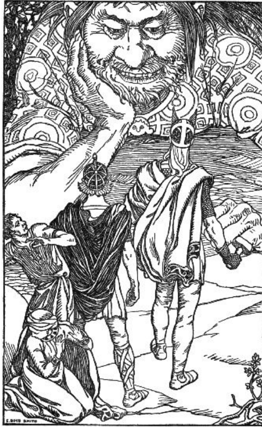
"I AM THE GIANT SKRYMIR" (page 150)

❦ ❦ ❦ IN THE DAYS OF GIANTS ❦ ❦ A BOOK OF NORSE TALES BY ABBIE FARWELL BROWN ❦ ❦ WITH ILLUSTRATIONS BY E. BOYD SMITH ❦ ❦