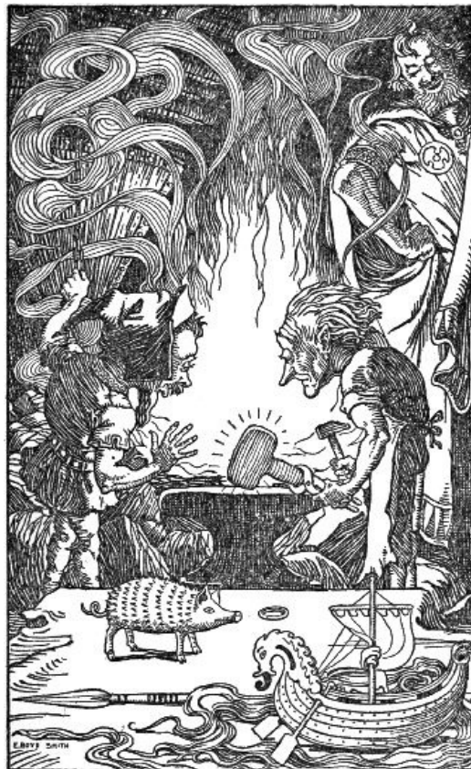
THE THIRD GIFT—AN ENORMOUS HAMMER

"Oh!" said Brock, much disappointed, "only an old iron hammer! I don't think anything of that . Look how short the handle is, too."