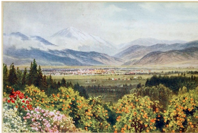
REDLANDS, LOOKING TOWARD SAN BERNARDINO RANGE

The secret of learning the mesa life is to sit still, to sit still and to keep on sitting still. The only other secret is to be learned in the wattled huts stuck like the heaps of the house-building rats in the dry washes, inwoven with the boughs of buckthorn and islay , except for size scarcely distinguishable from them. For the Indian has gone through all that green woof with the thread of kinship and found it an ordered world. He is choke-full as is the chamisal of wild life, of the tag ends of instincts and understandings left over from the days when he was brother to the beast—those sleek-bellied rats, stealing to lay another foot-long, dried stick to the characterless heap of their dwelling,—bad Indians to him, trying to remember their ways when they were men; that brown feathered bunch, in and out of the chia bush,—she was present at the making of man. Your aboriginal has the true sense of proportion: not size but vitality. You can cover the sage wren with the hollow of your hand, but you cannot hop so far for your size nor be so brave about it.