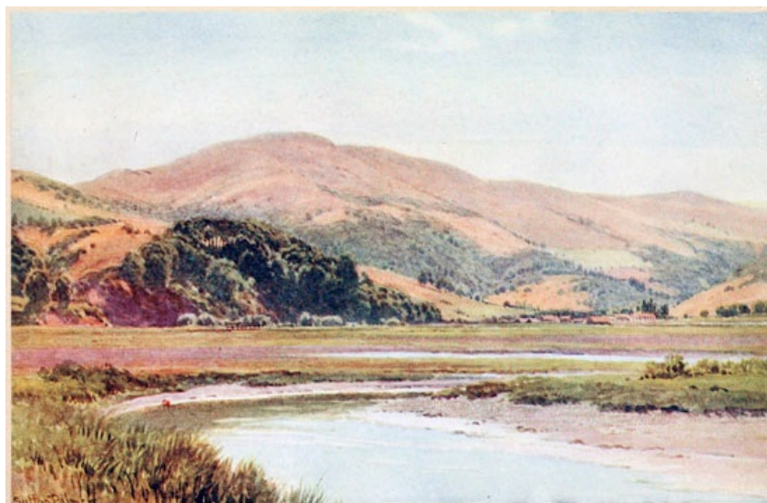
MILL VALLEY, AND BACKWATER OF SAN FRANCISCO BAY