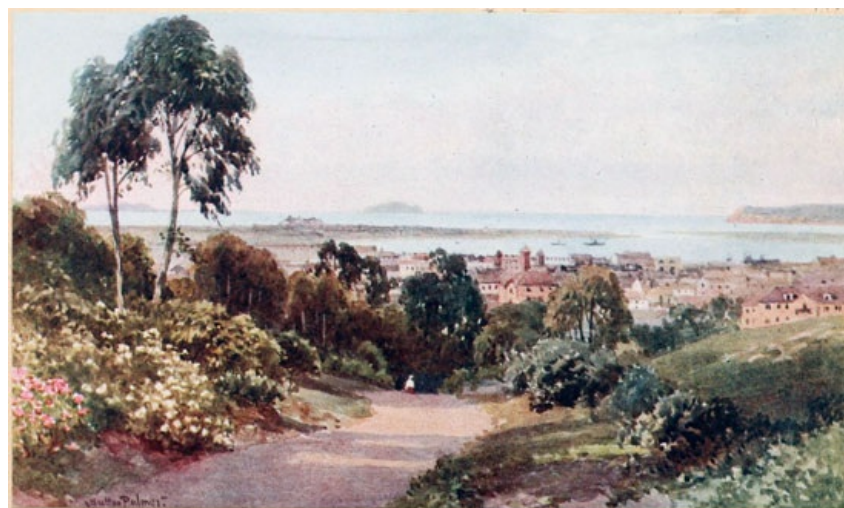
SAN DIEGO, LOOKING ACROSS THE BAY TOWARD POINT LOMA

Near at hand the masking growth is seen to be green, the dark olivaceous green of the chamisal. Nowhere does one get the force of the Spanish termination al —the place where—as in that word. The chamisal is the place of the chamise: miles and miles of it, with scarcely another shrub allowed, spread over the mesa and well up into laps and bays of the hills. It grows breast high, man high in the favoured regions; but even where under the influence of drouth and altitude it creeps to the knees, it abates nothing of its social character. Its ever-green foliage has a dull shining from the resinous coating which protects it from evaporation, and a slight sticky feel, characteristics that no doubt won it the name of "greasewood" from the emigrants who valued it chiefly because it could be burned green. The spring winds blowing up from the bay whip all its fretted surface to a froth of panicked white bloom, that, stirring a little as the wind shifts, full of bee-murmur, touches the imagination with the continual reminder of the sea. Higher up the thick lacy chaparral flecks and ripples, showing the light underside of leaves, and tosses up great fountain sprays of ceanothus, sea-blue and lilac-scented. [9]