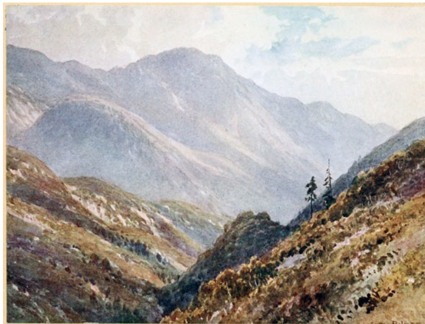
A CAÑON IN THE SIERRA MADRES

From the white landmark of San Juan Capistrano to a point opposite Santa Inez, saints thick as sea-birds, standing seaward, break the long Pacific swell: San Clemente, Santa Catalina, Santa Rosa—their deep-scored cliffs searched by the light, revealing their kinship with the parallel mainland ranges. But there are hints here, in the plant and animal life and in the climate, milder even than that of the opposing channel ports, hints which not even the Driest-Dustiness dare despise, of those mellower times than ours from which all fables of Blessed Islands are sprung. Islands "very near the terrestrial paradise" the old Spanish romancer described them. Often as not the imagination sees more truly than the eye. I myself am ready to affirm that something of man's early Eden drifted thither on the Kuro-Siwa, that warm current deflected to our coast, which, for all we know of it, might well be one of the four great rivers that went about the Garden and watered it. Great golden sun-fish doze upon the island tides, flying-fish go by in purple and