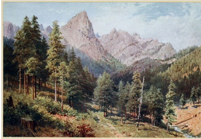
CASTLE CRAG, RATTLESNAKE CAÑON