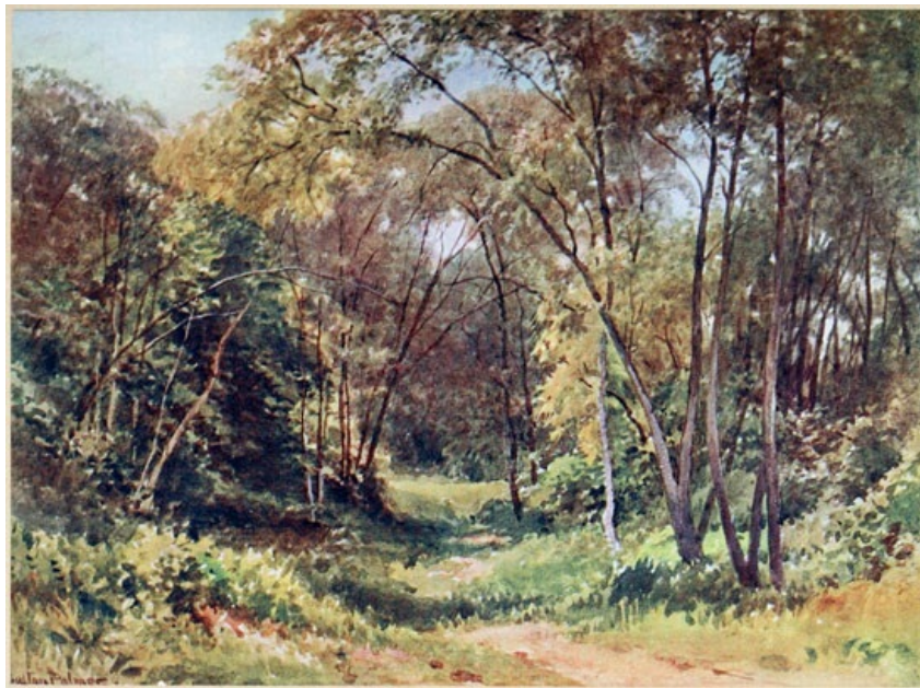
TALL CHAPARRAL, SANTA CRUZ