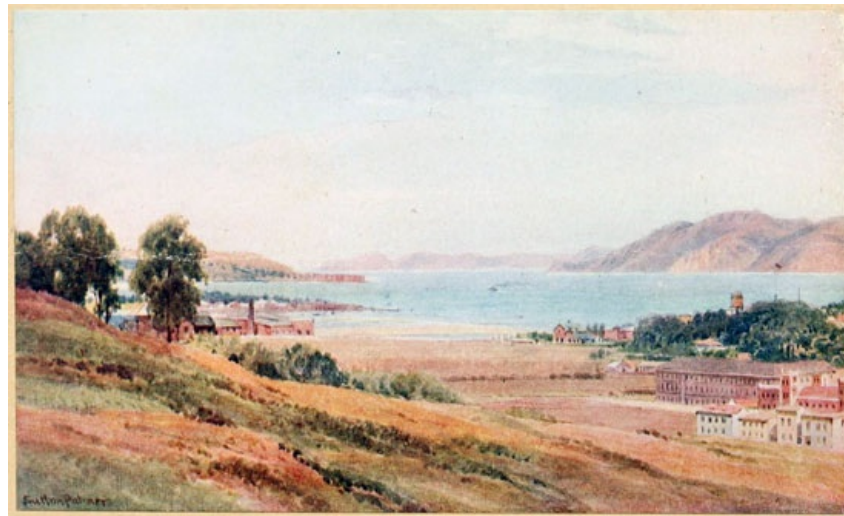
THE GOLDEN GATE AND BLACK POINT, FROM HYDE STREET, SAN FRANCISCO. (SITE OF THE PANAMA EXPOSITION, 1915)

"Eh, the Americanos ..." she shrugged; she moved to give a drink to the spotted musk, flowering in a chipped saucer; the subject did not interest her; her thought, like her flowers, had grown up in an enclosure. [105]