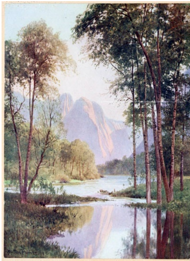
THE THREE BROTHERS, YOSEMITE VALLEY