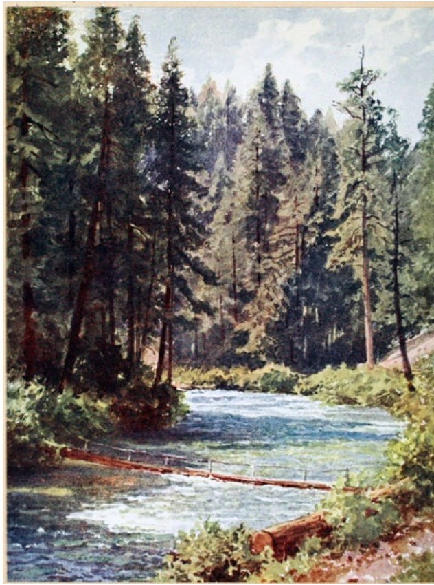
McCLOUD RIVER, UPPER SACRAMENTO VALLEY

It was at Angels in the foothills of Calaveras that Twain, to his everlasting fame, was so impressed with the performance of the Jumping Frog. But life at Angels and all up and down that placer country is as heavy with desuetude as the frog was after the bar-keeper had fed him with buckshot. As well try to get a draught of that old time as a drink at any of the dismantled bars, high, ornate, black walnut affairs across which, in dust and nuggets, passed and repassed probably as much gold as would serve to buy the orange belt of the San Joaquin—and for a figure of magnificence you would find nothing more acceptable to its inhabitants. [139]