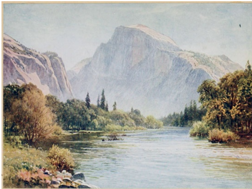
THE HALF DOME, YOSEMITE

All this country which I have described to you has so recently been sea that the mark of its old beach-line is plainly to be traced along the east Sierra wall. Still the evaporating water leaves vast deposits of salt and alkali, blinking white in the sink of Death Valley. There are lakes there still where the salt crusts over hard and clear like ice, and deep thick puddles of bitter minerals, the lees of that ancient inland ocean. From the top of any of the denuded desert ranges it is possible to trace the winding bays and estuaries, and, with an eye for location, to choose the points at which one may fairly expect to find potsherds, amulets, fire-blackened hearthstones, and the middens of a nameless people who built their primitive towns along its beaches. It must have had much to recommend it in those days before the sage-brush took it, for this inland sea, rather than the more mountainous Pacific shore, was the route taken by the ancient migratory peoples who left their undecipherable signs scored into the rocks from the Aztec country to the Arctic. On isolated igneous rocks near their old encampments, and high on the walls of the box canons, such as might have been tide-rifts, high above any mechanical contrivance of the present-day Indians, the records resist equally the shifts of sea and sand and the efforts of modern science to read them.