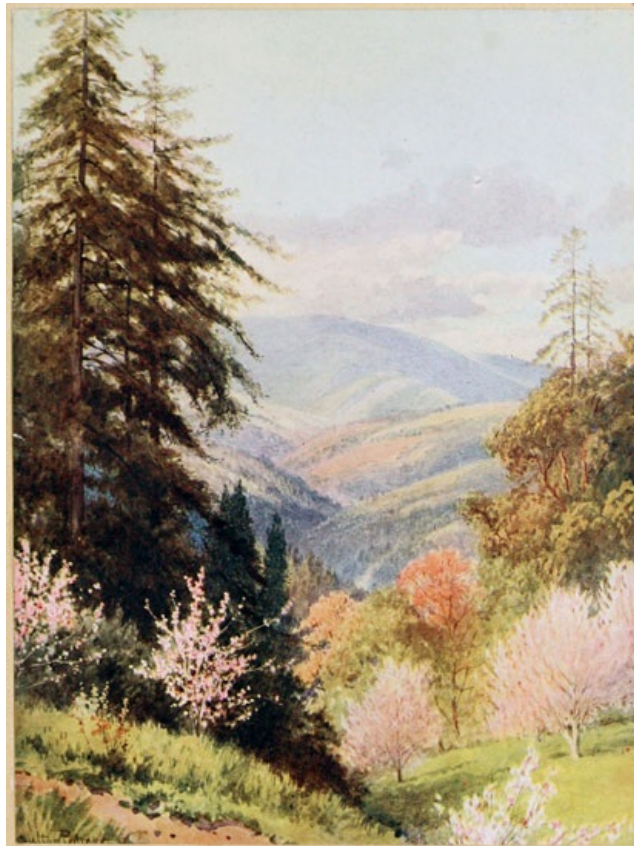
SANTA CRUZ MOUNTAINS, THE COAST RANGE

But once on the Carmel side of the peninsula, regret comes back very poignantly. The bay is a miniature of the other, intensified, the connoisseur's collection,—blue like the eye of a peacock's feather, fewer dunes but whiter, a more delicate tracery on them of the beach verbena, hills of softer contours, tawny, rippled like the coat of a great cat sleeping in the sun. Carmel Valley breaks upon the bay by way of the river which chokes and bars, runs dry in summer or carries the yellow of its sands miles out in winter a winding track across the purple inlet. It is a little valley and devious, reaching far inland. Above its source the peaks of Santa Lucia stand up; for its southern bulwark, Palo Corona. Willows, sycamores, elder, wild honeysuckle, and great heaps of blackberry vines hedge the path of its waters. [78]