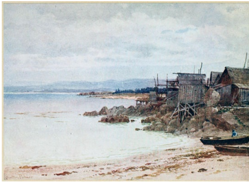
PESCADERO, A CHINESE FISHING VILLAGE, MONTEREY BAY