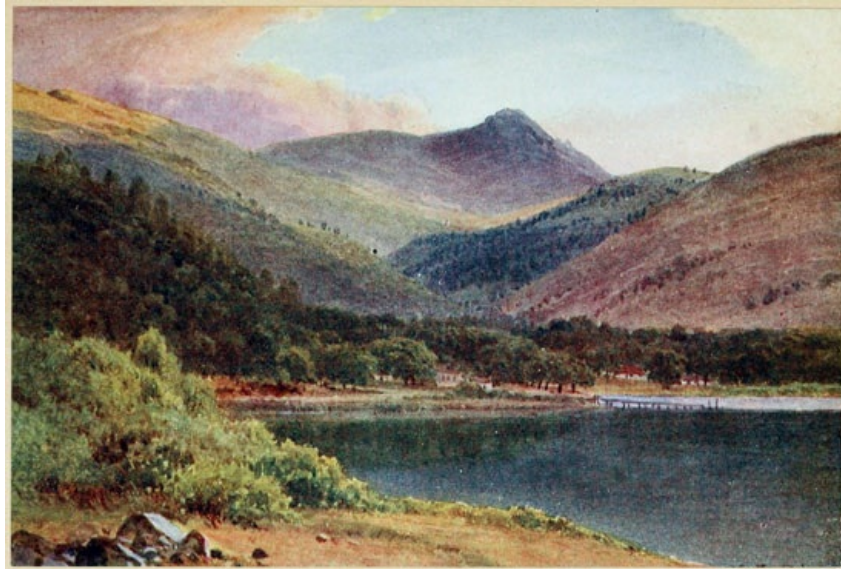
CLEAR LAKE, LAKE COUNTY