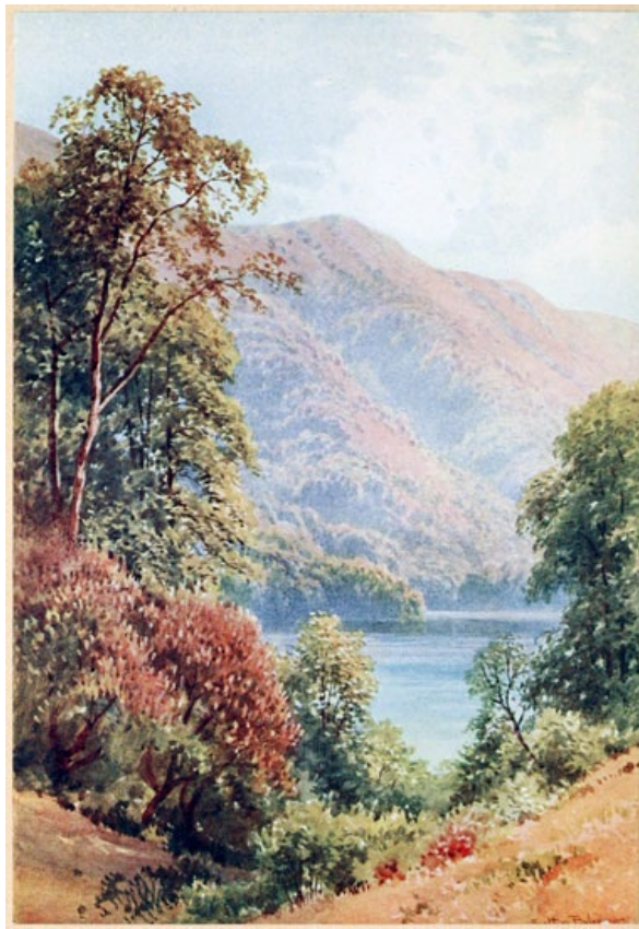
LAUREL LAKE, UPPER SACRAMENTO

The second redwood story, that wondrous space of blue-diffusing sun, between the deciduous underforest and the fairy web of redwood green, is bird and squirrel haunted. Jays flash back and forth, bright flickers of the humming-bird go buzzing by. Woodpeckers may be heard calling the ever-missing "Jacob, Jacob!" who must in their opinion be concealing himself somewhere about the upper story. The wire-drawn warble of the brown creeper follows the singer up and down the deeply corrugated trunks. Wrens, sparrows, juncos, all manner of little feathered folk in whose coats the tones of brown predominate, frequent the pillared middle rooms. Once I heard what I thought to be a hermit thrush, singing out of the dusk of Muir Wood. But I have not the art of knowing birds by note. People who live much in the redwoods find them silent; I think it might more easily be that the great trunks and green-shot glooms have the same quality of dwarfing sound as size. Redwoods, as I know them, are really lighter and more alive than any other coniferous forests, but the effect of umbrageous stillness is induced by vast proportions. [146]