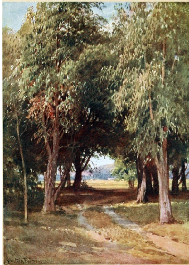
A EUCALYPTUS GROVE

orange groves, or the orderly array of vines trimmed low and balancing like small, wide-skirted figures in a minuet. And then the ground opens suddenly to deep, dry gullies where little handfuls of the grey soil gather themselves up and scuttle mysteriously under the cactus bushes, and dried seeds of the megarrhiza rattle with a muffled sound as the pods blow about. Here one meets occasionally the last survivors of the old way of life before men found it: neotoma , the house-building rat, with his conical heap of rubbish; or a road runner, tilting his tail and practising his short, sharp runs in the powdery sand under the rabbit brush; here, too, the lurking desert shows its spiny tips like a creature half-buried in the sand, not dead, but drowsing.