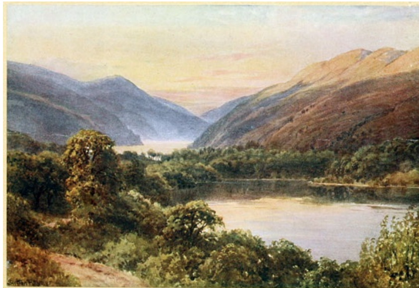
BLUE LAKE, LAKE COUNTY

The name Sequoia is one of the few cheering notes among our habitual botanical stupidities—an attempt to express quality as it is humanly measured in a name. There was once an American Cadmus, Sequoyah, a Cherokee who invented an Indian alphabet and taught his tribe to read. Seeing them outnumbered in their own territory, he started west with the idea of founding a great Indian empire. He was last seen trailing north across the desert and was heard of no more. Tradition has it that he reached the forest of the upper Kern River and gave the trees his name. At least no botanist with his nose in a book has usurped it.