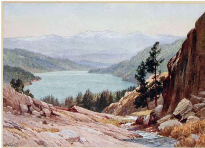
DONNER LAKE, ON THE OLD EMIGRANT TRAIL

Shasta is a brother of Fuji and Tacoma, one of those solitary crater peaks whose whiteness is the honourable age of fiery youth, a good mountain dead and gone to heaven. Do not go up on it; you will see a great deal more of what you have seen, wooded hills on hills and perhaps the sapphire belt of the sea, the glitter of lovely, sail-less lakes, but you will not understand it any better, for Shasta has no more to do with the abutting ranges than a great genius with the stock which produced him. This is a prophet among mountains, a vent from the burning heart of creation. One is not surprised to learn that the Indians hereabout count their descent from the Spirit of Shasta and the Grizzly Bear. That dark belt of forest circling the mountain's base looks to be the proper haunt for him, the lumbering, little-eyed embodiment of brute creation. It is well to think of those two things together, the rip of those mighty claws with a ton or two of brute bulk behind them, and the awful witness towering to the blue, and suffer the soul-satisfying fear that lies in wait for man in the great places of the earth. All our modern fears are mean, fears of the common opinion and the bill collector. Shasta will have done its best for you if it enables you to quake in the very marrow of consciousness.