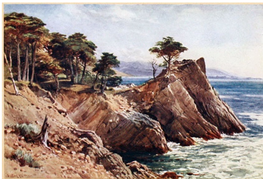
CYPRESS POINT, NEAR CARMEL

Three little towns have taken root on the Peninsula: two on the bay side, the old pueblo of Monterey with its white-washed adobes still contriving to give character to the one wide street; Pacific Grove, utterly modern, on the surf side of Punta de Pinos, a town which began, I believe, as a resort for the churchly minded—a very clean and well-kept and proper town, absolutely exempt, as the deeds are drawn to assure us, "from anything having a tendency to lower the