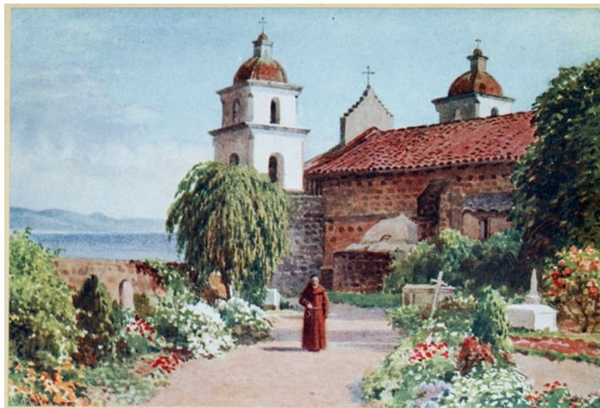
THE CEMETERY, SANTA BARBARA MISSION

Around Santa Margarita and Paso Robles filmy moss spreads a veil over the robles as of Druid meditation; one fancies them aloof from the stir of present-day life as they were from the bears that used to feed on the mast under them. A hundred years or so ago the Franciscans drove out the bears by an incantation—I mean by the exorcism of the Church enforced with holy water and a procession with banners around the Mission precinct: "I adjure you, O Bears, by the true God, by the Holy God ... to leave the fields to our flocks, not to molest them nor come near them." But bears or homo sapiens , it is all one to the oaks of San Antonio; indeed, if legend is to be credited, the four-footed brothers would have been equally as acceptable to the patron of the Mission where this interesting ceremony took place. I can testify, however, that after all this lapse of time the exorcism is still in force, for though I have been up and down that country many times I have seen no bears in it.