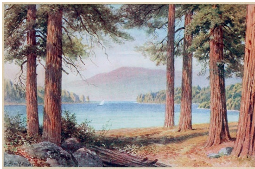
LAKE TAHOE, THE HIGH SIERRAS

In the Spring the rich florescence of the conifers sheds pollen in drifts that, carried down the melting water, warn the sheep-herder and the orchardist a hundred miles away of the advancing season. A pine forest in flower is one of the things worth seeing which is most seldom seen, for at its best the high passes are still choked by snow, the lakes ice-locked, the trails dangerous. And then the blossoms, yellow and crimson tassels and rosy spathes, are carried on the leafy crowns high over the heads of the most adventurous foresters. What one finds, as late as the end of June when the trails are open, is a stain of pollen on the lingering snow, and great clouds of it flying wherever a bough is brushed by a light wing. In the autumn the whole wood is full of the click and glint of the winged seeds. Storms of them, like clouds of locusts, are carried past on the wind, to be dropped in the nearest clearing or to find a chance lodging in a moss-lined crevice of the weathered headlands. [158]