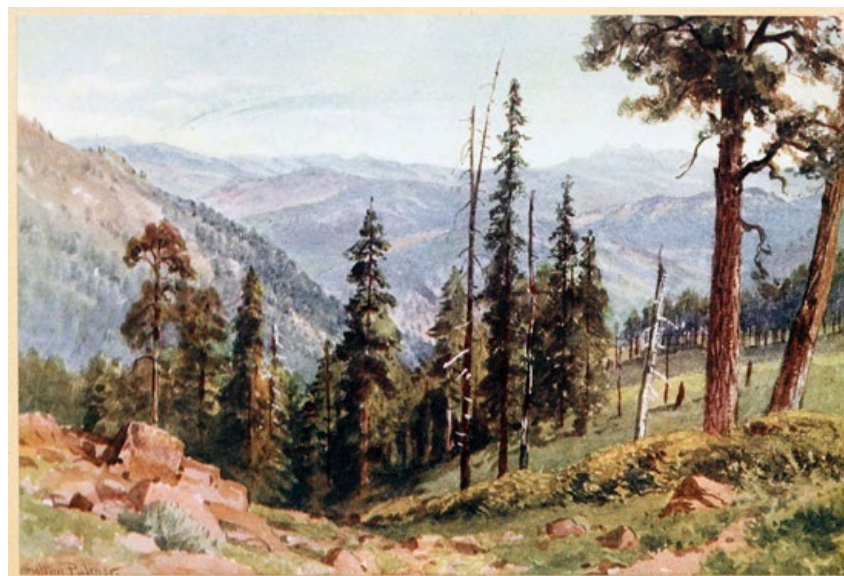
AMONG THE REDWOODS OF THE GREAT TWIN VALLEYS

Never was a land so planned for the uses of man, its shielding mountains, its deep alluvial terraces sloping gently to the sun. Men read it in the hieroglyphic the glistening waters spelled between the dark patches of the tulares, but it took some experimenting to read the message aright.