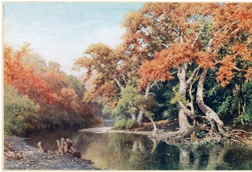
SYCAMORES, A COAST RANGE CAÑON