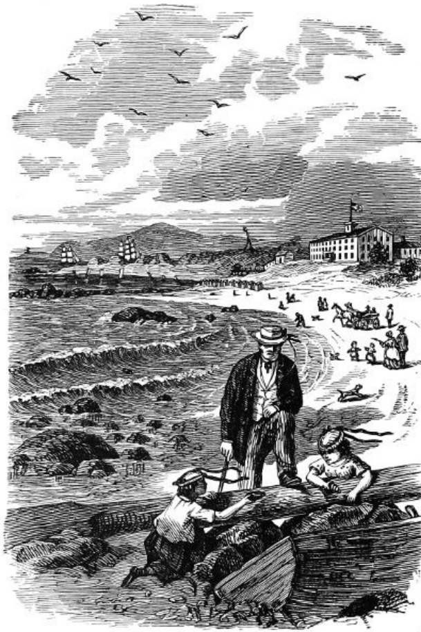
FRONTISPIECE. Bessie at Sea Side.