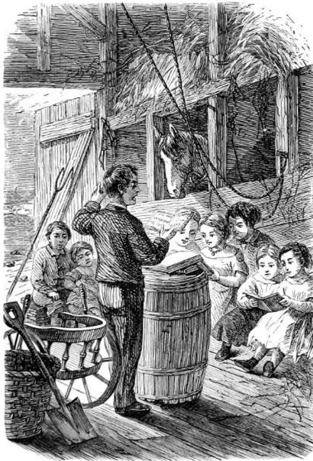
Bessie at Sea Side. p. 68

Next, Tom read how Jesus was born in Bethlehem of Judea, in a rough stable and laid not in a pretty cradle such as their baby brothers and sisters slept in, but in a manger where the wise men of the east came and worshipped Him: and how after Joseph and Mary had been told by God to fly into the land of Egypt with the infant Saviour, the wicked king, Herod, killed all the dear little babies in the land, with the hope that Jesus might be among them. When he came to any thing which he thought the children would not understand, he stopped and explained it to them. "Now we will sing again," he said, when he had done reading, "and the girls shall choose the hymns. Maggie, dear, what shall we sing first?"