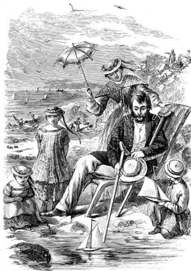
Bessie at Sea Side. P. 252.

Now this boy was a thief and a liar. Perhaps no one had ever taught him better; but however that was, he was quite willing to do anything wicked for the sake of a little money. He saw the soldier take out the roll of bank-notes, put them back again, and then drop the pocket-book on the sand, and he hoped no one would notice it, so that he might pick it up when they had gone.