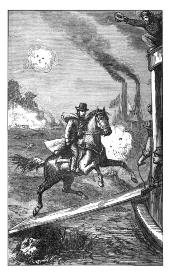
GRANT'S ESCAPE.-Page 123.

The troops discovered that Grant had no idea of surrendering, and they gathered themselves up for a fresh onslaught. The confusion was overcome, and the little army charged the enemy, who fought less vigorously than earlier in the day, and were again forced behind the bank of the river. But, as fresh troops were continually arriving from Columbus, there was no time to be wasted, and Grant pressed on for his transports. There was no unseemly haste, certainly nothing like a rout, or even a defeat. Everything was done in as orderly a manner as possible with undisciplined troops.