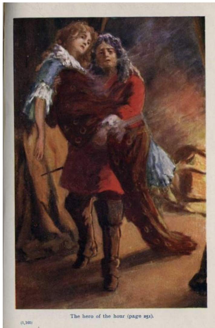
The hero of the hour (page 251 ).

The young man knew perfectly by this time that Wylde was somewhat feared in dramatic circles for his keen criticisms, his autocratic temper, and his scathing powers of retort. He knew, likewise, that he was regarded as something of an interloper—a man who had risen suddenly into notice by what might be called "back-stair" influence. Grey was fully aware himself that he had served no apprenticeship to his present calling, that he had stepped into success simply and solely through a series of happy accidents. He could not wonder that to others he should seem to be something of an impostor and a fraud. Whilst under the Old Lion's immediate patronage, nobody dared to flout or insult him; but he was sometimes conscious of an undercurrent of hostile jealousy directed against him, which increased with his increasing popularity with the public. He could not doubt that if some mischance were to befall him or his patron, his fall would be acclaimed in many circles with delight, as making room for another to fill his vacant place. And Grey, looking at the hollow cheeks and the gaunt frame of the Old Lion, hearing from time to time his painful coughing, began to fear that he, indeed, would not long be able to face the world or fight his own battle; and doubtful, indeed, did he feel of his own power and ability to fight that battle for himself single-handed.