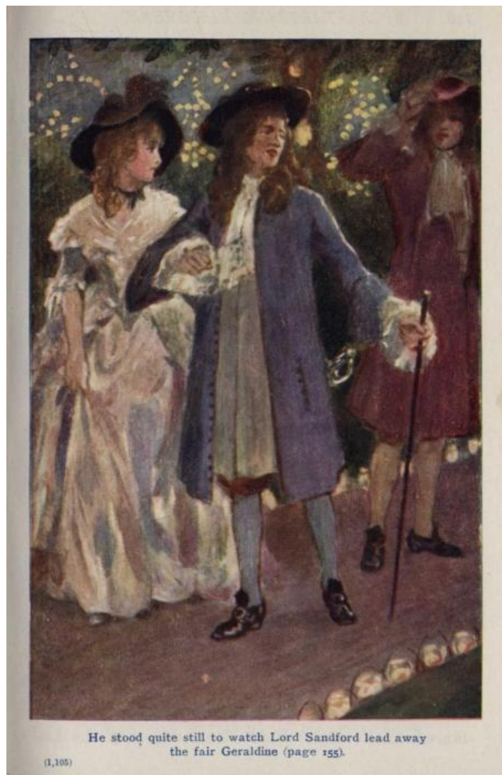
He stood quite still to watch Lord Sandford lead away the fair Geraldine (page 155 ).

Grey felt himself start, and was glad his face was turned away. He would not for worlds that the sharp mocking eyes of Lord Sandford should see him at this moment, albeit he had no notion of any sort that he had special interest in his spotless Lady Geraldine.