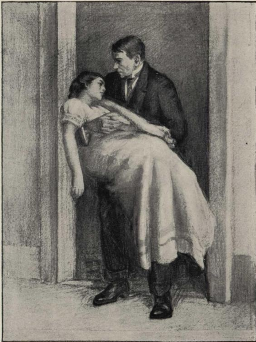
“ HE TOOK HER IN HIS ARMS AS THOUGH SHE WERE A LITTLE CHILD ” (page 97)

“HE TOOK HER IN HIS ARMS AS THOUGH SHE WERE A LITTLE CHILD” (page 97 )