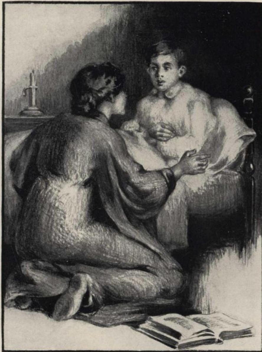
“LITTLE BROTHER, LITTLE BROTHER, LET ME TELL YOU A STORY AS I USED TO” (page 195)