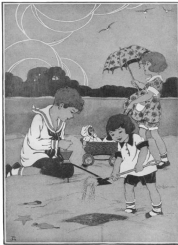
AT LAST THE CURLYTOPS WERE AT SUNSET BEACH, AND THEY LOVED IT VERY MUCH.

"What are you doing, Trouble?" asked Mr. Keller of William.