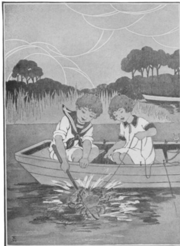
HE MADE A QUICK SCOOP WITH THE NET, AND OUT OF THE WATER CAME MR. CRAB.

Jimmie had a stone for his anchor—a stone tied on the end of a rope, the other end of the rope being fast to the boat. Teddy cast the stone anchor overboard. It fell in with a splash, the tide swung the boat around, facing up the bay, and the Curlytops cast their six lines of bait over the side. Each string was made fast to nails driven in the edge, or gunwale, of the boat for this purpose.