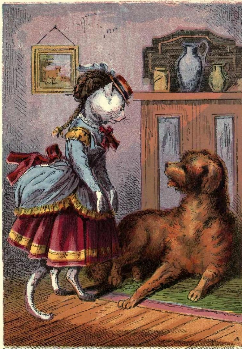
PUSS IN FULL DRESS.