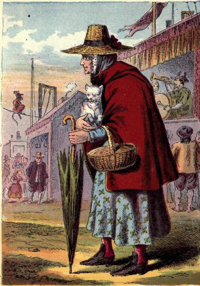
DAME TROT BUYS THE CAT.