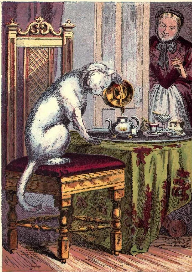
PUSS MAKING TEA.