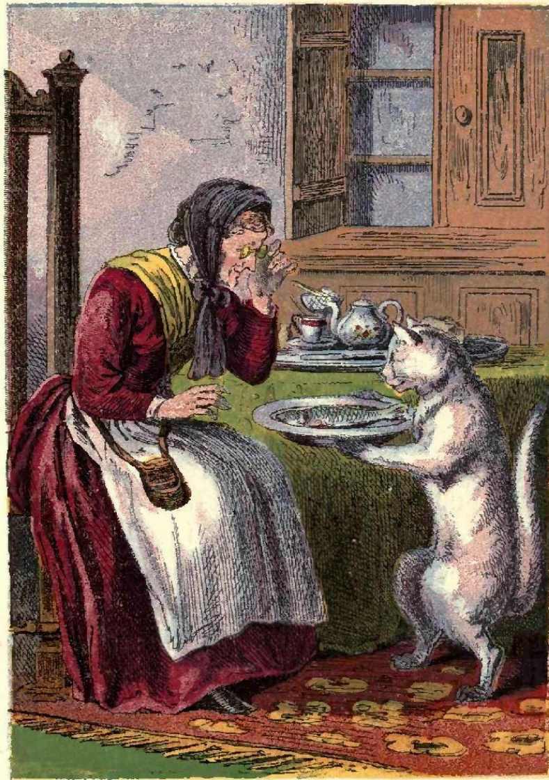
PUSS BRINGS A FISH.