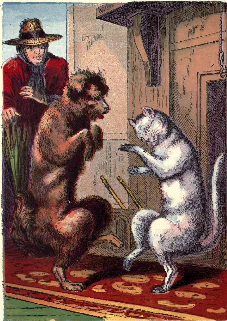
THE DANCING LESSON.