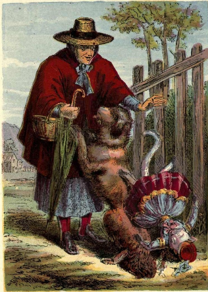
THE END OF THE RIDE.