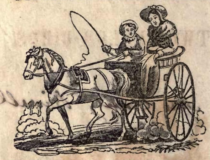
THE RIDE TO A FRIEND'S.—Page 12.