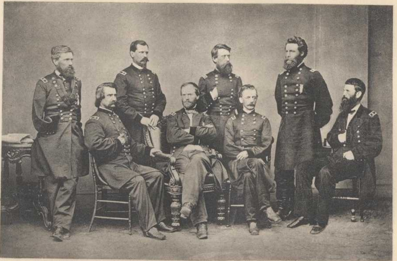
O. O. HOWARD.