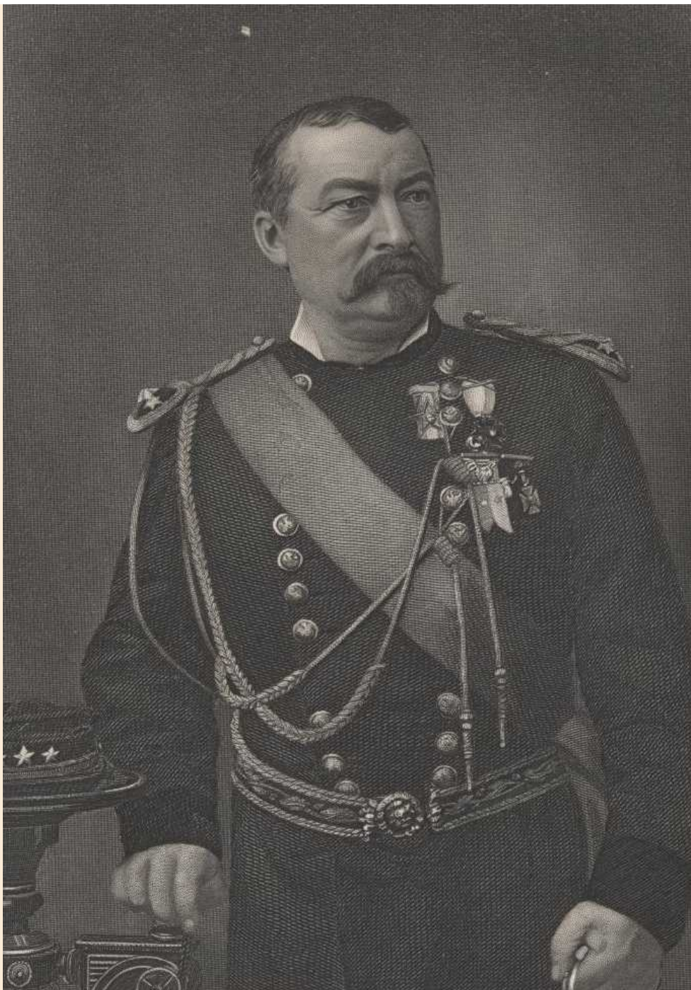
General Philip H. Sheridan