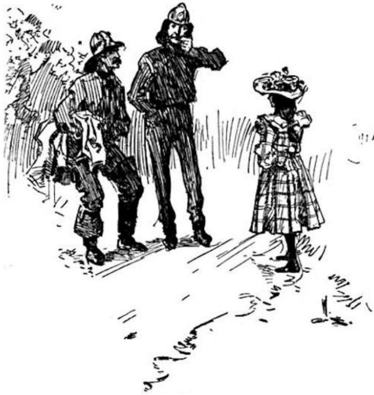
"The two firemen"

The Harris gentlemen were delighted to accept; and Ladybird gracefully apologized for not inviting the other members of the family by saying, "I'd love to ask you all, but I can only have eleven, and there are so many who seem to need invitations."