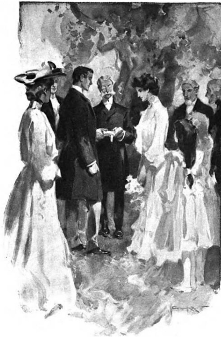
"The wedding under the trees"

It was perfectly lovely. The pretty outdoor wedding did full justice to all the traditions of Primrose Hall in the matter of festivities.