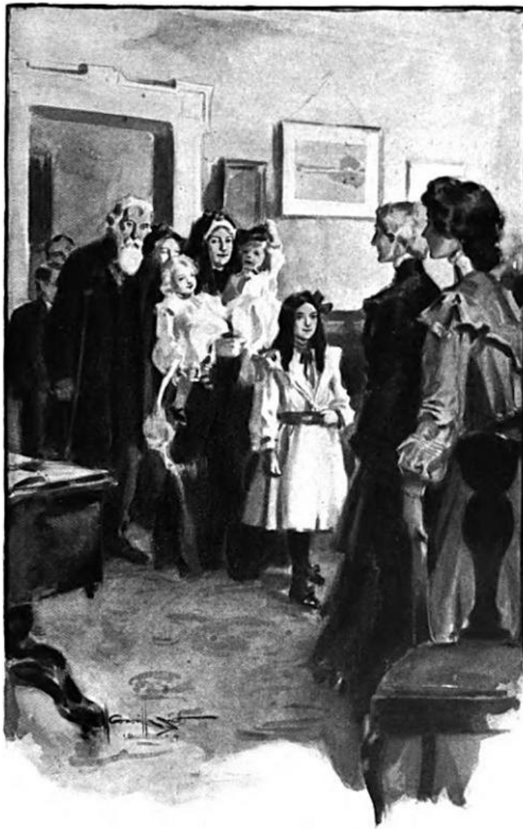
"Ladybird marshaling her guests"

The widow was of the affably helpless type, and encumbered as she was with fidgety impedimenta, found herself unable to offer the hand of fellowship.