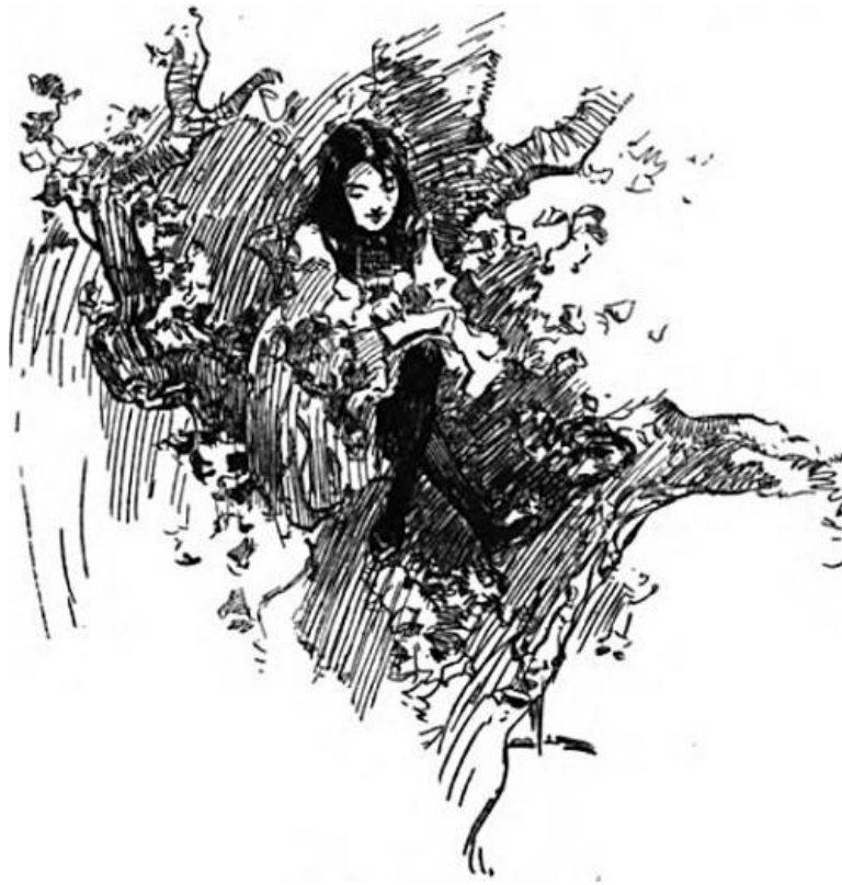
“Writing the letter”

Ladybird climbed one of her favorite apple-trees, settled Cloppy comfortably in her lap, and placing her paper pad on him as on a desk, prepared to write. A puckered brow was for a long time the only outward and visible sign of her inward and spiritual resolve to help her friend.