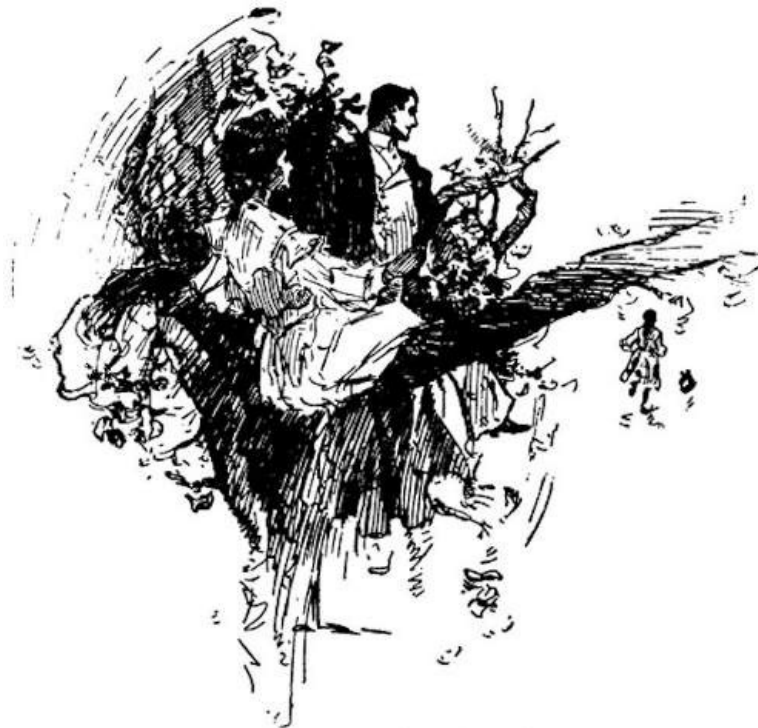
"Ladybird's flying figure"