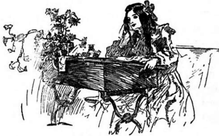
"Ladybird at school"

One day after he had added gaiety with especial assiduity, Miss Priscilla announced that she was at the end of her rope, and the dog must go.