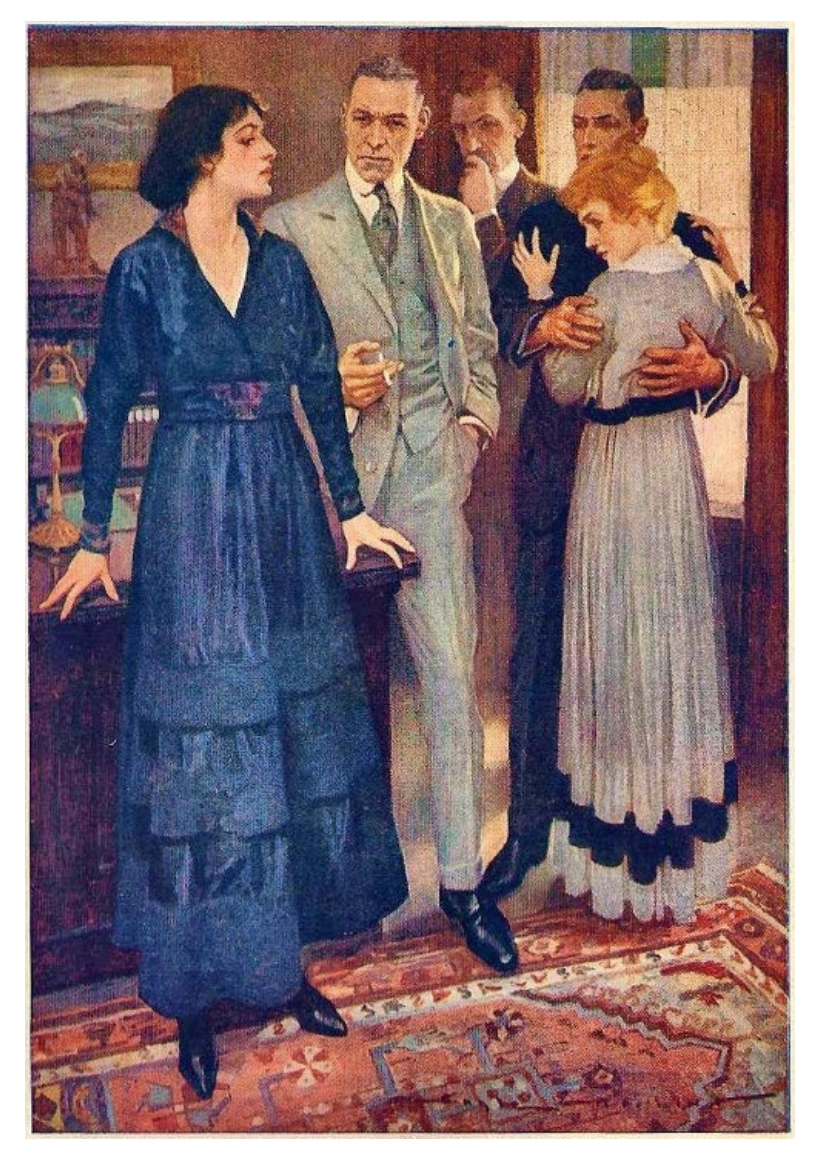
"I THINK YOU MUST ANSWER, MISS STUART," SAID STONE, GENTLY