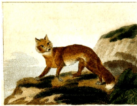
FIG. 63. Fox.