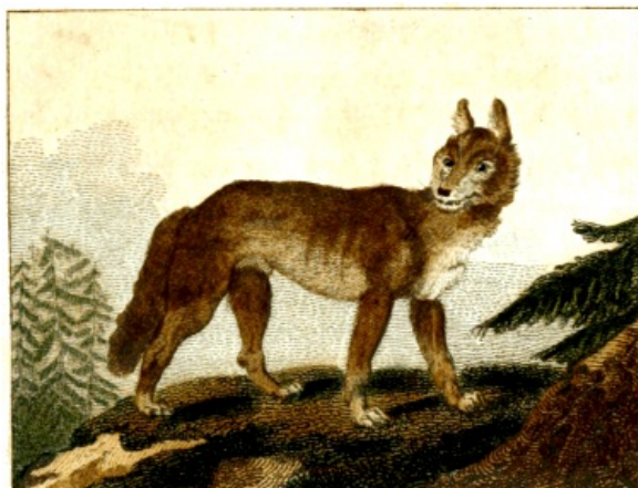
FIG. 62. Wolf.