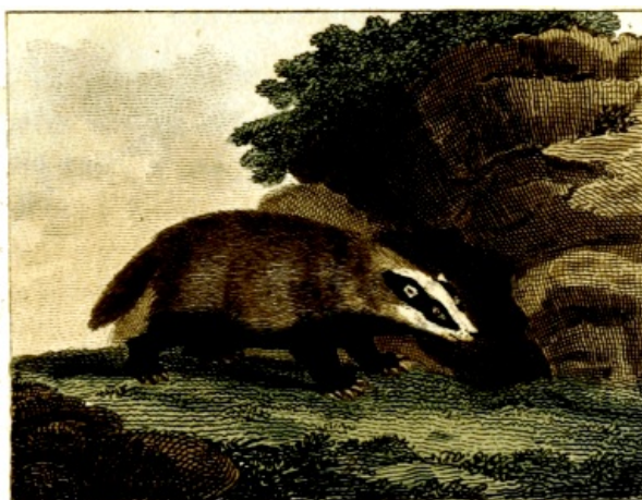
FIG. 64. Badger.