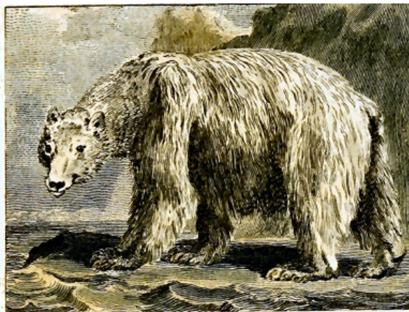
FIG. 93. White Bear.