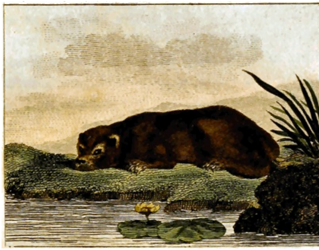
FIG. 65. Otter.