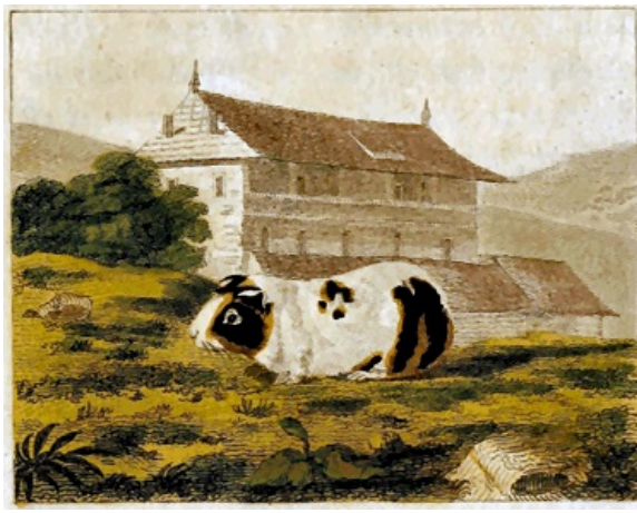
FIG: 79. Guinea-Pig.