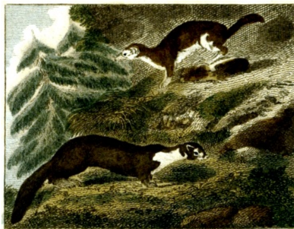
FIG. 68. Pine Weasel . FIG. 69. Weasel .