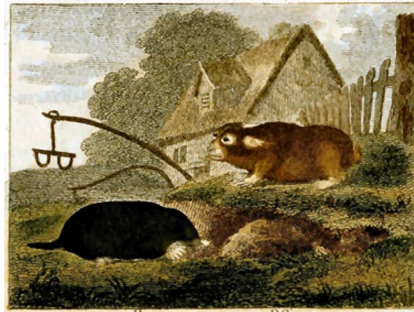
FIG. 82. Mole. FIG. 83. Cape Mole.