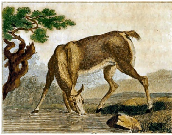
FIG. 55. Hind.