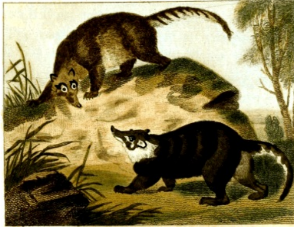
FIG. 96. Brown Coati. FIG. 97. Black Coati.