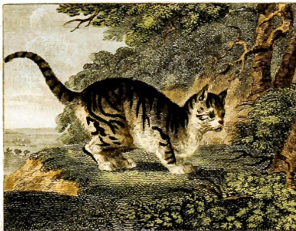
FIG. 50. Wild Cat.