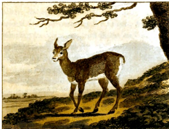
Fig. 59. Female.