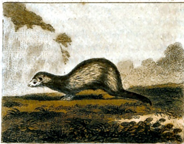
FIG. 67. Ferret.