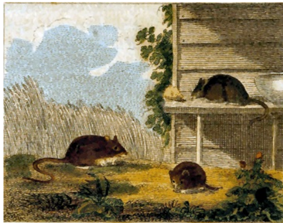
FIG. 76. Mouse.