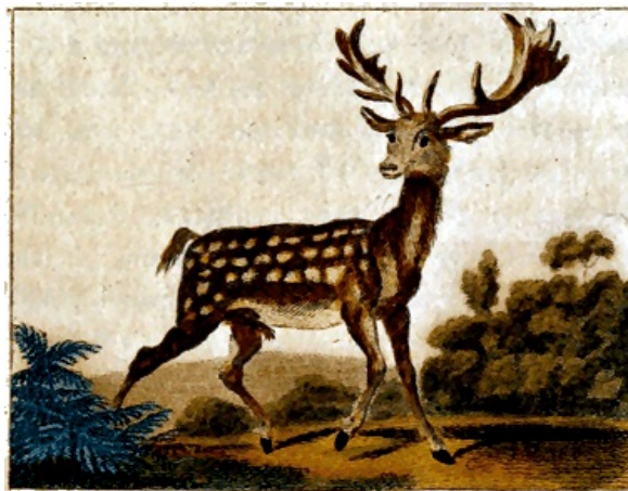
FIG. 57. Fallow Deer.