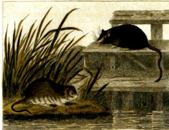
FIG. 75. Water Rat. FIG. 74. Rat.