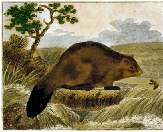
FIG. 94. Beaver