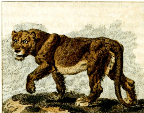
FIG. 100. Lioness.

The lion ( fig. 99. ) is furnished with a mane, or rather long hair, which covers all his fore-parts, and becomes longer as he advances in age; but the lioness, ( fig. 100. ) however old, is without this appendage. The American animal, which the natives of Peru call Puma, and the Europeans Lion, has no mane, and is smaller, weaker, and more cowardly, than the real lion. It is not impossible that the mildness of the climate in South America might have such influence on the nature of the lion as to strip him of his mane, reduce his size, and repress his courage; but it appears absolutely impossible that this animal, which inhabits the tropical regions only, and to whom Nature, to all appearance, has shut up every avenue to the north, should pass from the southern part of Asia or Africa into America, those continents being divided towards the south by immense seas. From this circumstance it is probable that the puma is not the lion, deriving its origin from those of the old continent and since degenerated, but that he is an animal peculiar to America, like other animals found on the new continent.