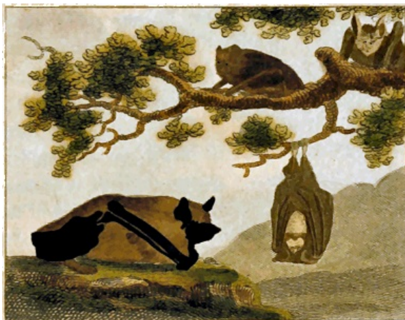
FIG. 89. Barbastelle Bat.