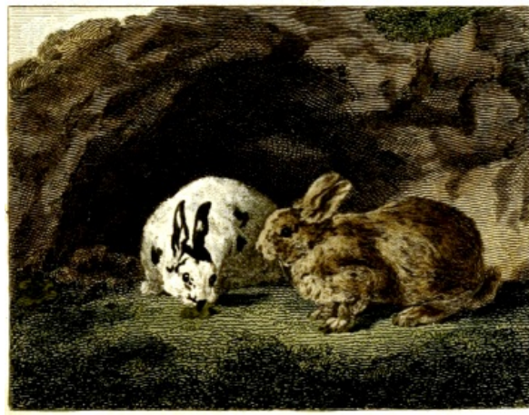
FIG. 61. Rabbits Domestic and Wild.

These animals live eight or nine years; and as they pass the greater part of their lives in burrows, where they remain in repose and tranquillity, they grow much fatter than hares. Their flesh is also very different, both in colour and taste. That of the young rabbit is very delicate, but the flesh of the old ones is always hard and dry. They were originally, as I have already observed, natives of hot climates. They were known to the Greeks; and it appears that the only countries in Europe where they anciently existed were Greece and Spain. From thence they were brought into the more temperate climates of Italy, France, England, and Germany, where now they are naturalized; but in colder climates, as Sweden, and other northern parts, they can scarcely be reared in the house, and perish if they are left in the fields. On the contrary, they thrive in excessive heat, for we meet with them in the southern parts of Asia and Africa, as about the Persian Gulph, the Bay of Saldana, in Lybia, Senegal, and Guinea. We also meet with them in our American Islands, whither they have been transported from Europe, and have thriven extremely well.