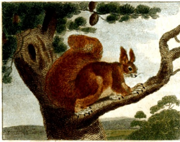
FIG. 73. Squirrel.