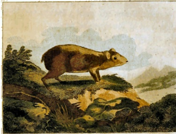
FIG. 98. Agouti

Some authors suppose that the sow badger, and the taxus suillus , of which Aldrovandus has given a figure, to be the same as the coati; but if we consider that the sow-badger, of which hunters speak, is supposed to be found in France, and even in some colder climates of Europe, and that, on the contrary, the coati is only known in the southern parts of America, this idea must be rejected, as having no foundation to support it; as the figure given by Aldrovandus is nothing more than a badger, to which the snout of a hog has been added. That author does not say this taxus suillus was drawn from Nature, nor does he give any description of the animal itself; and indeed the snout alone of the coati is sufficient to distinguish it from any other quadruped.