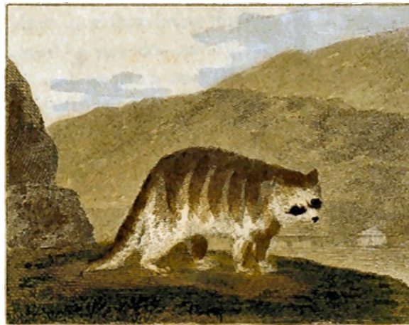
FIG. 95. Raccoon

The beaver uses its fore-feet like hands, with as much facility as a squirrel; the toes of the hind-feet being connected by a strong membrane, supply the place of fins, and expand like those of a goose, which the beaver somewhat resembles in its walk. He swims much better than he runs; and as his fore-legs are much shorter than his hind ones, he always moves along with his head very low and his back arched. His senses are very acute, and that of smelling so delicate, that he will not permit any dirt or filth to remain near him. When kept in confinement too long, and he is under the necessity of voiding his excrements, he drops them close to the threshold of the door, and as soon as that is opened pushes them out. This habit of cleanliness is natural to them, and our young beaver never failed to purify his apartment in this manner. At the age of one year he gave a sign of ardour for a female, which seems to be a proof he had then nearly attained his full growth; therefore their duration of life cannot be very long, and it is probably wrong to extend it to fifteen or twenty years. The beaver I had was very small for his age; a circumstance that is not surprising, since he had been in perpetual confinement from his earliest days, and from being unacquainted with water until he was nine months old, he could be expected to grow and expand like those who, while they enjoy their liberty, range at pleasure in that element which seems to be almost as necessary to them as that of land.