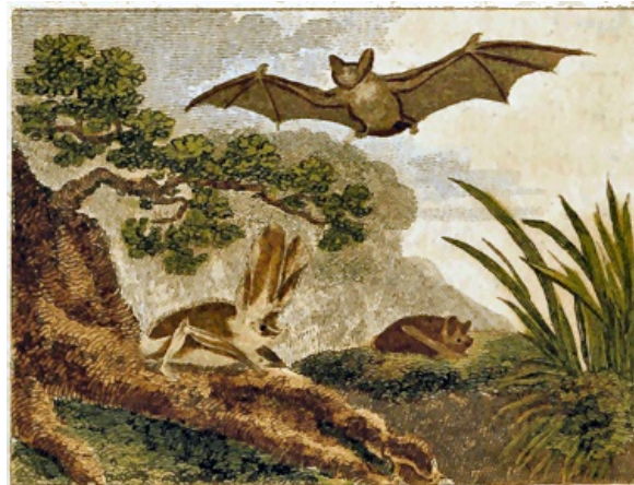
FIG. 86. Common Bat. FIG. 84. Long Ear'd. FIG. 85. Pipistiell.