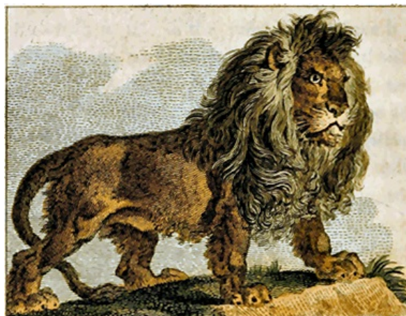
FIG. 99. Lion.