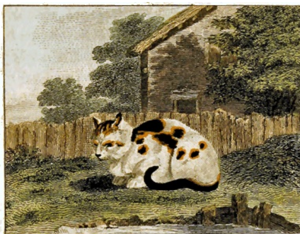
FIG. 51. Domestic Cat.