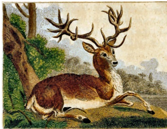
FIG. 54. Stag.