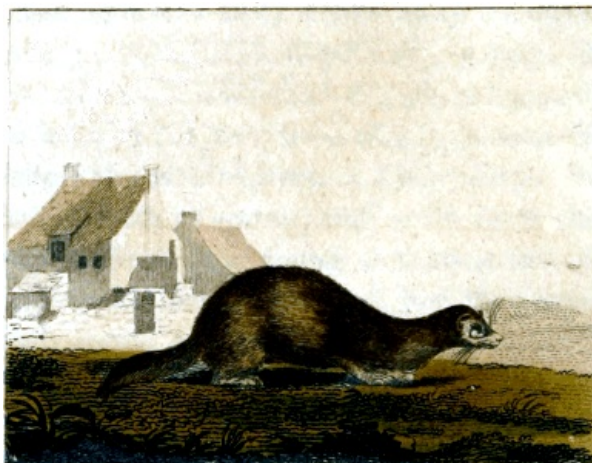
FIG. 66. Pole Cat.