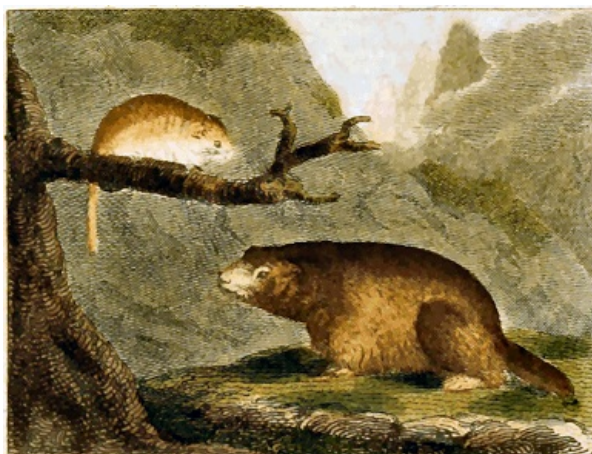
FIG. 90. Dormouse. FIG. 91. Alpine Marmot.