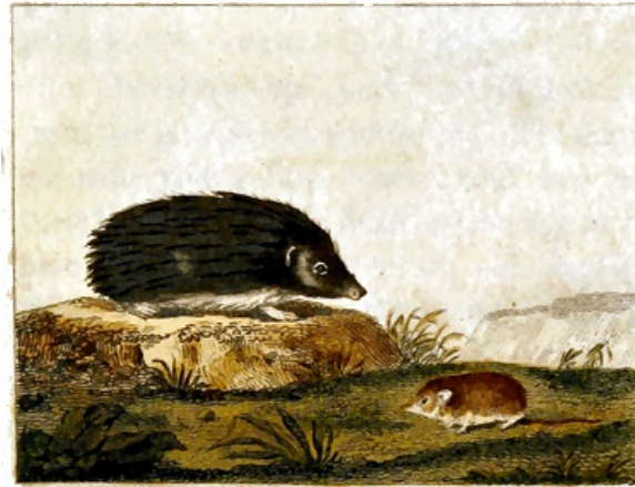
FIG: 80. Hedge Hog. FIG: 81. Shrewmouse.