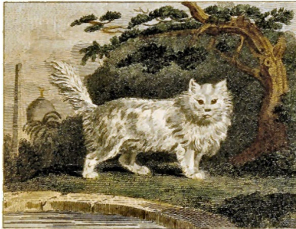
FIG. 53. Angora Cat.