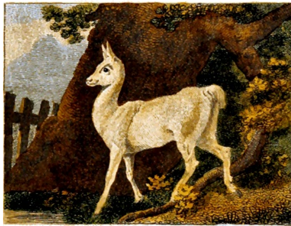
FIG. 56. Female Fallow Deer.