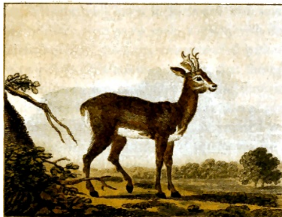
Fig. 58. Roe-buck.