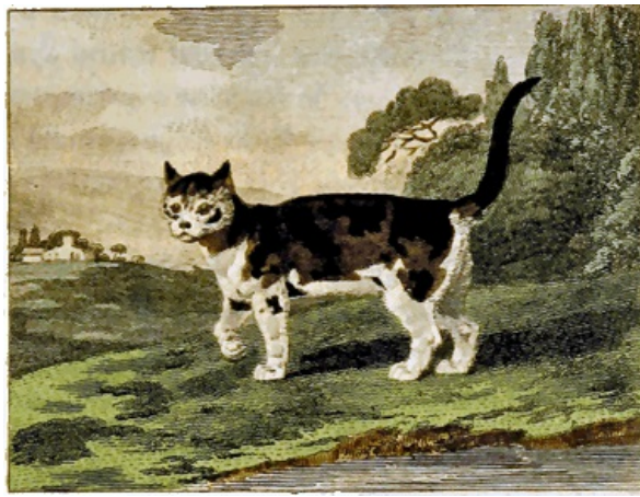
FIG. 52. Spanish Cat.