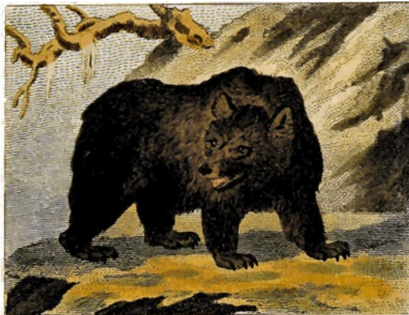
FIG. 92. Brown Bear.