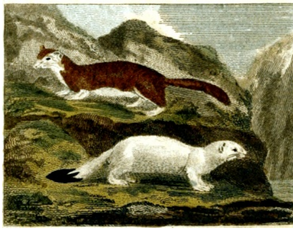
FIG. 71. Roselet . FIG. 70. Ermine .