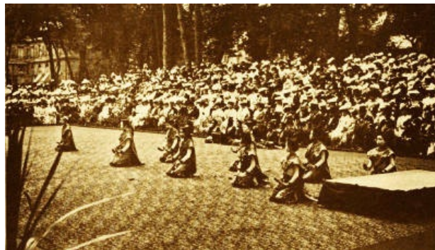
KING SISOWATH'S DANCERS BEFORE THE PRESIDENT AT THE ÉLYSÉE PALACE

Lastly, the head-dress consists of either the traditional pnom —a sort of pointed hat, all of gold and fastened on by clutches that grip the head—or a wreath of enormous flowers, or else of a pale-tinted silk handkerchief rolled low over the temples.