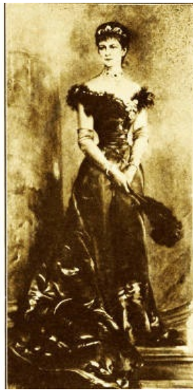
THE EMPEROR AND EMPRESS OF AUSTRIA