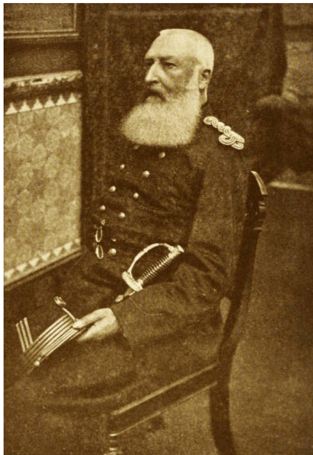
KING LEOPOLD II.

"Send away the carriage, monsieur le chambellan. We'll go to the hotel on foot. I want to stretch my legs a bit!"