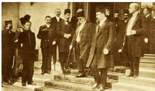
THE SHAH LEAVING THE ÉLYSÉE PALACE FOR A WALK

He would also fall a victim to sudden erotic fancies that sometimes caused me moments of cruel embarrassment. I remember that, one afternoon, when we were driving in the Bois de Boulogne, near the lakes, Muzaffr-ed-Din noticed a view which he admired, ordered the carriages to stop and expressed a desire himself to take some snapshots of the charming spot. We at once alighted. A little further, a group of smart ladies sat chatting gaily without taking the smallest heed of our presence. The Shah, seeing them, asked me to beg them to come closer so that he might photograph them. Although I did not know them, I went up and spoke to them and, with every excuse, explained the sovereign's whim to them. Greatly amused, they yielded to it with a good grace. The Shah took the photograph, smiled to the ladies and, when the operation was over, called me to him again: