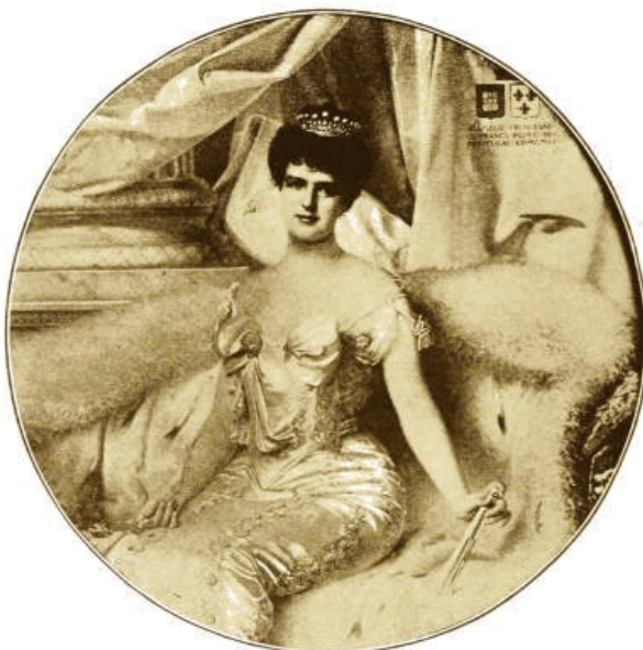
QUEEN AMELIE OF PORTUGAL

Note: Images of the original pages are available through Internet Archive. See https://archive.org/details/theirmajestias00paoluoft