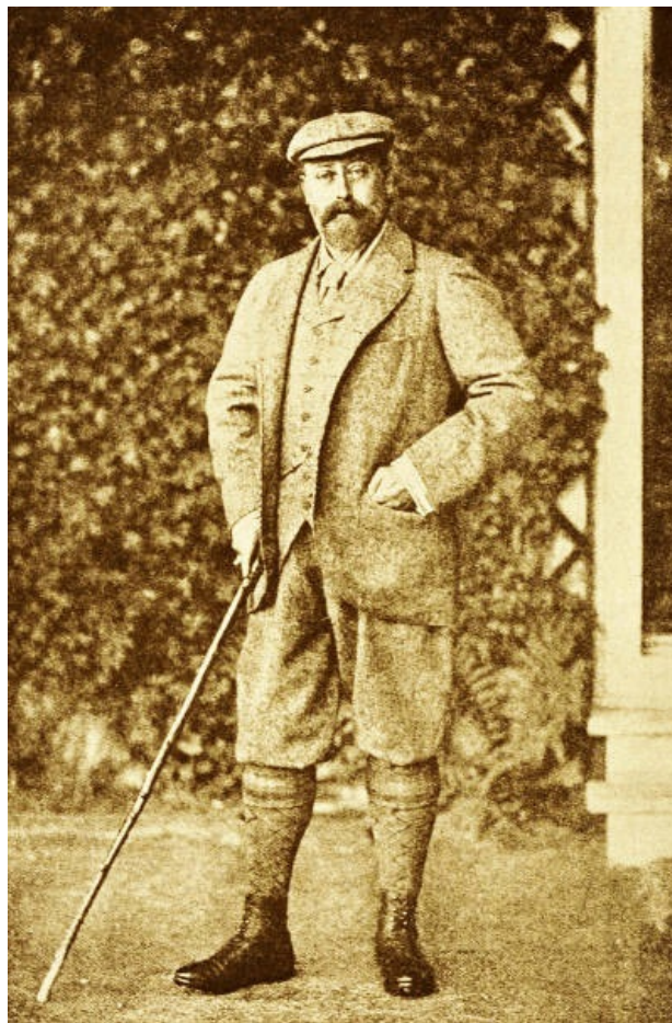
KING EDWARD VII

The good women handed the Duchess their bouquets; and I then saw that they were shy and at a loss what to do or say next. So I whispered to them: