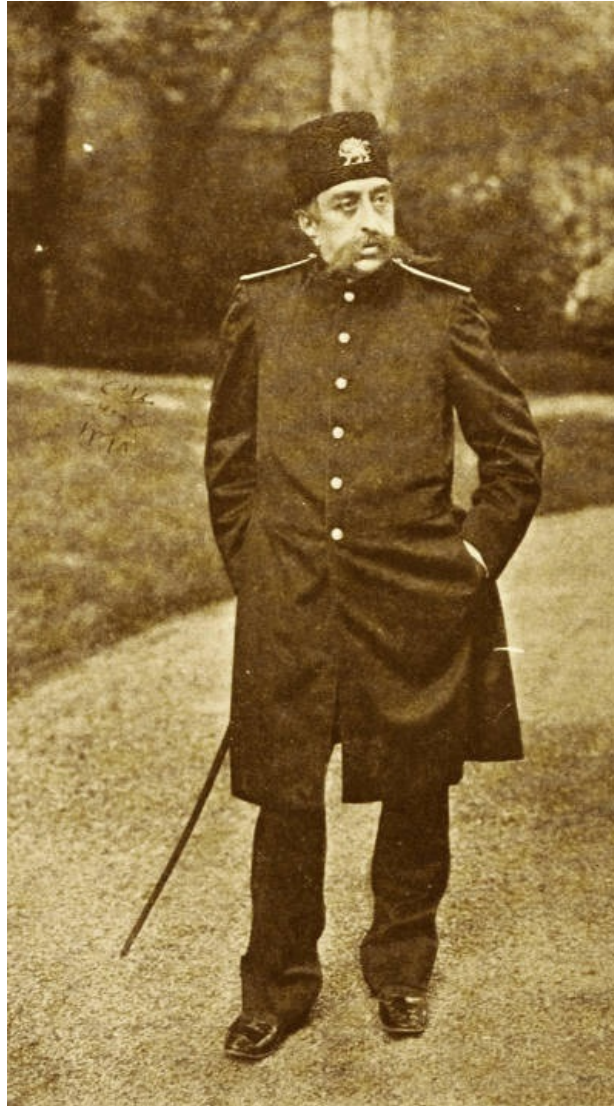
THE SHAH OF PERSIA

Repressing a terrible wish to laugh, I resolved to reassure our guest with a lie: "Why, I know them!" I replied. "I know their names: they are decent working-men." Muzaffr-ed-Din's face lit up at once: "You seem to know everybody," he said, giving me a grateful look.