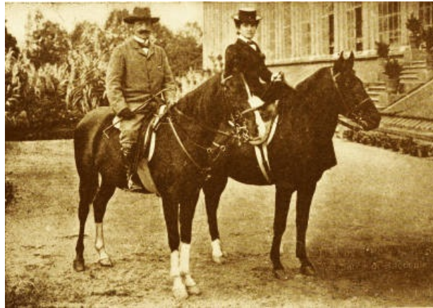
THE KING AND QUEEN OF ITALY

I little thought, on the afternoon when I caught so unexpected a glimpse of Queen Helena in a Milan glove-shop, that, two years later, I was to have the honour of attending both Her Majesty and the King during their journey to France. It was their first visit to Paris in state; and our government attached considerable importance to this event, which accentuated the scope of what Prince von Bülow, at that time chancellor of the German Empire, called, none too good-humouredly, Italy's "little waltz" with France.