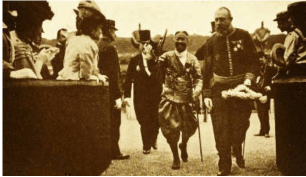
THE KING OF CAMBODIA