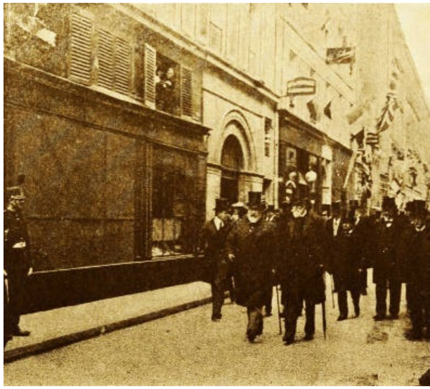
KING EDWARD ON THE WAY TO CHURCH