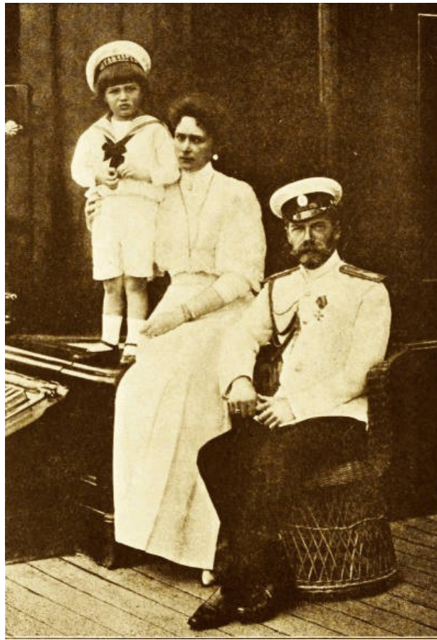
THE EMPEROR AND EMPRESS OF RUSSIA AND THE GRAND DUKE ALEXIS