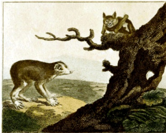
FIG. 176. Loris. FIG. 177. Javelin Bat.