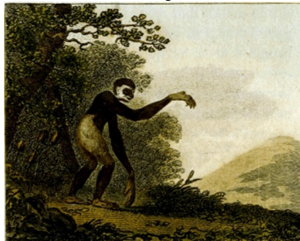
FIG. 196. Small Gibbon.