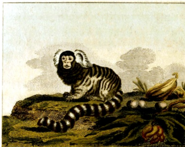
FIG. 217. Ouistiti.