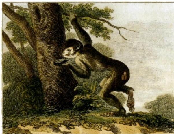
FIG. 197. Magot.