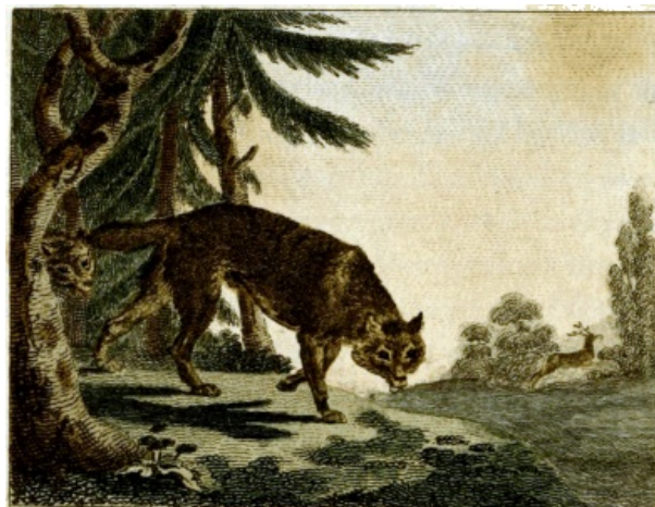
FIG. 181. Jackal.