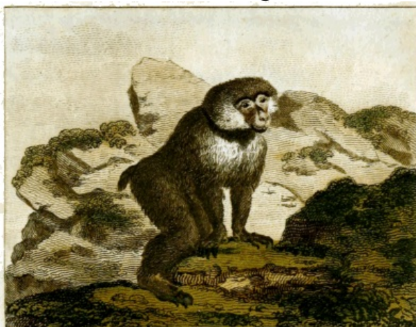
FIG. 198. Large Baboon.

This ape ( fig. 197. ) is two feet and a half, or three feet high, in its erect posture; but the female is not so large as the male. It prefers to walk on all four rather than on two feet. When it sleeps it is almost always sitting; supporting itself on two very prominent callosities on its posteriors; and the anus being placed higher, his body is more inclined when sitting than that of man. It differs from the pithecos ; first, in the form of its snout, which is thick and long, like that of a dog; whereas, the pithecos has a flat visage. Secondly, in having long canine teeth. Thirdly, its nails are neither so flat nor so round; and, fourthly, because it is larger, and of a more sullen and untractable disposition.