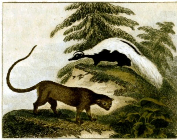
FIG. 185. Potot. FIG. 186. Chinch.