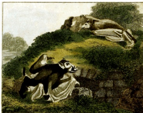
FIG. 178. Lame Headed Bat. FIG. 179. Shrew Bat.