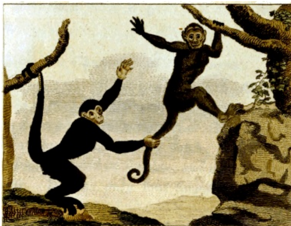
FIG. 213. Coati. FIG. 214. Brown Capuchin.