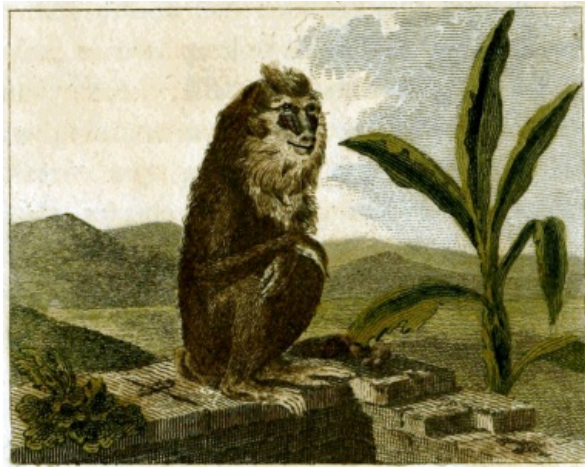
FIG. 199. Mandrill.