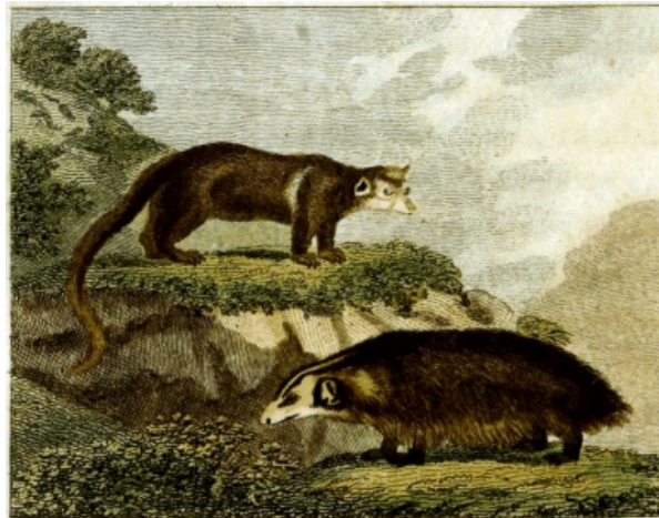
FIG. 184. Kmeajou. FIG. 183. Carcajou.