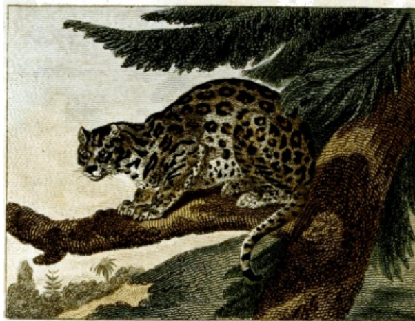
FIG. 180. Ocelot.