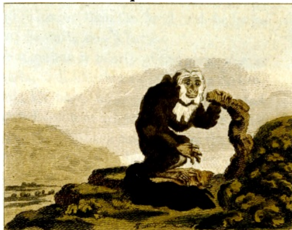
FIG. 216. Saki.