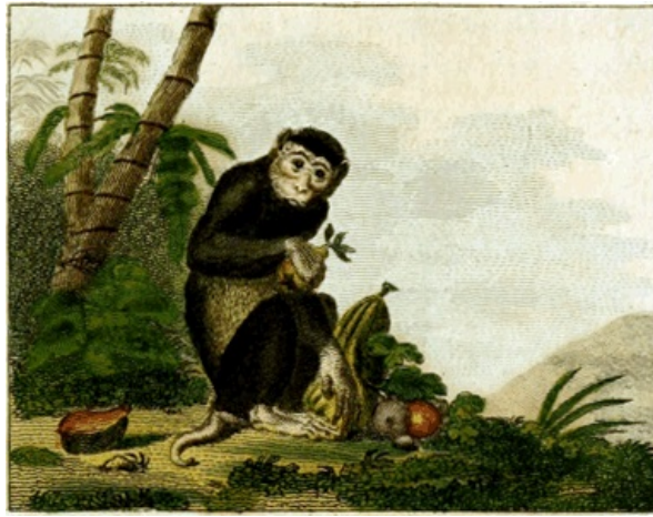
FIG. 201. Maimon.