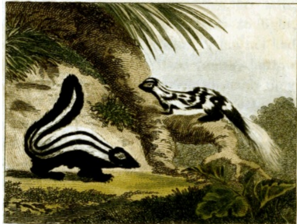
FIG. 187. Conepate. FIG. 188. Zorille.