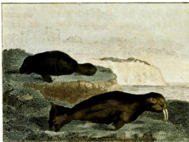
FIG. 193. Walrus. FIG. 194. Manati.