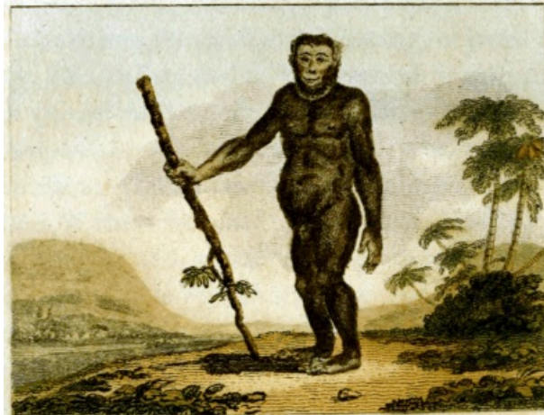
FIG. 195. Jocko.