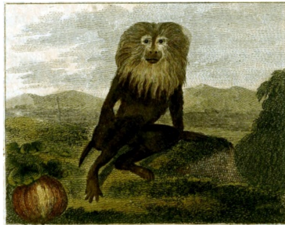
FIG. 200. Ouanderou.