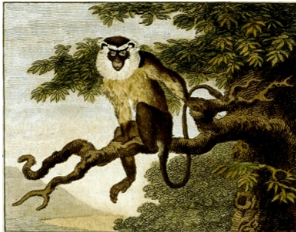
FIG. 209. Mona.