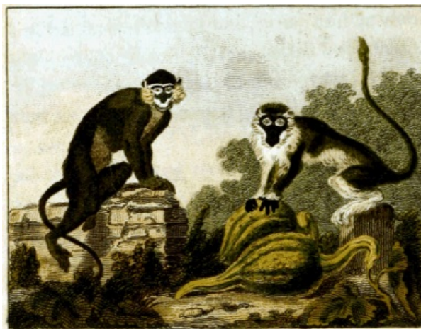
FIG. 210. Moustac. FIG. 208. Callitrix.