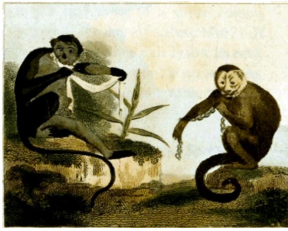
FIG. 211. Talapoin. FIG. 215. Sai.