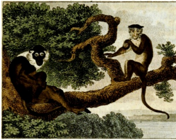
FIG. 206. Mangabey. FIG. 207. Chinese