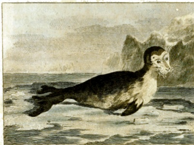
FIG. 192. Seal.