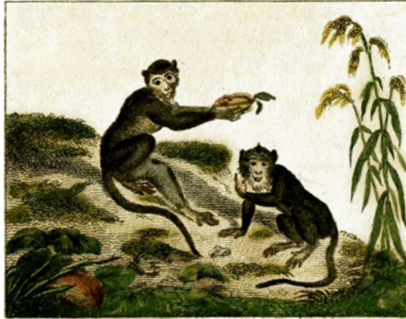
FIG. 202. Macaque. FIG. 203. Aigrette.