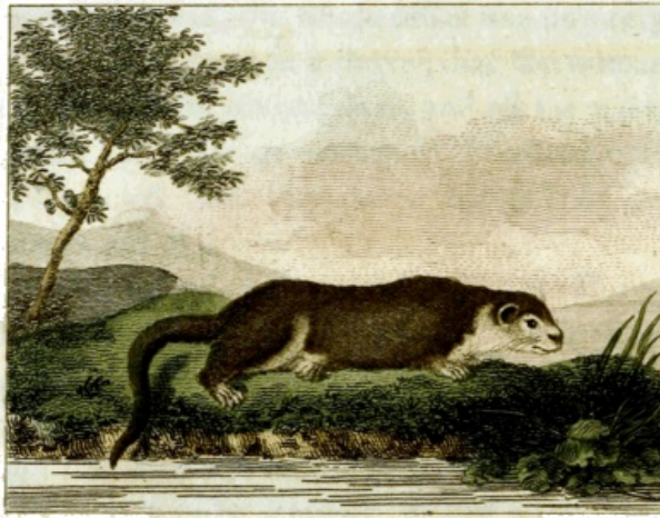
FIG. 191. Canadian Otter.