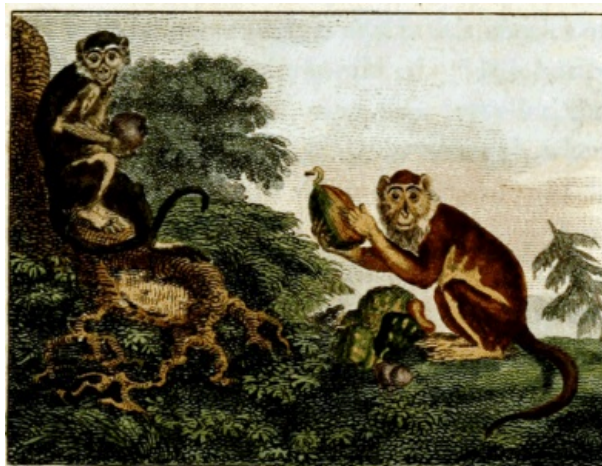
FIG. 204. Malbrouck. FIG. 205. Black Banded