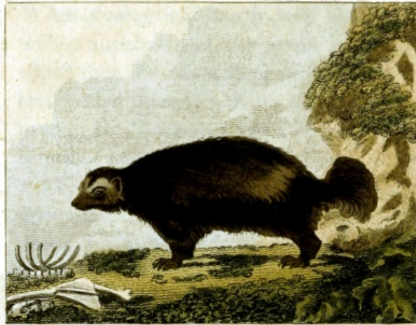
FIG. 182. Glutton.