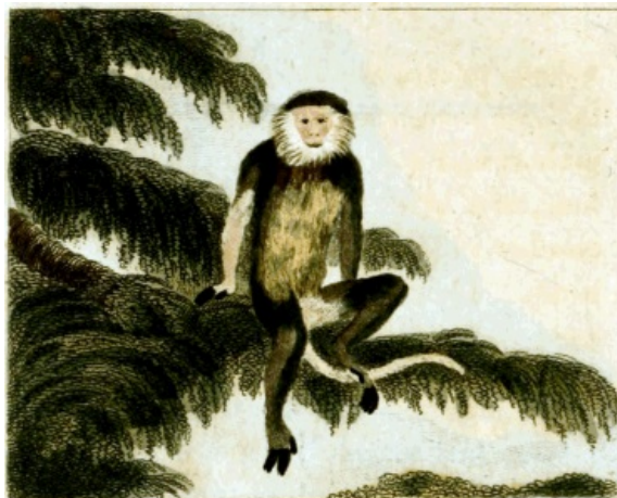
FIG. 212. Douc.