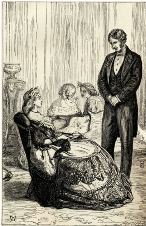
MR. PALLISER AND LADY DUMBELLO. (CHAPTER XXIII) Click to ENLARGE