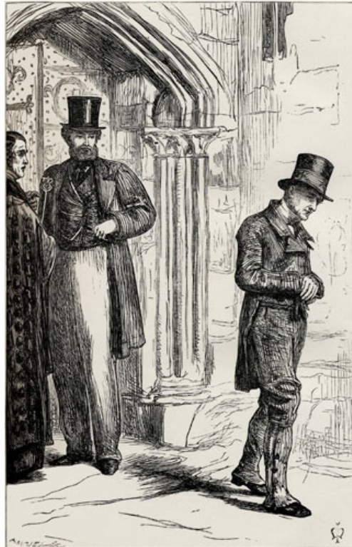
"HE IS OF THAT SORT THAT THEY MAKE THE ANGELS OF," SAID THE VERGER.

"He is of that sort that they make the angels of," said the verger. "But they can't make many if they want them all as good as he is. I'm much obliged to you, sir." And he pocketed the half-crown which Crosbie gave him.