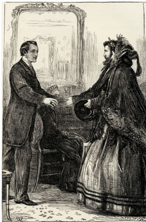
"MR. CRADELL, YOUR HAND," SAID LUPEX.

"Mr. Cradell, your hand," said Lupex, who had advanced as far as the second glass of brandy-and-water, but had not been allowed to go beyond it. "There has been a misunderstanding between us; let it be forgotten."