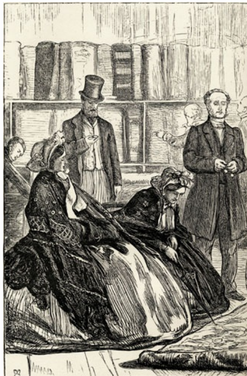
"THAT MIGHT DO." Click to ENLARGE

"That might do," said Alexandrina, gazing upon a magnificent crimson ground through which rivers of yellow meandered, carrying with them in their streams an infinity of blue flowers. And as she spoke she held her head gracefully on one side, and looked down upon the carpet doubtfully. Lady Amelia poked it with her parasol as though to test its durability, and whispered something about yellows showing the dirt. Crosbie took out his watch and groaned.