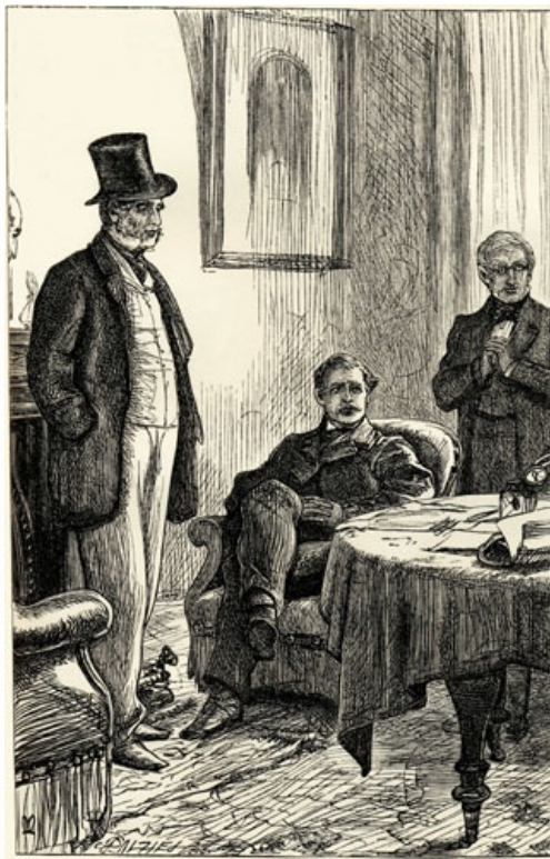
THE BOARD. Click to ENLARGE