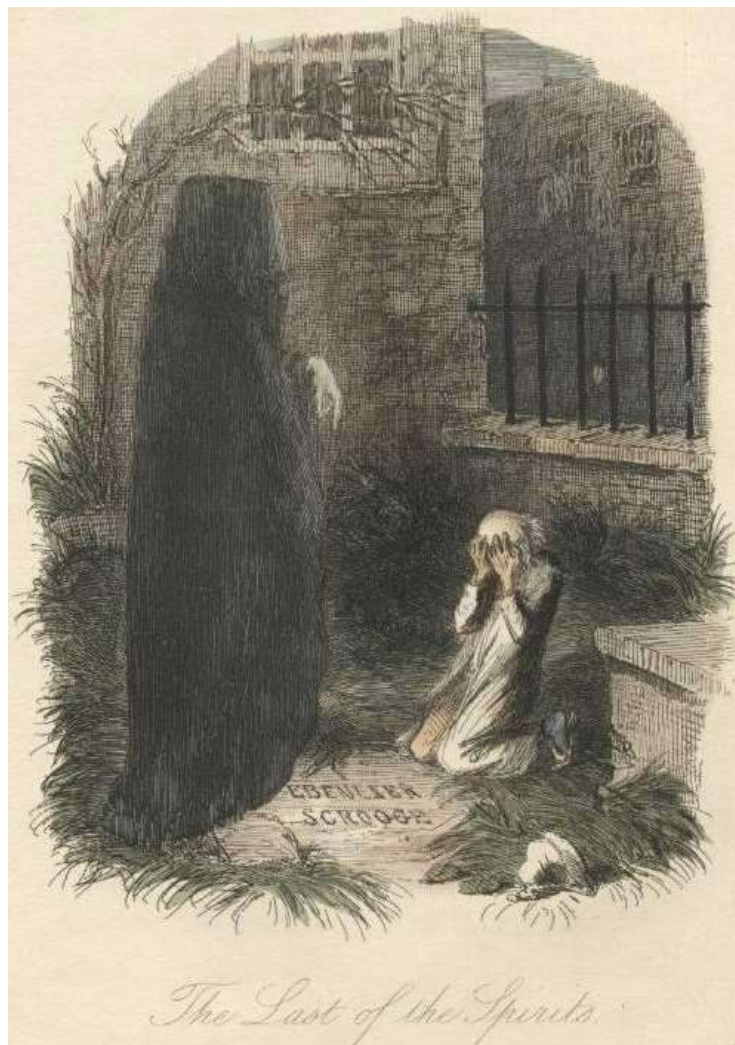
The Last of the Spirits

Scrooge crept towards it, trembling as he went; and following the finger, read upon the stone of the neglected grave his own name, EBENEZER SCROOGE.