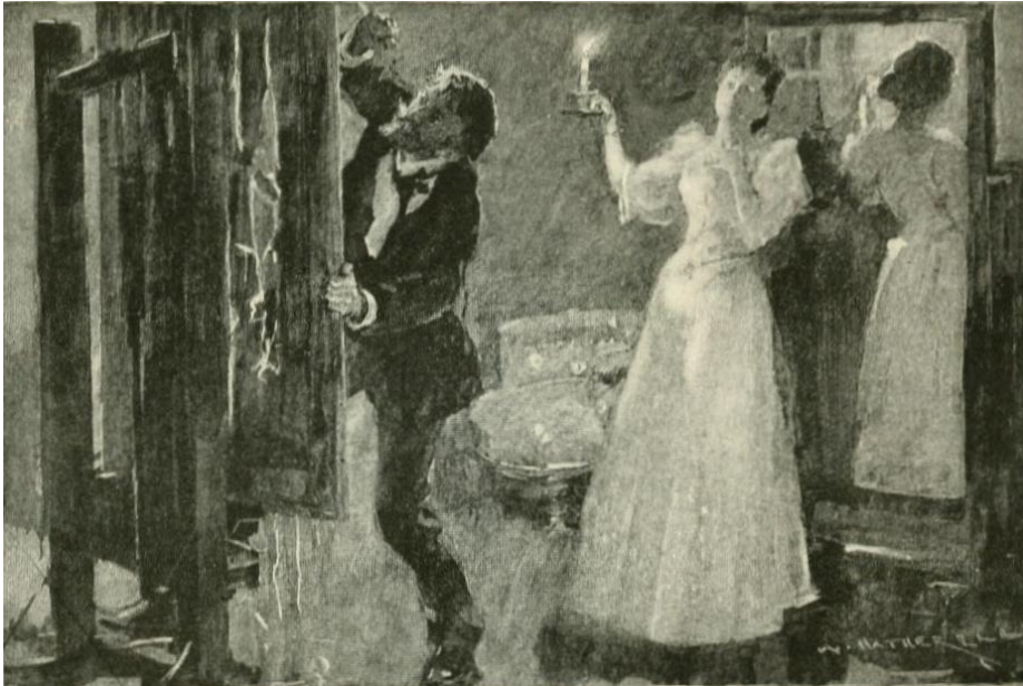
"HE CUT AND STABBED THE FIGURE IN FIFTY PLACES"