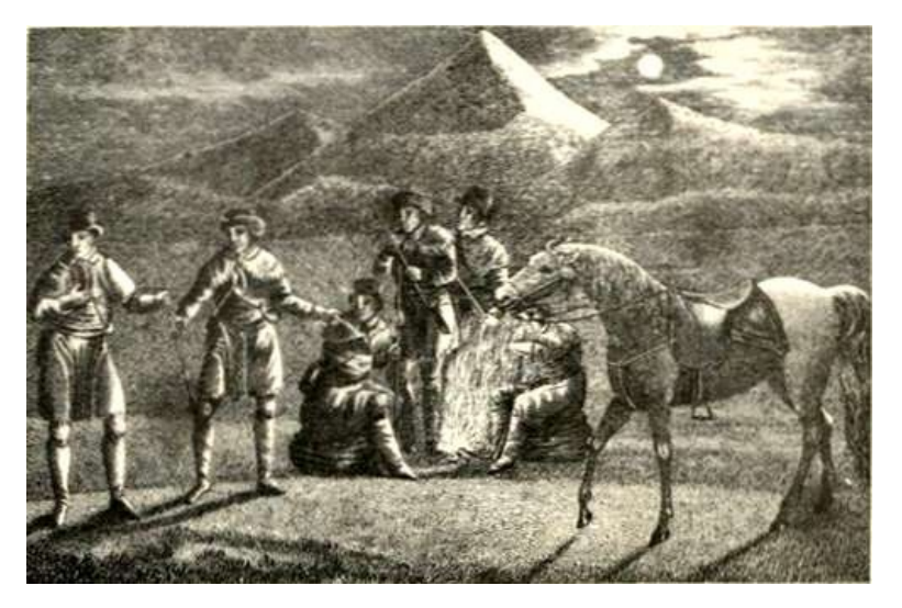
Shooting Mr. Pattie's Horse

[136] It was now the 15th of November, and while the horse flesh lasted, we built a canoe, so that we could trap on both sides of the river; for it is here too broad and deep to be fordable on horseback. One of our number had already been drowned, man and horse, in attempting to swim the river. A canoe is a great advantage, where the beavers are wild; as the trapper can thus set his traps along the shore without leaving his scent upon the ground about it.