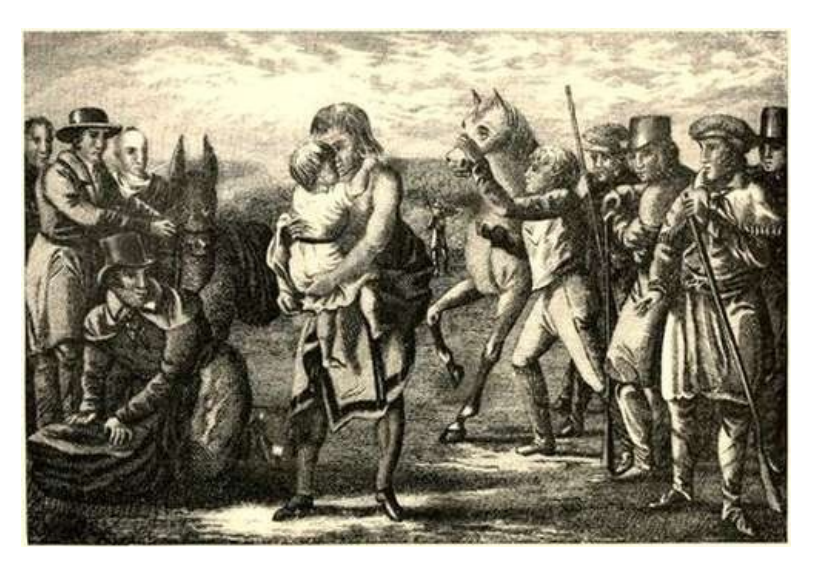
Rescue of an Indian Child

On the morning of the 4th, a party was sent out to kill some buffaloe bulls, and get their skins to make moccasins for our horses, which detained us until ten o'clock. We then packed up and travelled six miles. Finding a lake, we encamped for the night. From this spot, we saw one of the most beautiful landscapes, that ever spread out to the eye. As far as the plain was visible in all directions, innumerable herds of wild horses, buffaloes, antelopes, deer, elk, and wolves, fed in their wild and fierce freedom. Here the sun rose, and set, as unobscured from the sight, as on the wastes of ocean. Here we used the last of our salt, and as for bread, we had seen none, since we had left the Pawnee village. I hardly need observe, that these are no small deprivations.