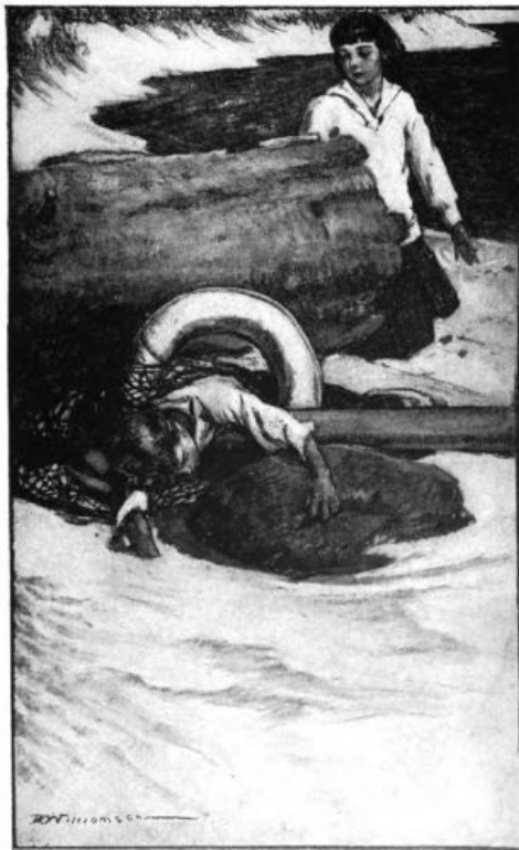
THE SPACE BEHIND THE LOG WAS ALREADY OCCUPIED

Mabel that she could detect a sound of breathing, rather heavy breathing, Mabel thought; a little like Mrs. Crane's, when that good lady snored.