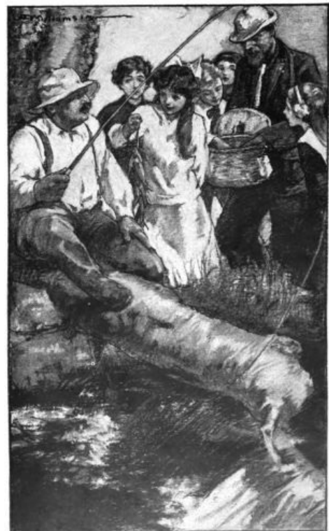
SEATED ON THE DRY END WAS A STOUT, PLACID MAN