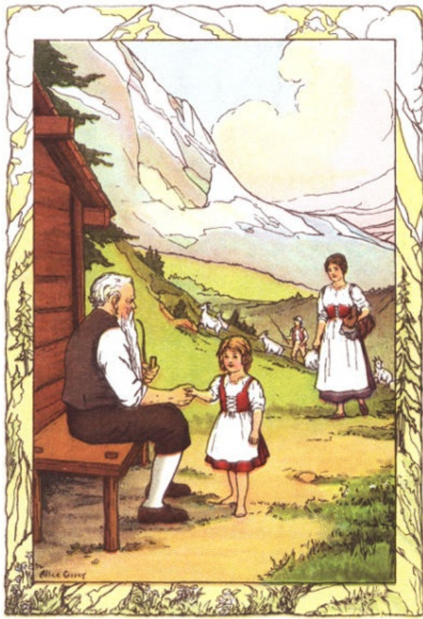
UP THE MOUNTAIN TO GRANDFATHER