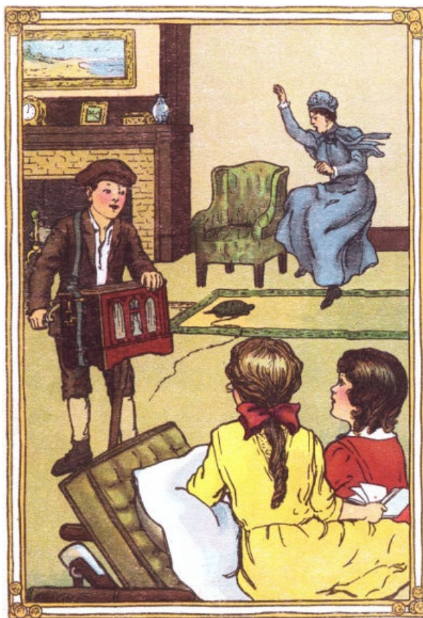
MISS ROTTERMAYER JUMPED HIGHER THAN SHE HAD FOR MANY LONG YEARS

Quietness reigned again in the study, and lessons began once more; Miss Rottermeyer now stayed in the study in order to prevent any further dreadful goings-on.