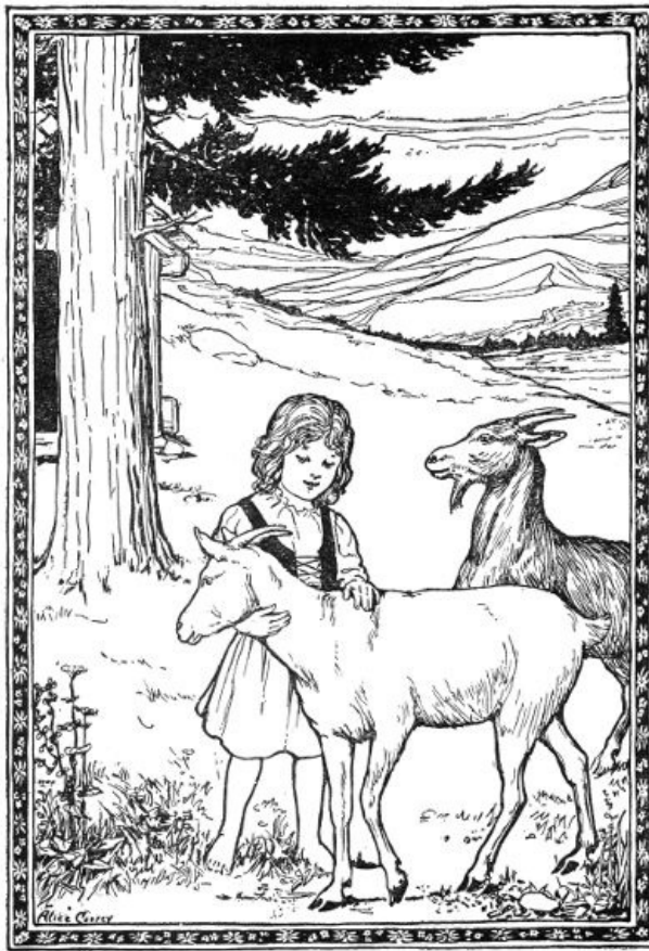
HEIDI TENDERLY STROKED THE TWO GOATS IN TURN

Suddenly a shrill whistle was heard. Down from the heights above, the goats came springing one after another, with Peter in their midst. Heidi sprang forward with a cry of joy and rushed among the flock, greeting first one and then another of her old friends of the morning. As they neared the hut the goats stood still, and then two of their number, two beautiful, slender animals, one white and one brown, ran forward to where the grandfather was standing and began licking his hands, for he was holding a little salt which he always had ready for his goats on their return home. Peter went on down the mountain with the remainder of his flock. Heidi tenderly stroked the two goats in turn, jumping about in her glee at the pretty little animals. "Are they ours, Grandfather? Are they both ours? Are you going to put them in the shed? Will they always stay with us?"