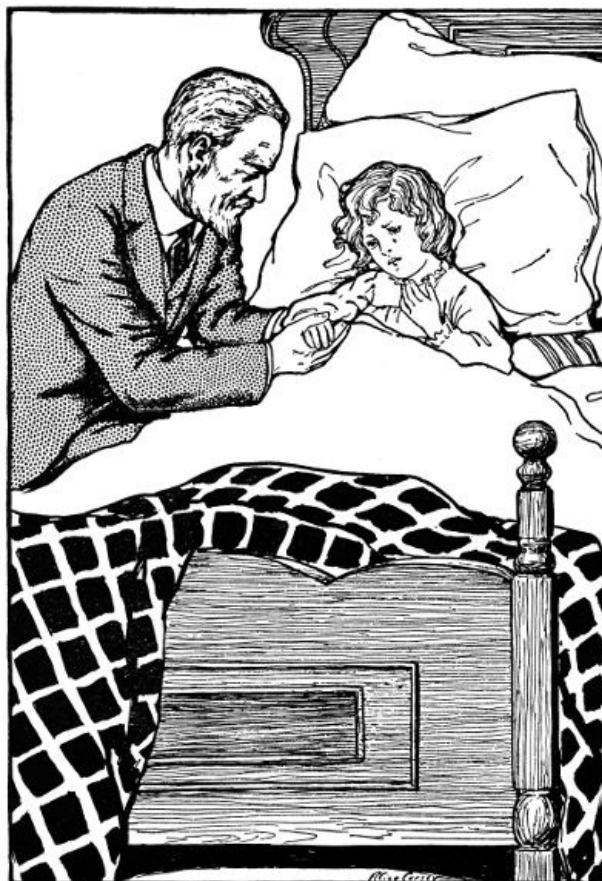
THE DOCTOR DISCOVERS HEIDI'S HOME-SICKNESS

"I see, and had you been dreaming, so that you seemed to see and hear something very distinctly?"