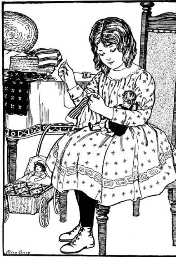
HEIDI LEARNS TO MAKE DOLL CLOTHES

"Do not tell me that, Heidi! Why have you left off praying?"