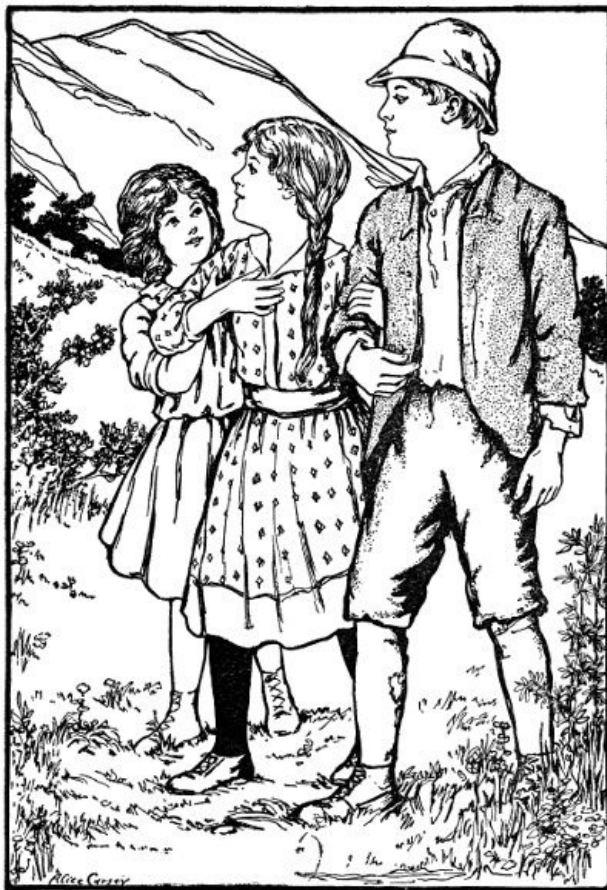
THE LITTLE INVALID FINDS THAT SHE IS ABLE TO WALK