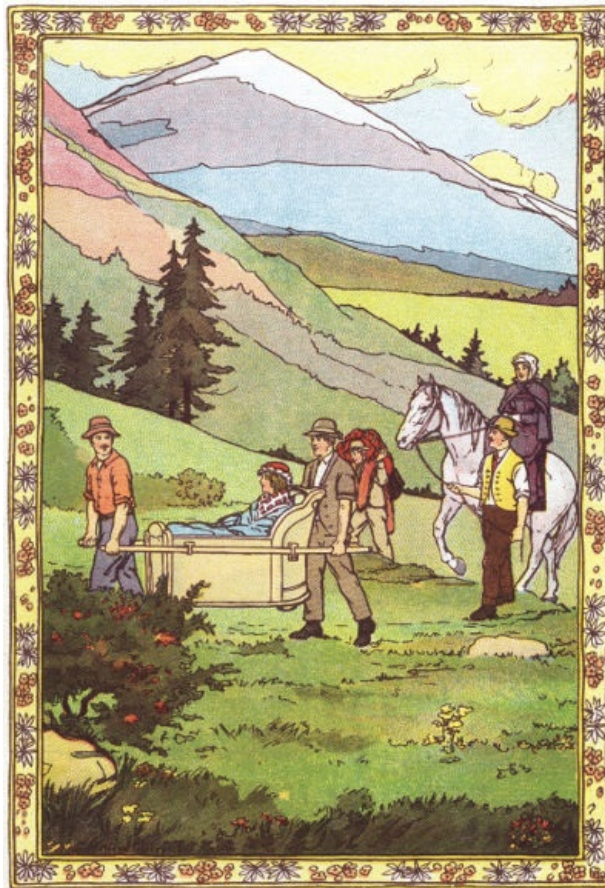
A STRANGE-LOOKING PROCESSION WAS MAKING ITS WAY UP THE MOUNTAIN

When Peter arrived with the goats, Uncle drew him aside and said, "From today be sure you let Little Swan go where she likes. She knows where to find the best food for herself, and so if she wants to climb higher, you follow her, and it will do the others no harm if they go too. A little more climbing won't hurt you, and in this matter she probably knows better than you what is good for her; I want her to give as fine milk as possible. So now be off and remember what I say, and don't look so cross about it."