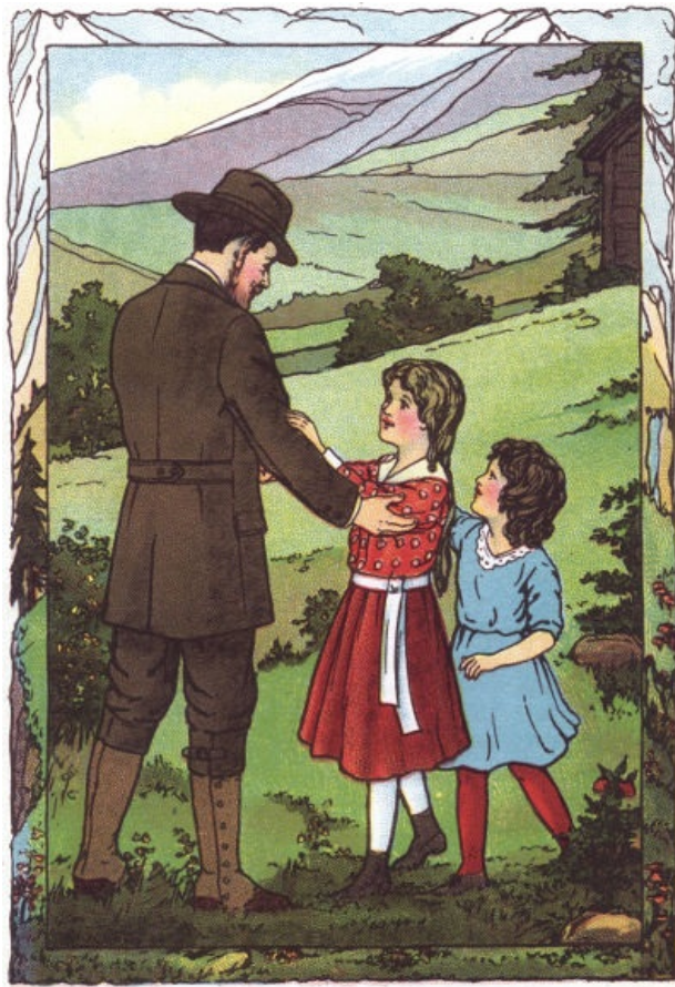
"ARE YOU REALLY MY LITTLE CLARA?"

"God grant indeed it may be so!" added grandmamma, shaking Uncle's hand warmly as she spoke, to show how sincerely she echoed her son's wish. Then putting her arm round Heidi, who was standing near, she drew the child to her. [233]