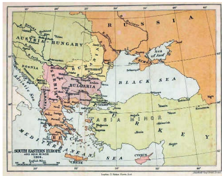
London: T. Fisher Unwin, Ltd. Stanford's Geog. l Estab. t London.

It only remains to add that when, soon after the commencement of the war, the Porte, at the instance of Enver Pasha, declared itself against the Allied Powers, the British Government at once proclaimed the independence of Egypt, under its protectorate, and the annexation of Cyprus. These were the last territorial losses of the Ottoman Empire which can be counted as faits accomplis . It has been shown that, in the past, there were due to the régime of the Young Turks, during the six years of its predominance, from 1908 to 1914, the loss in Europe of Macedonia, Epirus, and Albania, and of a large part of Thrace; of Crete, Cyprus, and many other islands in the Ægean Sea; and the suzerainty of Bulgaria, Bosnia, and Herzegovina; and in Africa of the province of Tripoli and the suzerainty of Egypt. These great losses rivalled in extent of territory and population those incurred either by Mahmoud II or by Abdul Hamid II. It needs no prophet to predict a further shrinkage of territory, or loss of independence, after the conclusion of the existing war in Europe, whatever may be its other results.