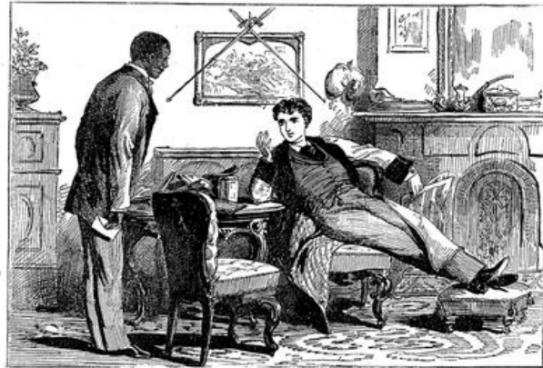
"FEARS to me, MARIE JACK, you done gone been quiet long 'nuff dis spell," exclaimed Monday, JACK HARKAWAY'S COLORED SERVANT, AS HE ENTERED HIS MASTER'S ROOMS.

sah, I've been afraid I'd gwine ter run out, 'nuff dis wear out!" "What have you got in your hand?" "E! What 'nuff I got. A letter. I mis-remember dat I come in for some-thing." "Give it 'em." Monday handed his master a letter and re-tired, without venturing on any further remark. The epistle was directed in a delicate lady's hand and was highly perfumed. "From Lena Van Hoozen. Wants to see me at once. Someth-ing important to communicate. I 'd go in half an hour. Lucky it was not this evening, as I have a special meeting of the Travelers' Club to attend." Miss Lena Van Hoozen belonged to one of the best families of New York city and at sixteen years of age was the prettiest and most accom-plished girl in London, which is saying a great deal.