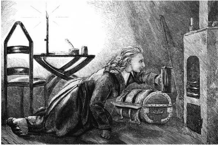
SCHILLER IN HIS ATTIC.