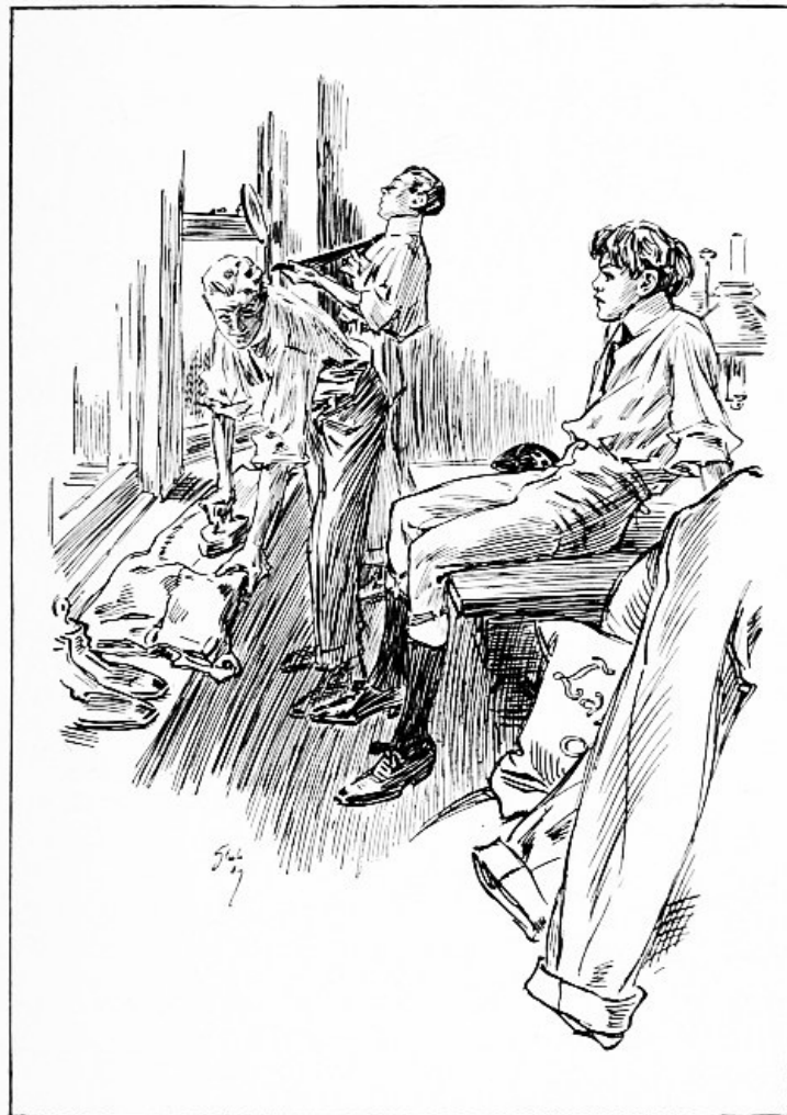
"Trousers that were limp and discouraged, grew smooth"