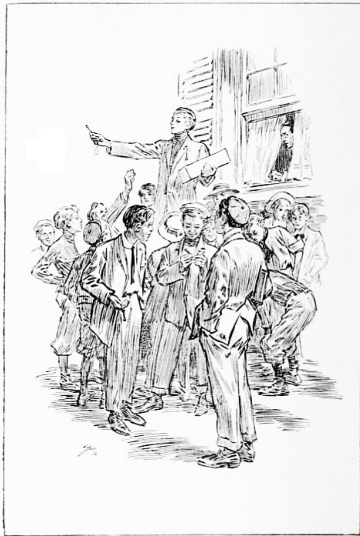
"Nothing but a "suvener," gents, nothing guaranteed" (Page 123)