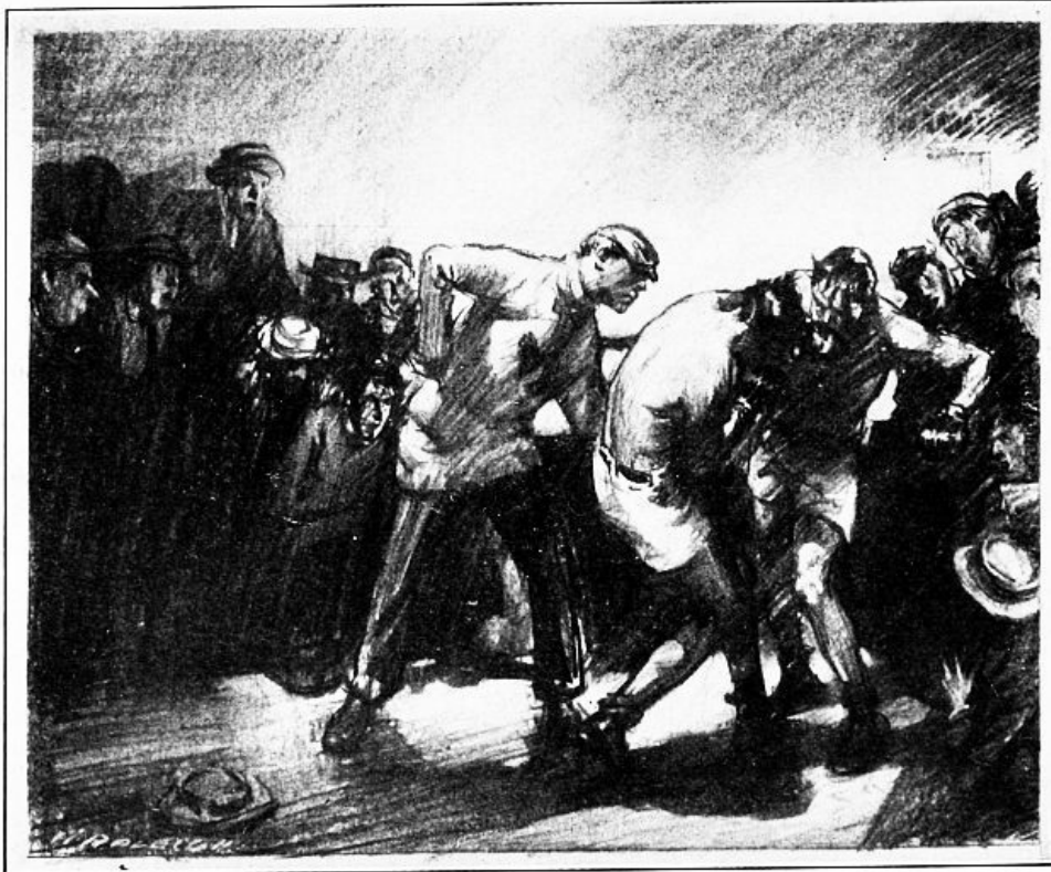
"Then he lost track of the rounds"

Once in his corner he thought he heard some one say: "Fifteenth round"—fifteen, and he could remember only six. In fact, he had forgotten whom he was fighting or what it was about, only that some one on whose knee he was resting was shrieking in his ear: