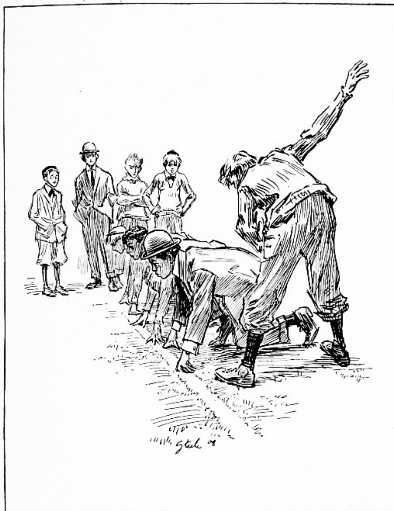
"A stinging hand descended upon the crouching Piggy"