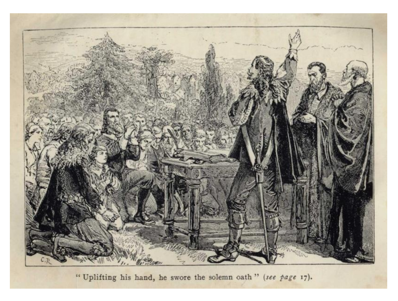
"Uplifting his hand, he swore the solemn oath"

When the reading of the Covenant was concluded, the Earl of London addressed the multitude in eloquent, heart-stirring tones, exhorting them to consider well the solemn and binding nature of the oath about to be taken, and impressing upon them the necessity of standing steadfast by their testimony, for not otherwise could that liberty, civil and religious, so dear to every Scottish heart, be restored and maintained in the land. One of the leading and most devoted ministers in the Church then gave utterance to a prayer, which hushed the very breathing of the assembly, and moved them as if by a mighty wind from Heaven. Amid the solemn silence which ensued, the Earl of Sutherland stepped forward, and uplifting his hand he swore the solemn oath, and then affixed the first signature to the Covenant. He was followed by nobles, ministers, citizens, men, women, and children, who subscribed name after name on the great sheet, until it could hold no more. Some, more enthusiastic than their fellows, opened veins in their arms, and wrote their names in their blood.