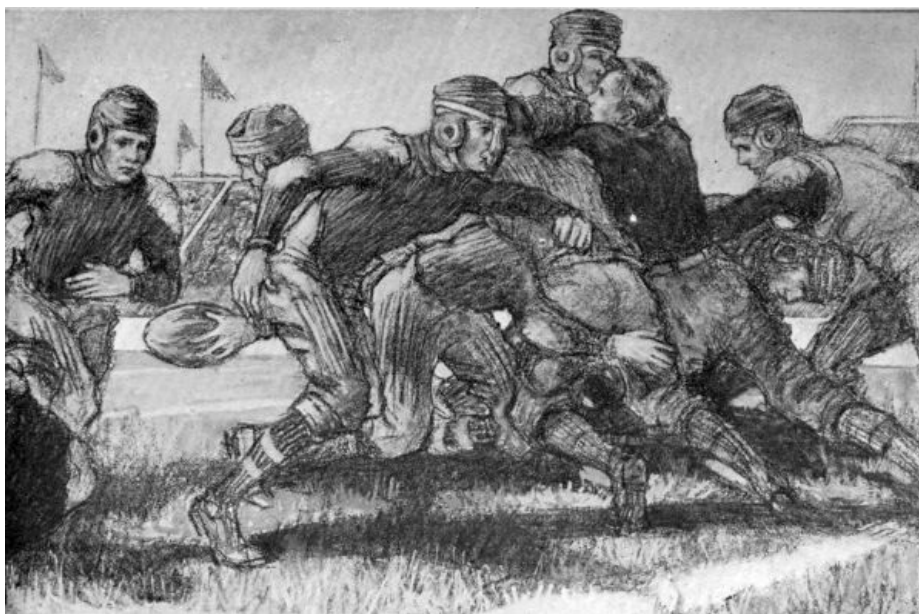
It was Alton's day all through