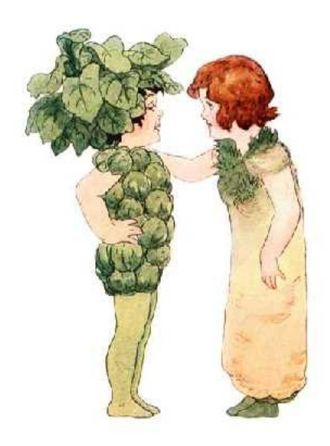
SAID Brussels Sprout: "I am so glad That I'm such a good-looking lad." Horseradish said: "I'm glad I'm plain If good looks make a chap so vain."