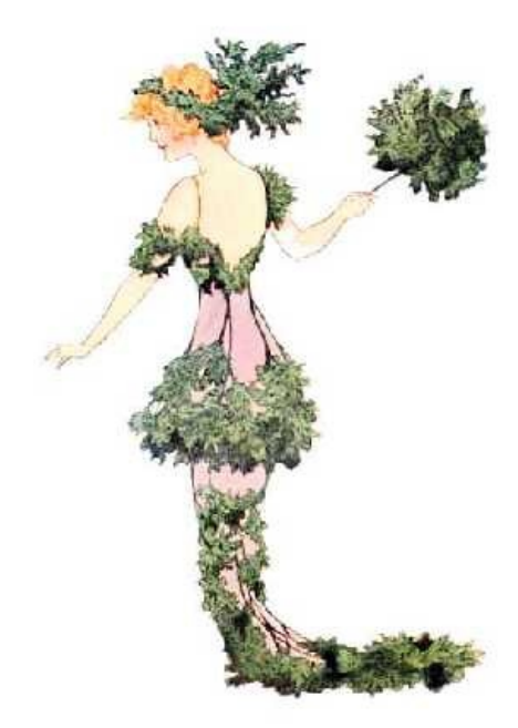
MISS Parsley raised her plumy head, And in her modest manner said: "I'm only asked to dine, I know, Because my dress becomes me so!"