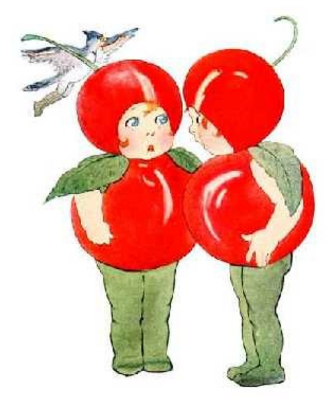
"HERRIES are ripe," said Old Blue Jay As he flew by one August day; "Why, he means us," the Cherries cried, "Perhaps we'd better go inside."