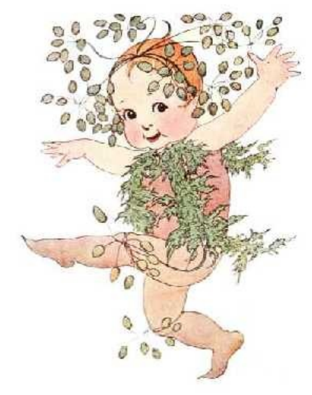
\hbox{\it ''} I' \hbox{LL be grown up," said Caraway,} \\ \hbox{\it "And out of school Thanksgiving Day;} That's a good thing, too, 'cause you