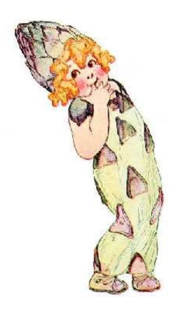
ASPARAGUS in early spring Came up to hear the robins sing; When she peeped out her dress was white; It turned green in the sunshine bright.