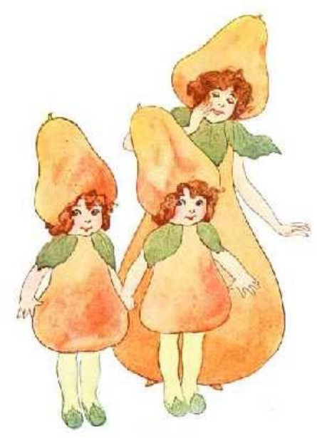
SAID Mother Pear: "Dear me! Those twins Are just as much alike as pins; I must do something, I declare!" So she cut little sister's hair.