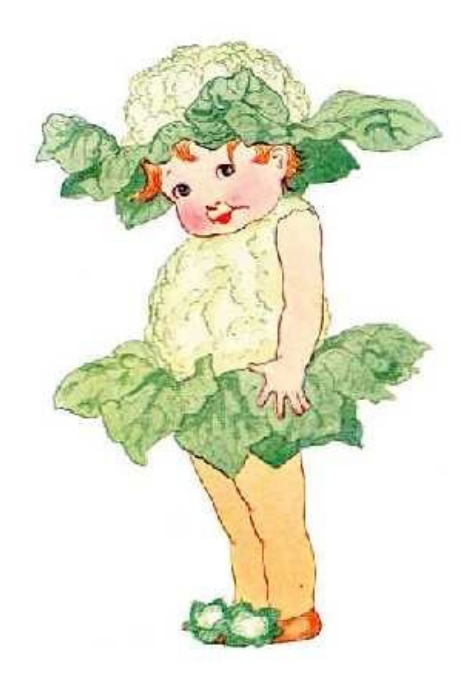
SAID Cauliflower: "I used to be A cabbage, so some folks tell me; When I've improved some more—who knows? Maybe I'll be a Cabbage Rose."