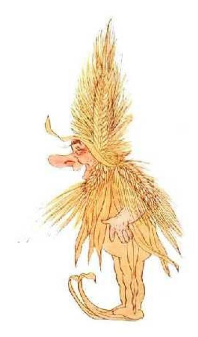
B^{\text{ARLEY'S a bearded gentleman,}}_{\text{He wears a suit of golden tan;}}_{\text{Though he has homes both east and west}} He loves the prairie lands the best.