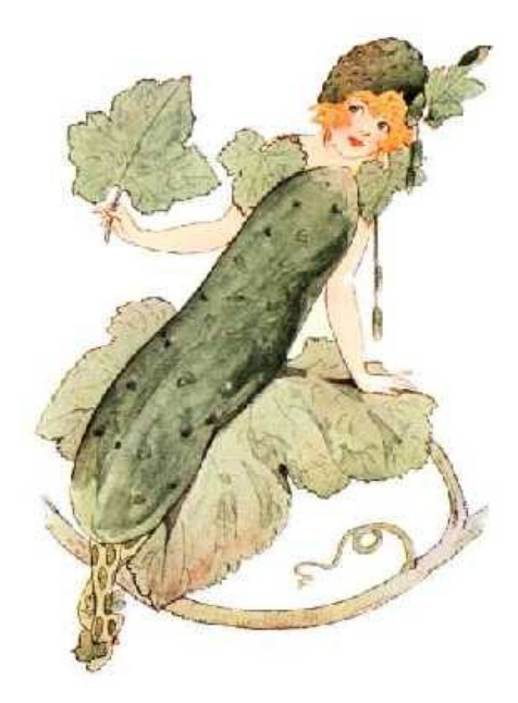
SAID Miss Cucumber: "I have brought My fan, because the day is hot; Our family have a splendid rule,— Whatever happens, we keep cool."