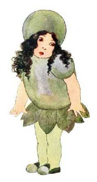
LIVE'S a sweet Italian maid, Her gown is green—a lovely shade. Though just at first she's rather You get to like her by and by.