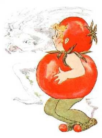
NORTH Wind came whistling by one day Where the Tomatoes were at play; It gave those children such a fright They put their blankets on that night.