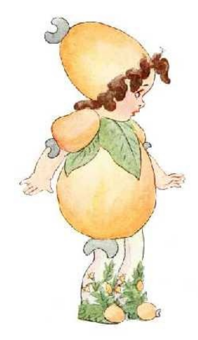
HERE'S an odd child named Cashew—Provides you nuts and apples, too; Oil and wine, and other things This busy young Brazilian brings.