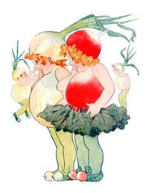
LITTLE Miss Radish, pretty thing, Has her birthday in the spring; She and the little Onions play Out in the garden all the day.