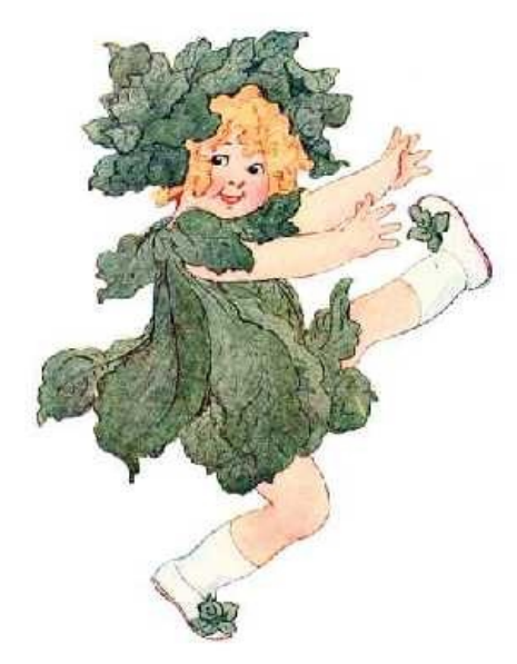
SAID Spinach: "In my dress of green I'm just as happy as a queen. I'm truly glad that I am good For little babies' early food."