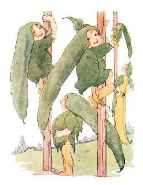
THE String Beans love to climb a pole, And so their clothes are seldom whole. Mother Bean said: "I'll mend the tatters; While they are happy, nothing matters!"