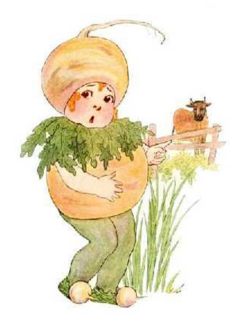
SAID Rutabaga Turnip: "Wow! I just escaped that hungry cow; I jumped behind a great big tree Or she'd have surely eaten me!"