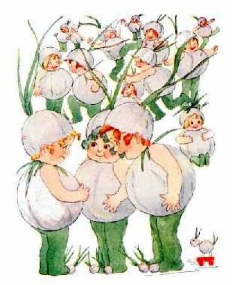
PEARL Onion, tiny little thing, Lives out doors from early spring; She's German, so I understand, And dearly loves her father-land.