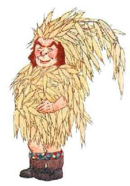
"TDINNA care," said bluff Scotch Oat, "For dinner at a table d'hote; A bowl of porridge and some tea, At home, are good enough for me."