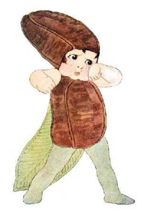
"THE boys all call me 'Nigger Toe,'" Brazil Nut said; "I think I'll go Back to Brazil; 't would serve them And teach them to be more polite."