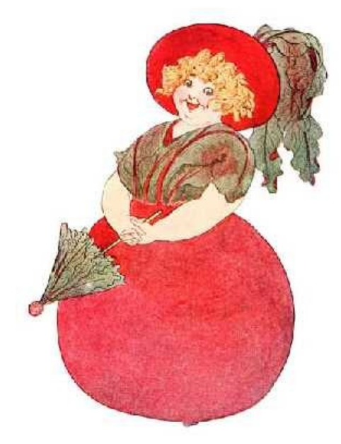
"EVERY one knows," said Madame Beet "My disposition's very sweet; And though to plumpness I am prone, My color's every bit my own."