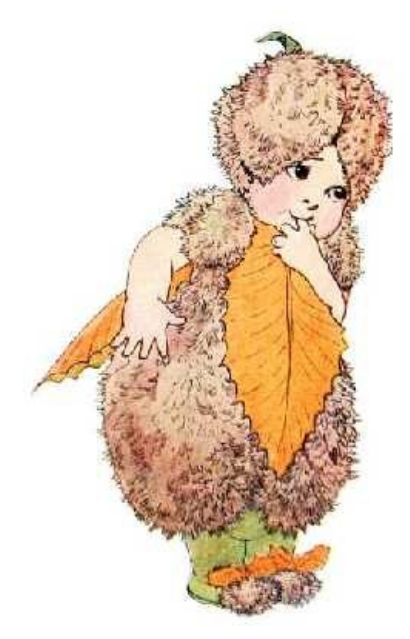
MISS Beechnut wears a pretty bonnet With little fuzzy feathers on it. She's very sweet, and always good; Her home is in the deep, wild wood