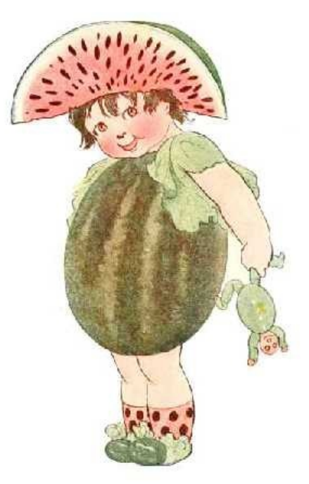
WATERMELON'S dress of green Trimmed in rose pink you all have She has such pleasant smiling ways, We welcome her on summer days.