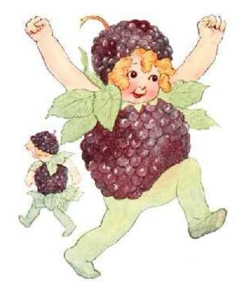
THE Blackberry children love to run And play beneath the August sun Until each little maid and man Takes on a friendly coat of tan.