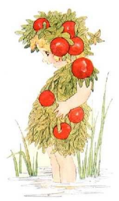
RANBERRY dearly loves to go Wading in places wet and low; She wears soft gowns of dainty floss Made of the pretty yellow moss.