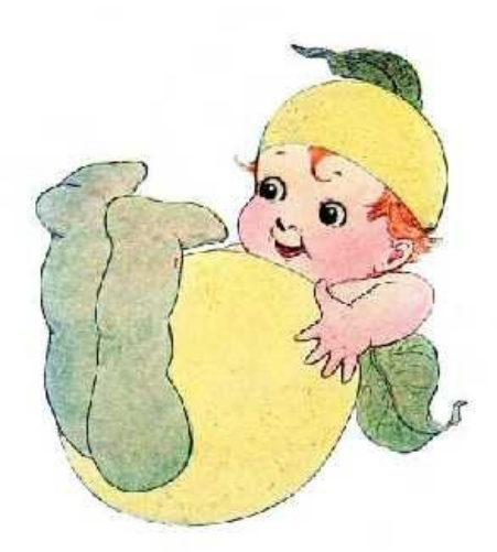
CITRON is very plump and round, He likes to roll upon the ground; Come rain or shine he's always happy, A nice, contented little chappie.