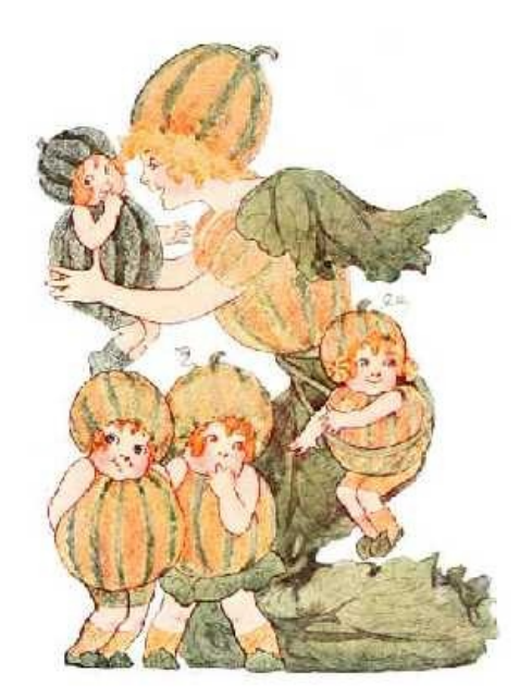
EAR me!" Madam Muskmelon said, "Those children will not stay in Before the darlings get misplaced I'll tie each baby to my waist."