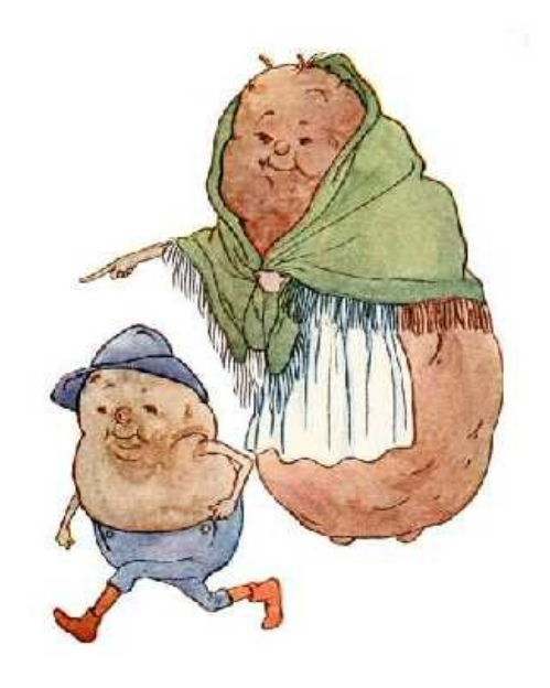
SAID Dame Potato: "Hurry, Pat! And wash your face and feed the cat, Then run to school, or you'll be late; Just see! It's nearly half past eight!"