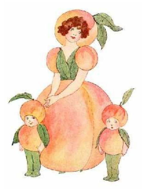
"Our family's not hard to suit," Said Mrs. Peach. "We're simple fruit; We like most any kind of weather If the sun shines, and we're together."