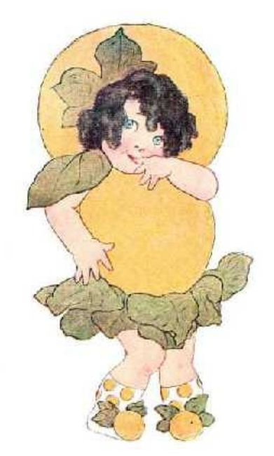
T^{\text{HOUGH Miss Grape Fruit is very young}}_{\text{Her praises are on every tongue;}} And though she travels everywhere She has a very modest air.