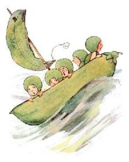
HE Green Pea children went to sail On the Sauce Pan ocean in a gale; "This boat's a shell," they cried; "Dear me! We might capsize in this deep sea."