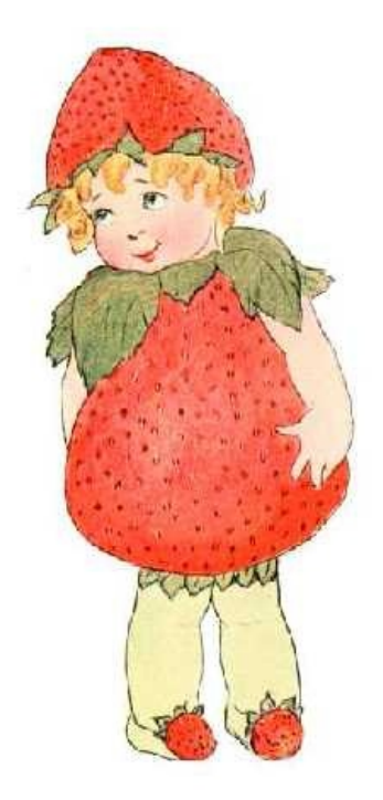
\mathbf{L}^{ ext{ITTLE}} Wild Strawberry came down To visit with her folks in town; She's a sweet child with charming ways And blushes modestly at praise.