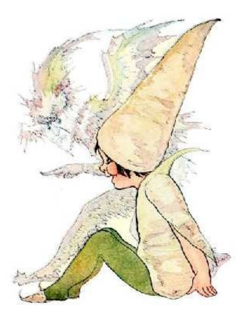
{ m W}^{ m HEN} Jack Frost said: "Now, children all, Go in before the snowflakes fall," Parsnip declared he liked the snow To cover him, and didn't go.