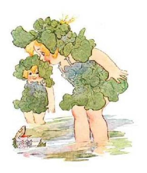
THE dainty little Water Cresses, In their pretty bathing dresses, Like water fairies splash and play In the cool brooklet all the day.