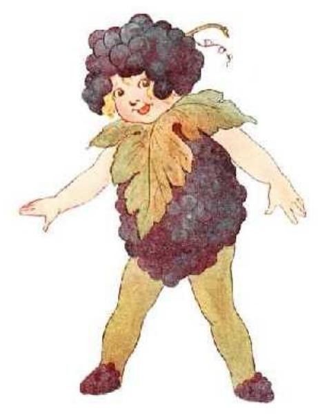
WILD Grape just loves to run away And in the green woods climb and play; You'll know him when among the trees His fragrant blossoms scent the breeze.