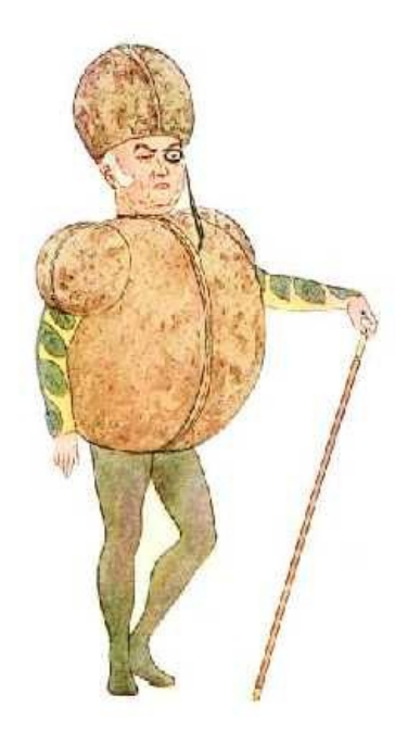
SIR English Walnut, pompous, fat, Is quite a great aristocrat. His family is very old; They lived in Bible times, we're told.