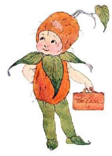
Y AM really is a pretty fellow, Though his complexion's rather yellow; When Winter comes he packs his grip And goes north for a little trip.