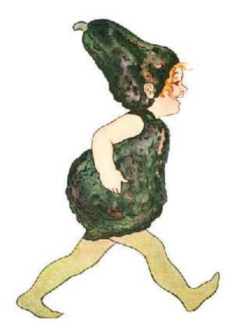
SAID Hubbard Squash: "All summer long I'm on the farm where I belong, But in the fall, for change of air, I go to see the County Fair."