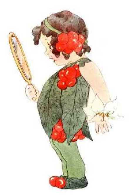
OFFEE said: "I must really study To find why my complexion's muddy. Perhaps it's only tan, you know I do run out bareheaded so!"