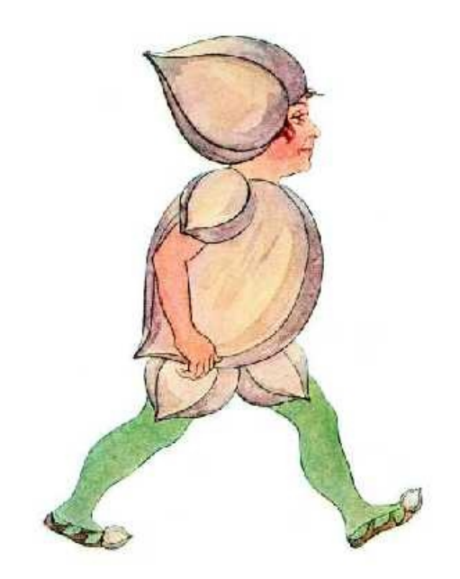
HICKORY Nut looks rough and rude, Although at heart he's very good. If once you get inside his shell You're sure to like him very well.