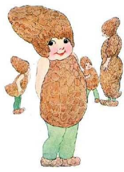
SAID Mrs. Peanut, in a flutter, "I quite forgot to salt the butter;" The little Peanut children said: "Why then, Mama, we'll salt the bread."