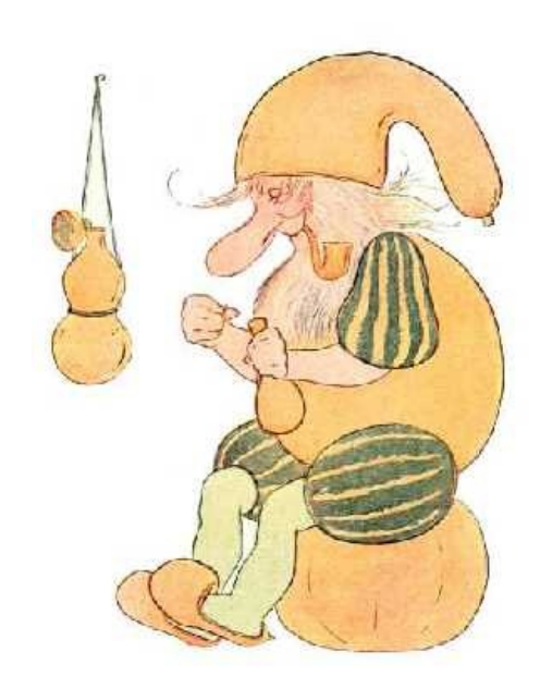
SAID Mr. Gourd: "You'll plainly see We are a busy family; We give you bottles, cups and things, And curly vines for playtime rings."