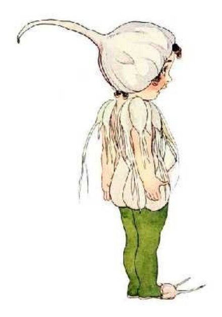
SAID Garlic: "My home used to be In far-off, sunny Sicily; But people here think I'm a blessing, I make such splendid salad dressing."