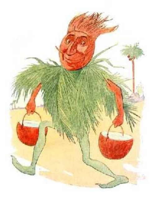
COCOANUT has a funny face, Eyes, nose and mouth all in one place; He's always busy selling milk, While Mrs. Cocoanut makes silk.