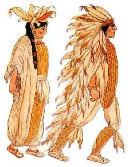
SAID Indian Corn: "I'm heap rich brave, Much shiny gold I make and save." So Squaw Corn went and bought a bonnet, And a silk gown with tassels on it.