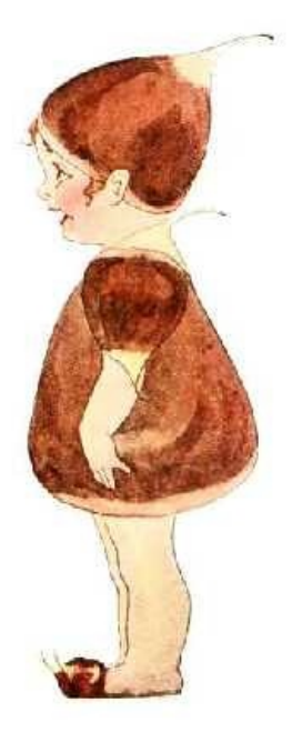
S^{\rm AID\ Chestnut:\ "I\ work\ for\ my\ living}_{\ I\ stuff\ the\ turkey\ on\ Thanksgiving.} On winter days I work down town; You'll know me by my coat of brown."