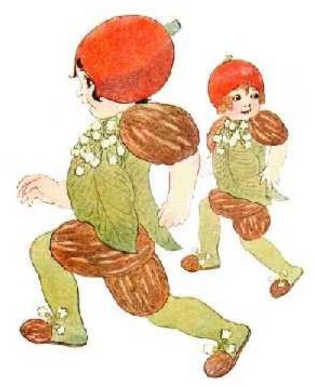
THE Nutmeg children ran away To tease the cook on baking day. Said Mother Nutmeg, in surprise: "Why! Who will spice the custard pies?