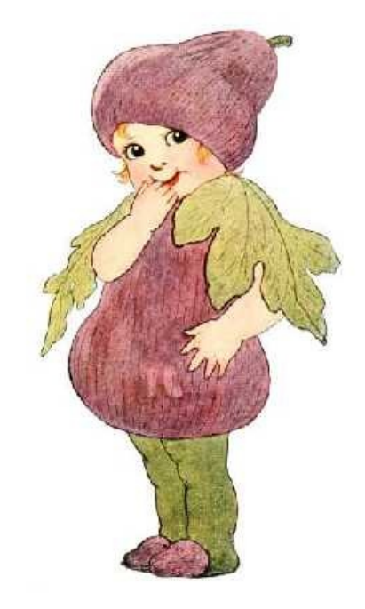
F <sup>IG</sup> is the queerest chap; you know The way that fellow starts to grow? Just a small bud upon the bough, No flower at all—that's clever now!