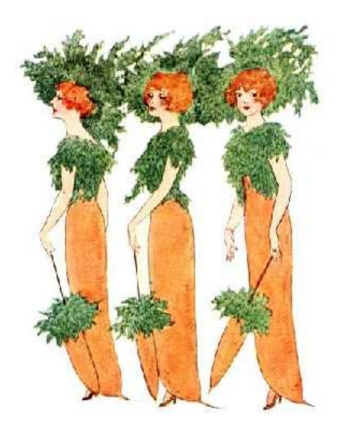
T^{\text{HE Carrot ladies love to go}}_{\text{To church on Sundays in a row;}} And, tall or short, each lady fair Wears a green feather in her hair,