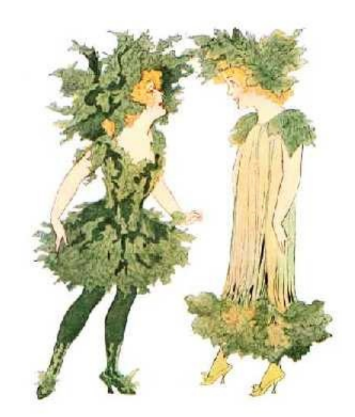
SAID Endive: "I was born in France But travel when I get a chance." Said Celery: "I travel, too, But my real home's in Kalamazoo."