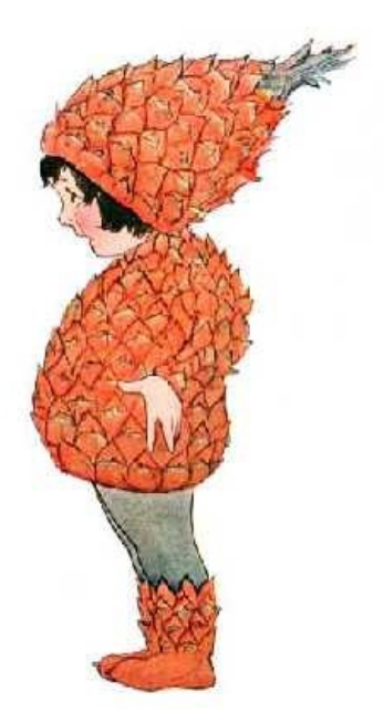
PINEAPPLE has so many "eyes" You cannot take him by surprise; He's full of sunshine, through and through, And always has a treat for you.