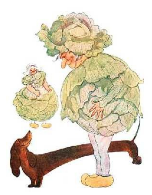
HERR Burgomaster Cabbage said: "My little dog, he needs some bread." Frau Cabbage smiled; "Just help yourself, A fresh loaf's on the pantry shelf."