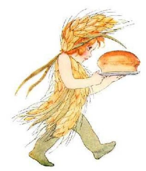
\hbox{$^{\prime\prime}$} I^{\hbox{WORK,"}} \ \hbox{said genial Mrs. Wheat,} \\ \hbox{$^{\prime\prime}$} To \ \hbox{give the world enough to eat;} I'm always happy when there's bread Enough, so every child is fed."