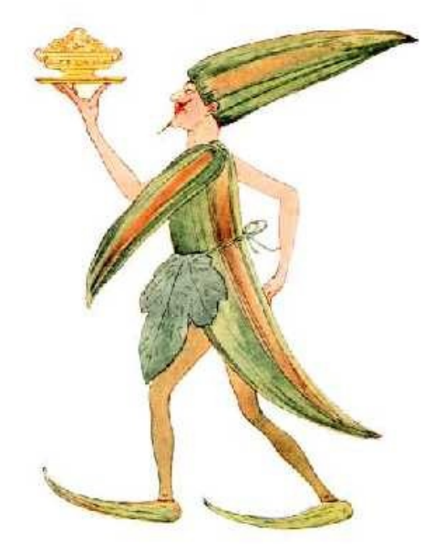
GUMBO'S a splendid southern cook, And, without looking in the book, He'll make a savory soup or stew, And send it, steaming hot, to you.