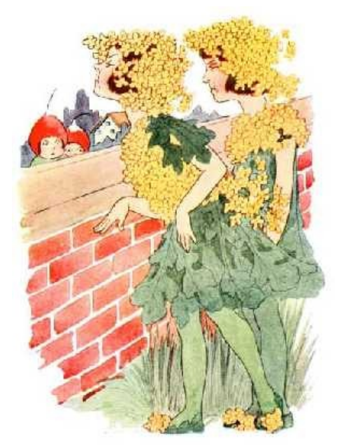
T^{\text{HE Mustard Children grew so tall}}_{\text{They looked right over the garden-wall;}} They're rather sharp and forward, so That's why they're left outside, you know.