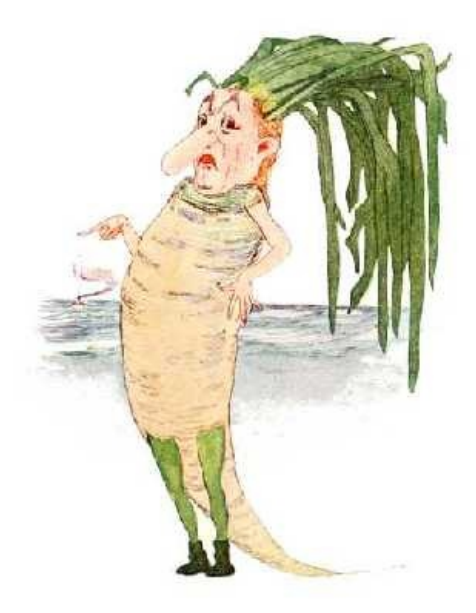
\Gamma HE person they named after me," Said Oyster Plant, "lives in the sea; I'm very sure I could not sleep 'Rocked in the cradle of the deep.'"