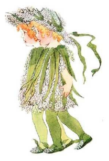
T^{\text{HE pretty little ladies Rice}}_{\text{You'll always turn to look at twice;}} They came from India long ago, And now they're everywhere you go.