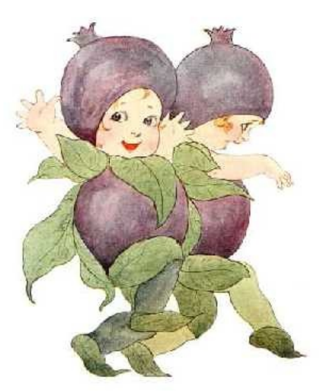
\Gamma^{ ext{HE Blueberry children love to run}}_{ ext{Around the hillsides in the sun;}} Smiling and jolly, plump and sweet, Best-natured youngsters one could meet.