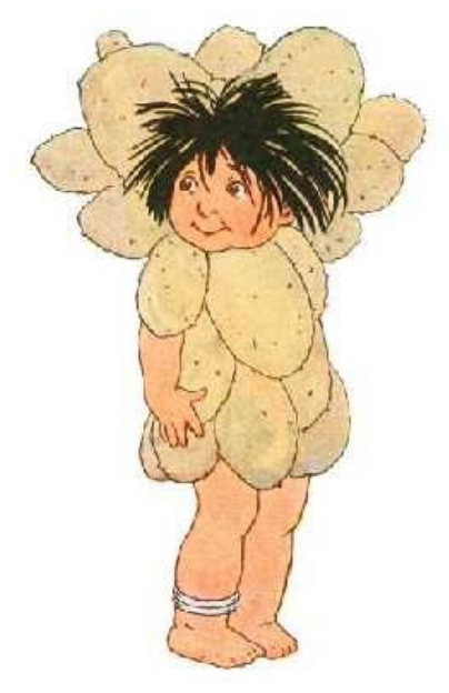
SAID Cactus: "On the desert wild I used to be a naughty child, But since I went to Burbank's school, I'm good, and live by Golden Rule."