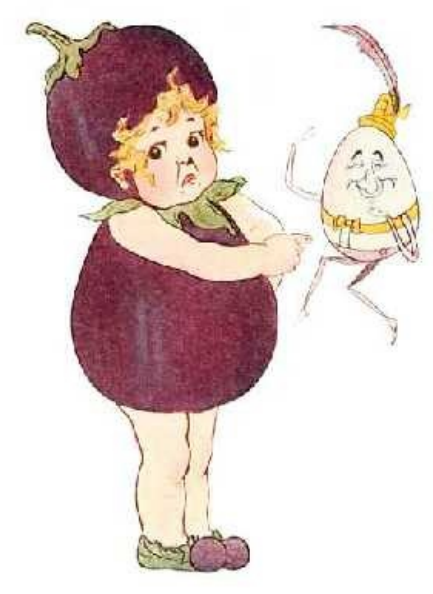
SAID pompous, purple Egg-plant: "Well! So that is egg in that queer shell; Really! It's very hard to see Why they named that chap after me!"