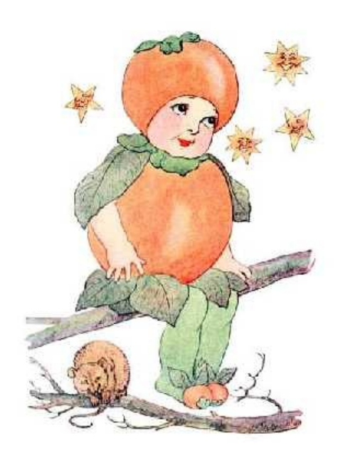
\mathbf{P}^{ ext{ERSIMMON}} said: "I'm up so high I can reach out and touch the sky." Bre'r Possum said: "Don't reach too far, You might put out a shining star."