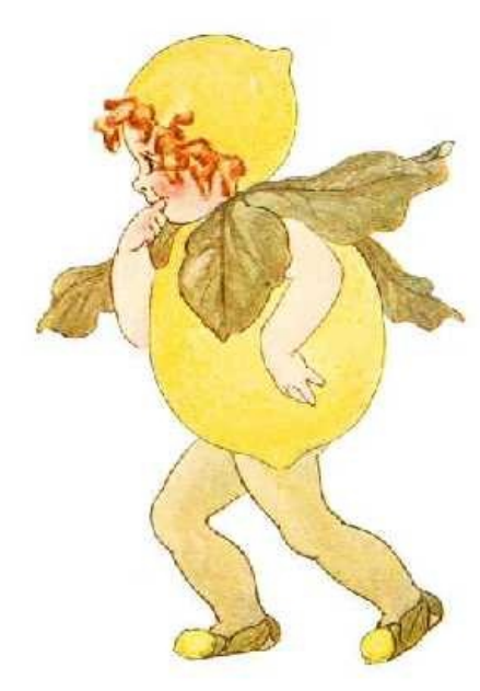
THE Lemons every summer go In groups to see the Wild West Show; Come rain or shine, they never stay At home on any circus day.