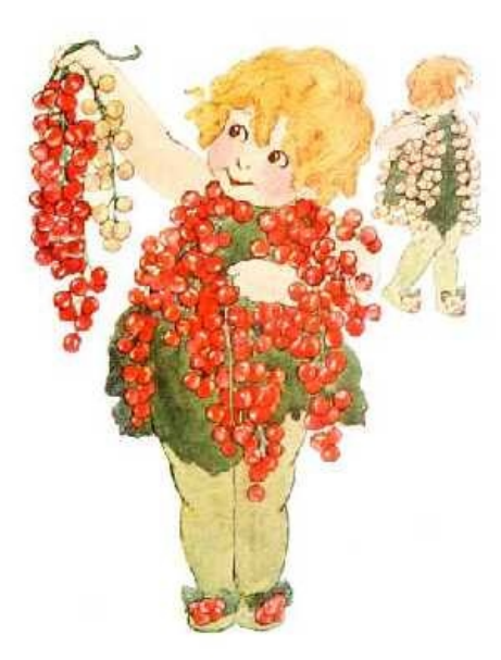
THE Currant ladies look so sweet In their green dresses, cool and neat. They offer you, for your delight, Their strings of berries, red and white.