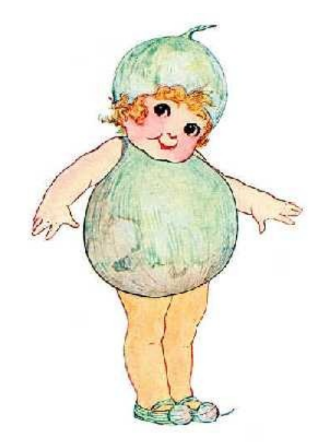
SAID Spanish Onion: "I don't see Why people weep at sight of me; I'm a nice, friendly sort of chappie And like to make everybody happy."