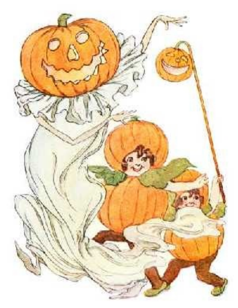
T^{\text{HE Pumpkin children, everyone,}}_{\text{On Hallowe'en go out for fun;}} With Jack o'lantern and his crew They find such jolly things to do.