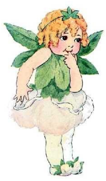
\mathbf{M}^{ ext{ISS}} Cotton is a fairy queen In her white dress all trimmed with green; To other children everywhere She sends such pretty clothes to wear.