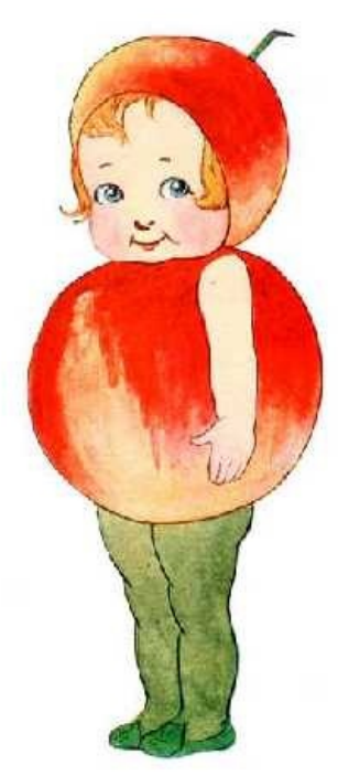
\mathbf{H}^{ ext{ERE'S}} Apple, loved by young and old And sometimes worth his weight in We hail him with delighted cries When he comes to us, baked in pies.