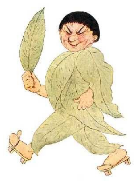
MR. Green Tea comes from Japan, He's such a wrinkled little man; He says: "My tea is very nice, Will you have sugar, milk or ice?"