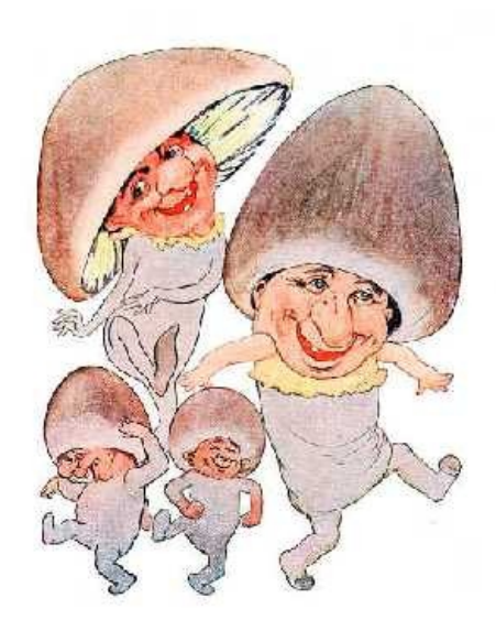
THE Button Mushrooms went to play With the small Puff Balls one bright day; They had such heaps of glorious fun, But all ran home at set of sun.