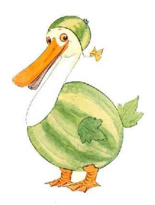
WHEN Gooseberry wears a gown of green She cries and pouts and makes a scene; But when her gown's a purplish hue She never disagrees with you.