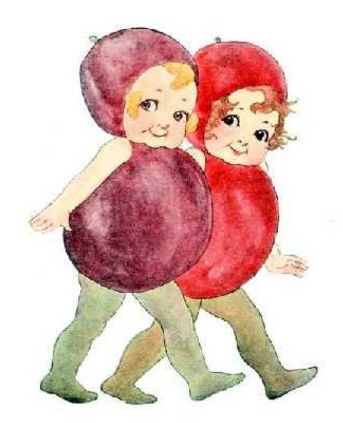
HAND in hand with summer comes The happy family called the Plums, Some dressed in purple, some in They're very pretty and well bred.