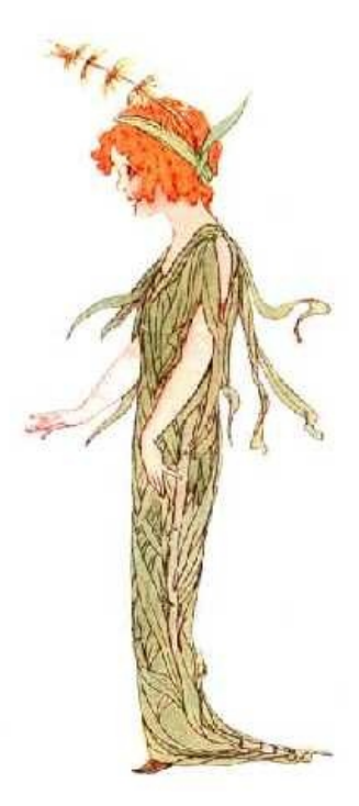
LITTLE Miss Sugar Cane is sweet— In truth, she's good enough to eat. She gives us sugar, nice and white, And syrup to make things taste right.