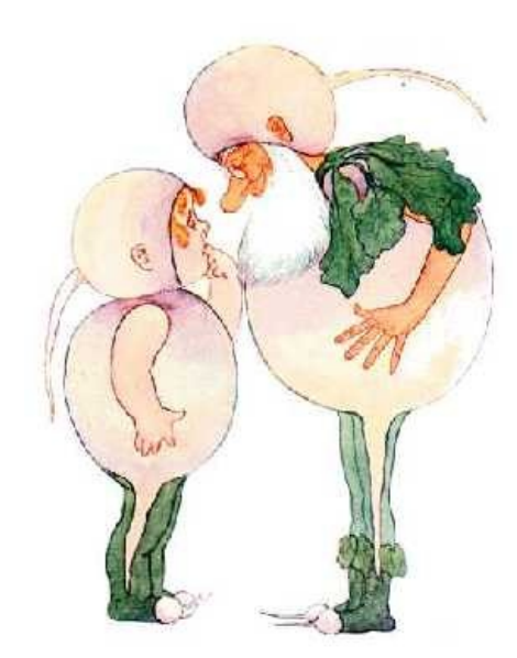
WHITE Turnip said: "I'm pale, I know And all our family are so." "I should advise," said old White Beet, "A course of sugar cakes to eat."