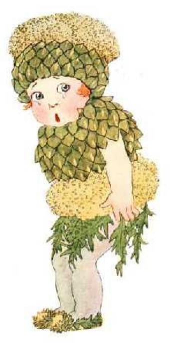
Y OUNG California Artichoke Exclaimed: "It is the richest joke That many people, young and old, How to eat me must be told!"