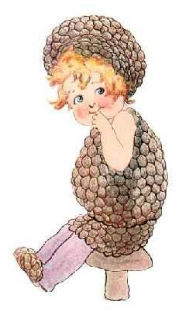
LITTLE, wise, home-loving Truffle Never lets his temper ruffle; His home is just beneath the ground, And there he always may be found.