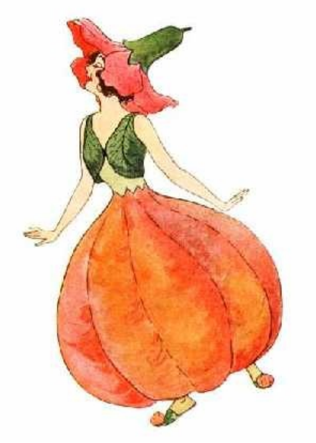
AFOREIGN lady of renown— Pomegranate in her crimson gown, Smiling and nodding as she goes, Looks like an Oriental rose.