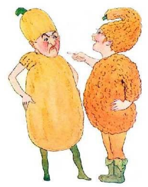
T EGETABLE Marrow liked to tell How he was once an English swell; Summer Squash laughed and said: "My word! That's quite the best thing Hi 'ave 'eard."