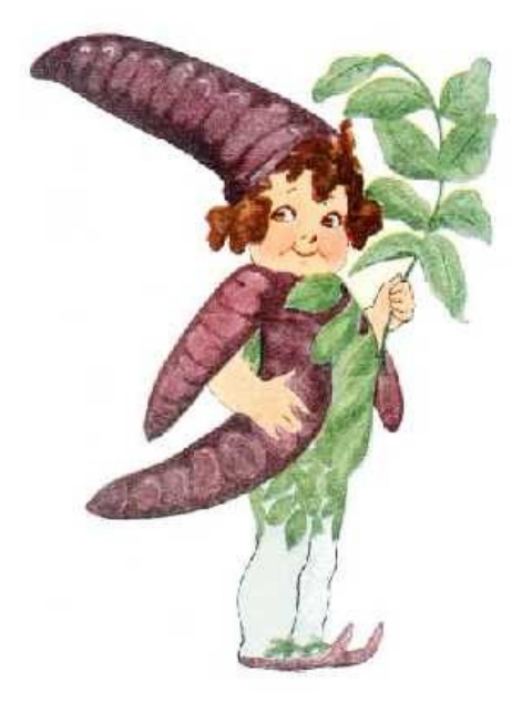
THE oddest child—when all is said— Of those we've met, is St. John's Bread; He's Spanish, so I've understood, And makes a food that's very good.