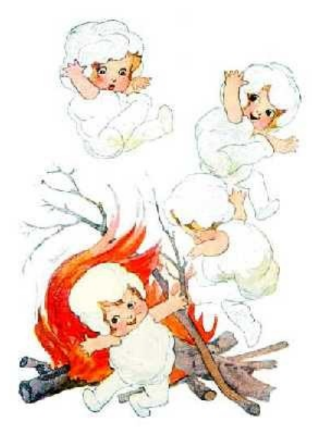
T^{\text{HE Popcorn children are so dear}}_{\text{They stay with us all through the year;}}_{\text{They like to dance in dresses white Around the open fire at night.}}