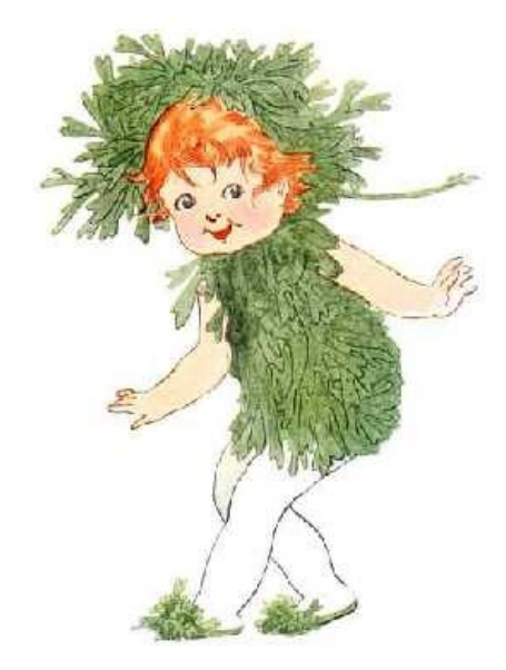
ARRAGEEN makes his bow to you. ▶ He's a sea child, that is true, But he's so jolly—never cross— His other name is Irish Moss.