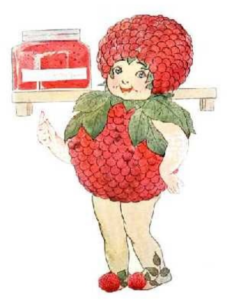
" G^{\text{OOD morning, friends!}} Know who I am? I'm Raspberry who makes the jam; You know—that on the pantry shelf—I make that every year myself."