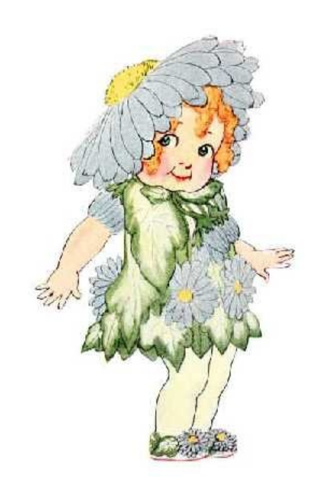
Y new spring dress," said Chicory, "Is just as lacy as can be; Shading from green to purest Its ruffles are my heart's delight!"