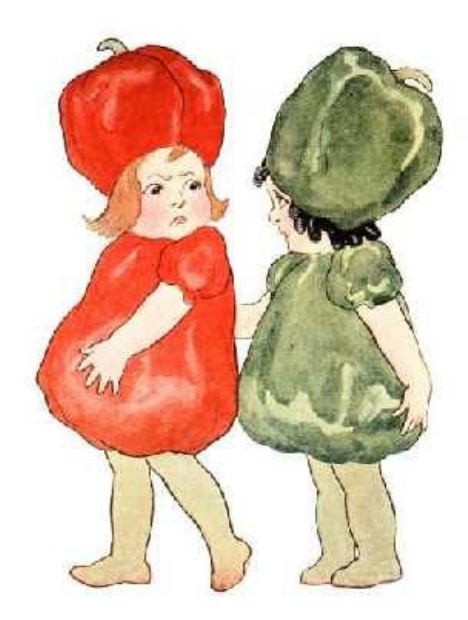
RED Pepper said a biting word Which Miss Green Pepper overheard; Said she: "Hot words you can't recall; Better not say such things at all."