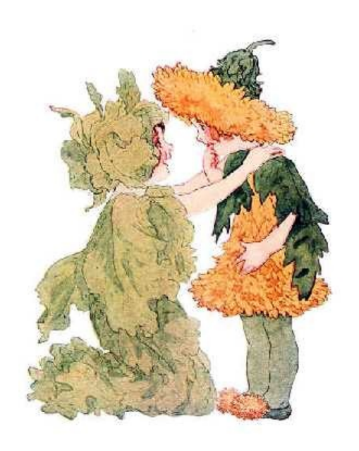
SAID Lettuce, tender-hearted lass: "Come Dandelion, 'neath my glass;" But Dandelion smiled and said She liked the nice fresh air instead.