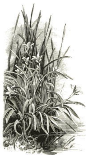
Day Lily by margin of water.

mountain watercourses, dry in the autumn when it is at rest; both flowers and foliage are effective, and the growth very vigorous when in moist ground. It would require a very long list to enumerate all the plants that would grow near the margins of water, and apart from the aquatics proper; but enough has been said to prove that, given a strip of ground beside a stream or lake, a garden of the most delightful kind could be formed. The juxtaposition of plants inhabiting different situations—water-plants, water-side plants, and land-plants thriving in moist ground—would prevent what would, in many cases, be so undesirable—a general admixture of the whole. Two distinct classes of effects could be obtained, the beauty of the flowers seen close at hand, and that of the more conspicuous kinds in the distance, or from the other side of the water of a stream or lakelet.