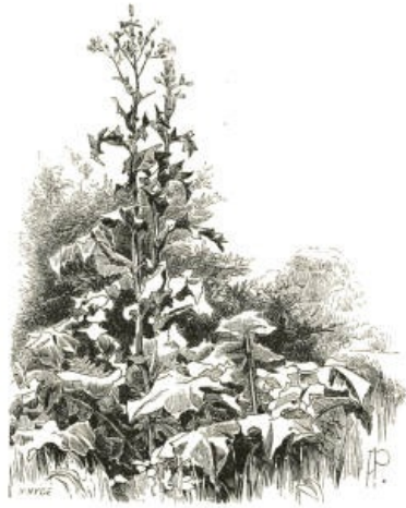
Blue flowered Composite plant; fine foliage and habit; type of noble plants excluded from gardens. (Mulgedium Plumieri.)

individual species will proclaim itself when at its height; and when out of bloom they will be succeeded by other kinds, or lost among the numerous objects around.