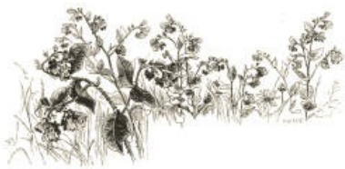
Caucasian Comfrey in shrubbery.

form some idea of what we may do by selecting from the numerous plants that grow in the meadows and mountain-woods of Europe, Asia, and America.