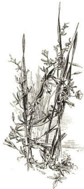
A South European Bindweed creeping up the stems of an Iris in an English garden.

American Cowslip, Dodecatheon . —All who care for hardy flowers admire the beautiful American cowslip ( D. Meadia ), found in rich woods in Pennsylvania, Ohio, to Wisconsin and south-westward, in America. This would be a charming plant to naturalise on rich and light sandy loams, among dwarf herbs, low shrubs, etc., in sheltered and sunny spots. Jeffrey's American cowslip ( D. Jeffreyanum ), a vigorous-growing kind, is also well worth a trial in this way, though as