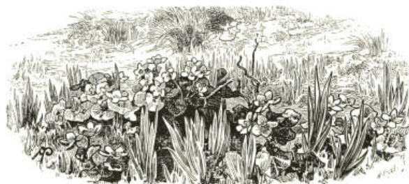
Marsh Marigold and Iris in early spring. (See p. 77.)