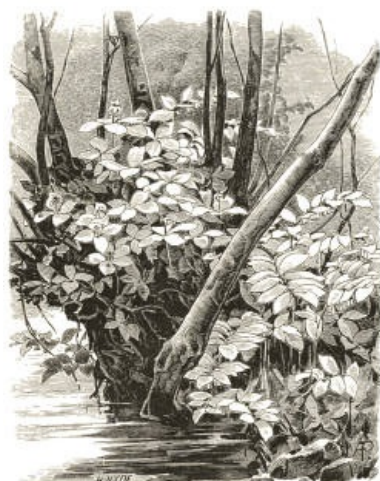
Solomon's Seal and Herb Paris, in copse by streamlet.

Nearly all landscape gardeners seem to have put a higher value on the lake or fish-pond than on the brook as an ornament to the garden; but, while we allow that many places are enhanced in beauty and dignity, by a broad expanse of water, many pictures might be formed by taking advantage of a brook as it meanders through woody glade or meadow. No such beauty is afforded by a pond or lake, which gives us water in repose—imprisoned water, in fact; and although we obtain breadth by confining water, still, in many cases, we prefer the brook, or water in motion, as it ripples between mossy rocks or flower-