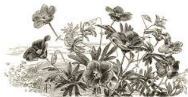
A hardy Geranium.

Geranium, Geranium , Erodium . —Handsome and rather dwarf perennials, mostly with bluish, pinkish, or deep rose flowers, admirable for naturalisation. Some of the better kinds of the hardy geraniums, such as G. ibericum , are the very plants to take care of themselves on wild banks and similar places. With them might be associated the fine Erodium Manescavi ; and where there are very bare places, on which they would not be overrun by coarser plants, the smaller Erodiums , such as E. romanum , might be tried with advantage.