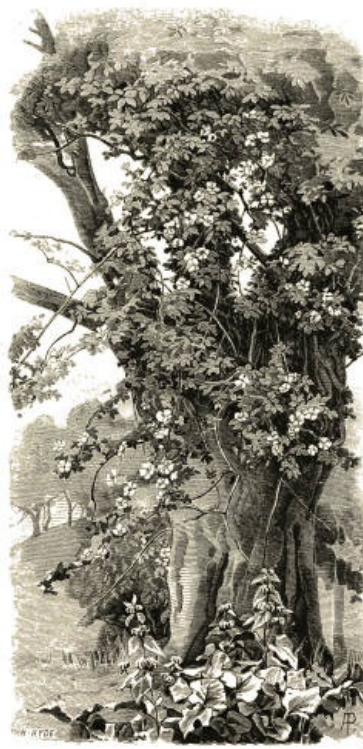
Wild Rose growing on a Pollard Ash in Orchardleigh Park, Somerset.

and now fairly threatens to gain the mastery. We had the curiosity to measure the plant the other day, and found it rather over seventy feet in circumference. Within this space the plant forms an irregular undulating mound, nearly in all parts so densely covered with Roses that not so much as a hand's breadth is left vacant anywhere, and the Laurel branches are quite hidden, and in fact are now dying, smothered by the Rose. A finer example of luxuriant development we never saw. The plant has been a perfect sheet of bloom for a month or more, and there are thousands of buds yet to expand, and hundreds of bunches of buds have been cut just at the opening stage—when they are neater and whiter than a Gardenia—to send away. The tree has never received the least attention or assistance with the exception of the removal of the Laurel tops before mentioned, to let the light into it. It is growing in a tolerably deep and strong dry loam, and this, together with head room, seems to be all it requires.