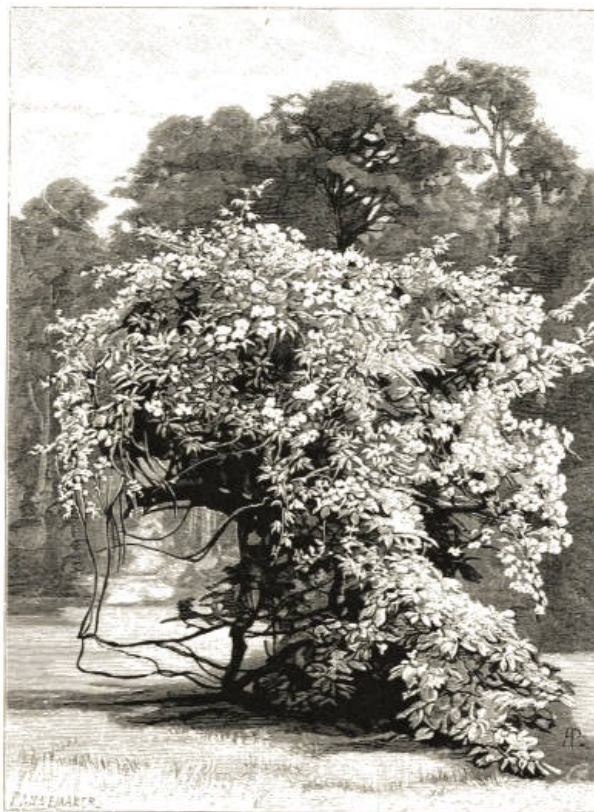
White Climbing Rose scrambling over old Catalpa Tree.

Roses on grass are a pleasant feature of the wild garden. No matter what the habit of the rose, provided it be free and hardy, and growing on its own roots, planting on the grass will suit it well. So treated, the more vigorous climbers would form thickets of flowers, and graceful vigorous shoots. They will do on level grass, and be still more picturesque on banks or slopes.