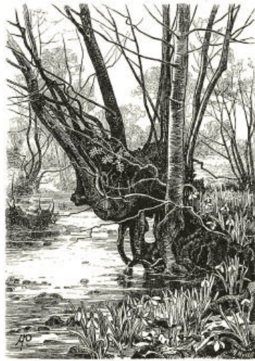
Snowdrops, wild, by streamlet in valley.

officinalis and its white variety are among the very best of all tall border flowers, and they are equally useful for planting in rough and wild places, as is also the blue G. orientalis and G. biloba . They are all free growers.