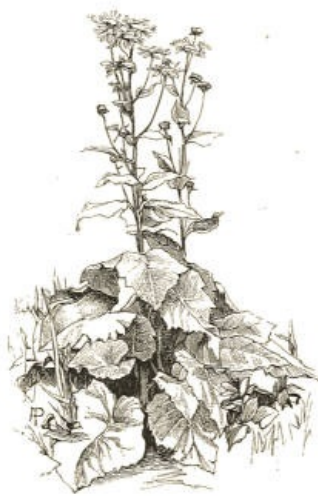
Telekia. Type of the Larger Composites excluded from gardens proper.

Flame-Flower, Tritoma . —Flame Flowers are occasionally planted in excess, so as to neutralise the good effect they might otherwise produce, and they, like many other flowers, have suffered from being, like soldiers, put in straight lines and in other geometrical formations. It is only where a fine plant or group of plants is seen in some green glade that the true beauty of the Flame Flower is seen, especially at some little distance off. Although not exactly belonging to the very free-growing and extremely hardy genera of plants recommended for the wild garden, they are so free in many soils that they might with confidence be recommended for that purpose, and our sketch shows a picturesque group of them planted in this way. It would be delightful if people having country seats would study more the effects to be realised from certain types of plants. For instance, a well and tastefully placed group of these Flame Flowers would for a long time in autumn be a most effective feature in the landscape of a country seat; and there are various other plants to which the same remark applies, though perhaps to none better than these in the later months