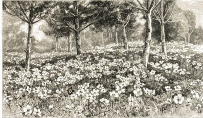
Anemones in the Riviera. Thrive equally well in any open soil here, only flowering later.

There are many of the Ranunculi, not natives of Britain, which would grow as freely as our native kinds. Many will doubtless remember with pleasure the pretty button-like white flowers of the Fair Maids of France ( Ranunculus aconitifolius fl. pl.), a frequent ornament of the old mixed border. This, and the wild form from which it comes—a frequent plant in alpine meadows—may also be enjoyed in our wild garden. Quite distinct from all these, and of chastest beauty when well grown, is R. amplexicaulis , with flowers of pure white, and simple leaves of a dark glaucous green and flowing graceful outline; a hardy and charming plant on almost any soil. This is one of the elegant exotic forms of a family well represented in the golden type in our meadows, and therefore it is welcome as giving us a strange form. Such a plant deserves that pains be taken to establish it in good soil, in spots where a rank vegetation may not weaken or destroy it.