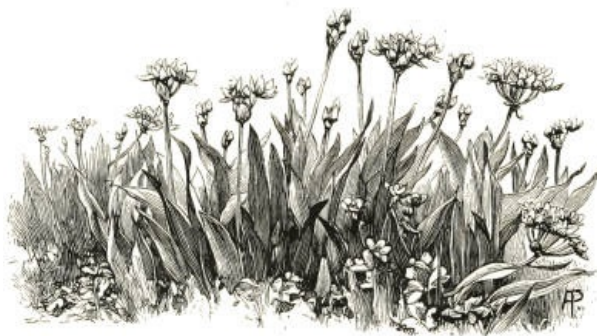
The Yellow Allium ( A. Moly ) naturalised.