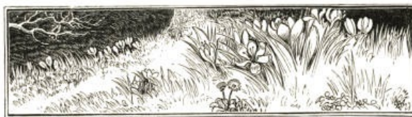
Crocuses in turf, in grove of Summer leafing trees.