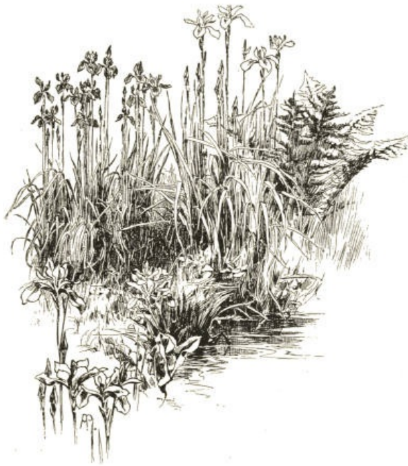
Colony of hardy exotic Flowers, naturalised by brook-side.