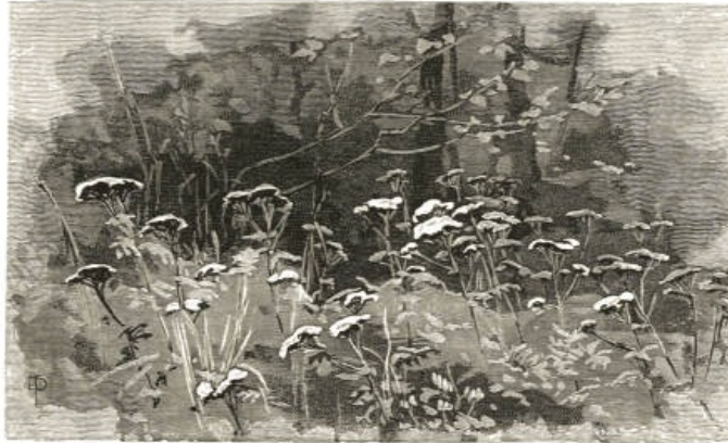
Large White Achilleas spread into wide masses under shade of trees in shrubbery.

garden! Of course all the labour required to produce this miserable result of dug borders is worse than thrown away, as the shrubberies would do better if let alone, and by utilising the power thus wasted, we might highly beautify the positions that are now so ugly.