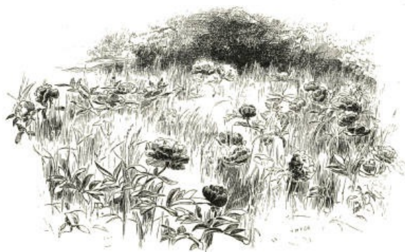
Double Crimson Pæonies in grass.

The Clematis-like Atragene alpina is one of my favourite flowers—seldom seen now-a-days, or indeed at any time, out of a botanical garden, and till lately not often seen in one. It likes to trail over an old stump, or through a thin low bush, or over a rocky bank, and it is a perfectly hardy plant. Speaking of such plants as this, one would like to draw a sharp distinction between them and the various weedy and indistinct subjects which are now creeping into cultivation owing to the revival of interest in hardy plants. Many of these have some botanical interest, but they can be only useless in the garden. Our chief danger now is getting plants into cultivation which are neither very distinct nor very beautiful, while perhaps we neglect many of the really fine kinds. This Atragene is a precious plant for low bush and bank wild garden.