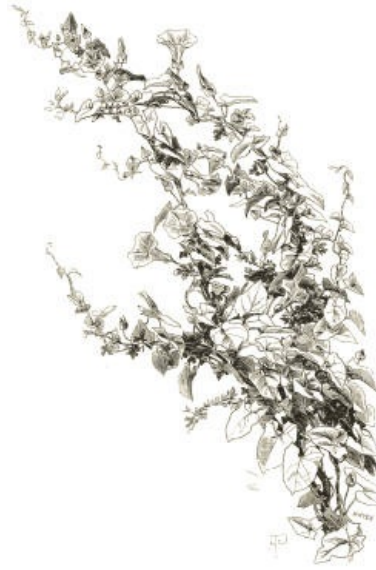
The large white Bindweed, type of nobler climbing plants, with annual stems. For copses, hedgerows, and shrubberies.

This climbing vegetation may be trained and tortured into forms in gardens, but never will its beauty be seen until we entrust it to the garlanding of shrub, and copse, or hedgerow, fringes of dwarf plantation, or groups of shrubs and trees. All to be done is to put in a few tufts of any desired kind, and leave them alone, adapting the kind to the position. The large, flesh-coloured Bindweed, for example, would be best in rough places, out of the pale of the pleasure-ground or garden, so that its roots would not spread where they could do harm, while a delicate Clematis might be placed beneath the choicest specimen Conifer, and allowed to paint its rich green with fair flowers. In nature we frequently see a Honeysuckle clambering up through an old Hawthorn tree, and then struggling with it as to which should produce the greatest profusion of blossoms—but in gardens not yet. Some may say that this cannot be done in gardens; but it can be done infinitely better in gardens than it has ever been done in nature; because, for gardens we can select plants from many countries. We can effect contrasts, in which nature is poor in any one place in consequence of the comparatively few plants that naturally inhabit one spot of ground. People seldom remember that "the art itself is nature;" and foolish old laws laid down by landscape-gardeners are yet fertile in perpetuating the notion that a garden is a "work of art, and therefore we must not attempt in it to imitate nature."