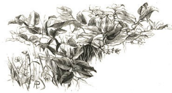
Partridge Berry ( Gualtheria ).

Bogs are neither found or desired in or near our gardens now-a-days, but, wherever they are, there are many handsome flowers from other countries that will thrive in them as freely as in their native wastes.