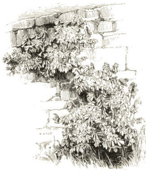
The Yellow Fumitory on wall ( Corydalis lutea ).