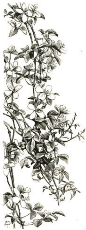
The Mountain Clematis ( C. montana ).