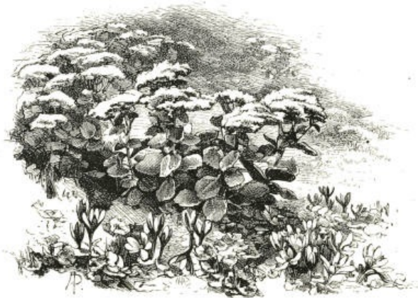
Large Japan Sedum ( S. spectabile ) and Autumn Crocuses in the Wild Garden.