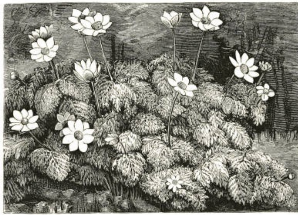
The Alpine Windflower ( Anemone alpina ).

Windflower, Anemone . —A numerous race of dwarf herbs that contribute largely to the most beautiful effects of the mountain, wood, and pasture vegetation of all northern and temperate climes. The flowers vary from intense scarlet to the softest blue; most of the exotic kinds would thrive as well in our woodlands and meadows as they do in their own. There is hardly a position they may not adorn—warm, sunny, bare banks, on which the Grecian A. blanda might open its large blue flowers in winter; the tangled copse, where the Japan Windflower and its varieties might make a bold show in autumn; and the shady wood, where the Apennine Windflower would contrast charmingly with the Wood Anemone so abundantly scattered in our own woods. The Hepaticas should be considered as belonging to the same genus, not forgetting the Hungarian one, A. angulosa . The Hepaticas thrive best and are seen best in half-woody places, where the spring sun may cheer them by passing through the branches, which afterwards become leafy and shade them from the scorching heats of summer.