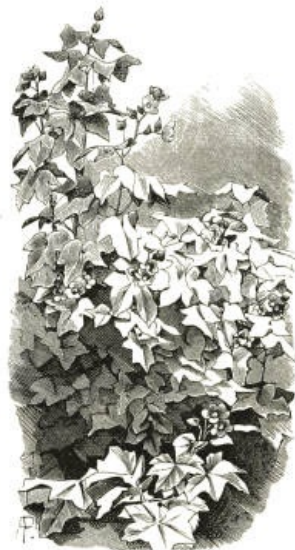
The Nootka Bramble; type of free-growing flowering shrub. For copses and woods.

Sometimes, where there are large and bare slopes, an excellent effect may be obtained by planting the stouter climbers, such as the Vines, Mountain Clematis, and Honeysuckles, in groups or masses on the grass, away from shrubs or low trees; while, when the banks are precipitous or the rocks crop forth, we may allow a curtain of climbers to fall over them.