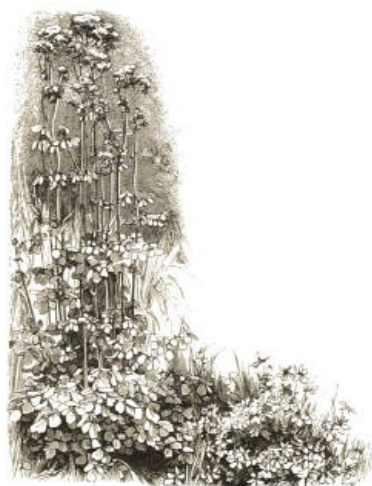
Large-flowered Meadow Rue in the Wild Garden, type of plant mostly excluded from the Garden.

About a generation ago a taste began to be manifested for placing a number of tender plants in the open air in summer, with a view to the production of showy masses of decided colour. The subjects selected were mostly from sub-tropical climates and of free growth; placed annually in the open air of our genial early summer, and in fresh rich earth, every year they grew rapidly and flowered abundantly during the summer and early autumn months, and until cut down by the first frosts. The showy colour of this system was very attractive, and since its introduction there has been a gradual rooting out of all the old favourites in favour of this "bedding" system. This was carried to such an extent that it