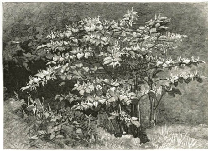
The Great Japan Knotweed ( Polygonum cuspidatum ). (Showing the plant in flower.)

Polygonum cuspidatum . —If, instead of the formal character of much of our gardening, plants of bold types similar to the above were introduced along the sides of woodland walks and shrubbery borders, how much more enjoyable such places would be, as at almost every step there would be something fresh to attract notice and gratify the eye, instead of which such parts are generally bare, or given up to weeds and monotonous rubbish.