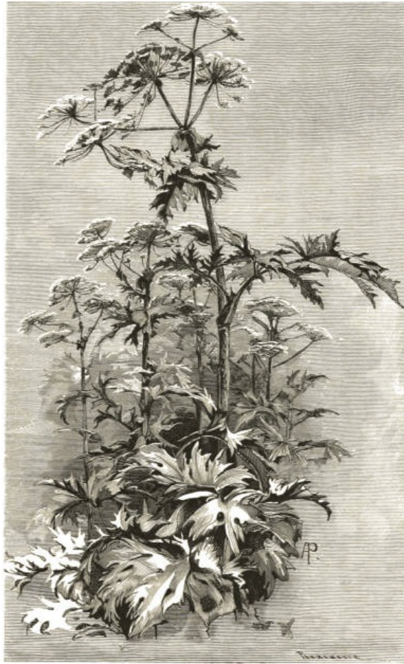
Giant Cow Parsnip. Type of Great Siberian herbaceous vegetation. For rough places only.