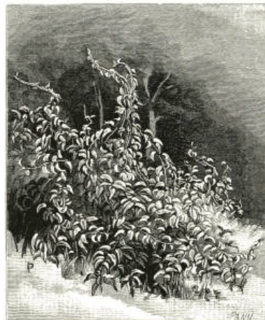
Climbing shrub (Celastrus), isolated on the grass; way of growing woody Climbers away from walls or other supports.

Mr. Hovey, in a letter from Boston, Mass., wrote as follows, on certain interesting aspects of tree drapery:—Some ten or fifteen years ago we had occasion to plant three or four rows of popular climbers in nursery rows, about 100 feet long; these consisted of the Virginian creeper, the Moonseed ( Menispermum ), Periploca græca , and Celastrus scandens ; subsequently, it happened accidentally that four rows of rather large Tartarian (so-called) Arbor-vitæ were planted on one side, and about the same number of rows of Smoke trees, Philadelphus , and Cornus florida , on the other. For three or four years many