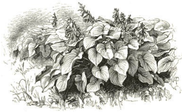
Groups of Funkia Sieboldi.

Snakes-head, Fritillaria . —The beautiful British snakes-head ( F. Meleagris ) grows wild, as most people know, in meadows in various parts of England, and we should like to see it as well established in the grassy hollows of many a country seat. Various other Fritillarias not so pretty as this, and of a peculiar livid dark hue, which is not like to make them popular in gardens, such as F. tristis , would be worthy of a position also; while the Crown Imperial would do on the fringes of shrubberies.