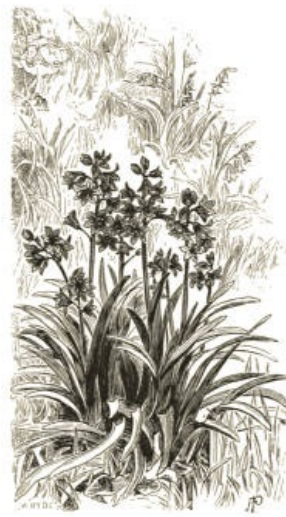
The association of exotic and British wild flowers in the Wild Garden.—The Bell-flowered Scilla, naturalised with our own Wood Hyacinth.

variety, Scillas, Grape-Hyacinths, earlier and smaller Narcissi, the Wood Anemone, and any other pretty Spring flowers that were suitable to the soil and position, we should have a glimpse of the vernal beauty of temperate and northern climes, every flower relieved by grass blades and green leaves, the whole devoid of any trace of man, or his exceeding weakness for tracing wall-paper patterns, where everything should be varied, indefinite, and changeful. In such a garden it would be evident that the artist had caught the true meaning of nature in her disposition of vegetation, without sacrificing one jot of anything of value in the garden, but, on the contrary, adding the highest beauty to spots devoid of the slightest interest. In connection with this matter I may as well say here that mowing the grass once a fortnight in pleasure grounds, as now practised, is a great and costly mistake . We want shaven carpets of grass here and there, but what cruel nonsense both to men and grass it is to shave as many foolish men shave their