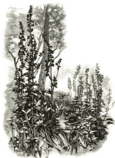
Tall Perennial Larkspurs, naturalised in Shrubbery (1878).

One of the prettiest effects which I have ever seen was a colony of tall Larkspurs. Portions of old roots of several species and varieties had been chopped off when a bed of these plants was dug in the autumn. For convenience sake the refuse had been thrown into the neighbouring shrubbery, far in among the shrubs and trees. Here they grew in half-open spaces, which were so far removed from the margin that they were not dug and were not seen. When I saw the Larkspurs in flower they were certainly the loveliest things that one could see. They were more beautiful than they are in borders or beds, not growing in such close stiff tufts, but mingling with and relieved by the trees above and the shrubs around. Little more need be