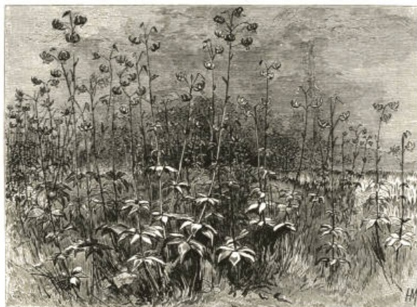
The Turk's Cap Lily, naturalised in the grass by wood-walk.