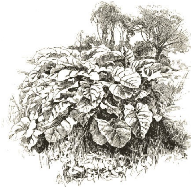
The Cretan Borage ( Borago cretica ).

The Cretan Borage is a curious old perennial, seldom seen in gardens; and deservedly so, for its growth is robust and its habit coarse. It is, however, a capital plant for the wild garden, or for rough places—in copse, or shrubbery, or lane, where the ample room which it requires would not be begrudged, and where it may take care of itself from year to year, showing among the boldest and the hardiest of the early spring flowers.