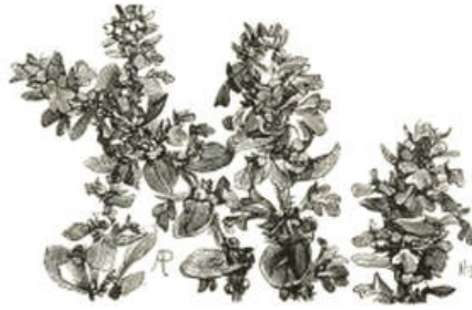
Flowers of Geneva Bugle ( Ajuga genevensis ), Dwarf Boragewort.

gardening of the happiest kind only. These Borageworts, richer in blue flowers than even the gentians, are usually poor rusty things in exposed sunny borders, and also much in the way when out of flower, whereas in shady lanes, copses, open parts of not too dry or impoverished shrubberies, in hedgerow-banks, or ditches, we only notice them in their beautiful bloom.