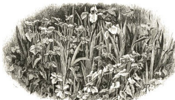
The same spot as in opposite sketch, with aftergrowth of Iris, Meadow Sweet, and Bindweed. (See p. 77.)