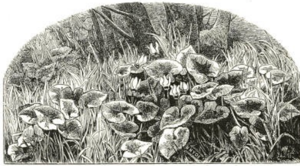
Cyclamens in the wild garden; from nature.

The Giant Sea-kale, Crambe . —“ C. cordifolia is a very fine perennial, but its place is on the turf in rich soil. It has enormous leaves, and small whitish flowers in panicles. Here it is one of the finest ornaments in a wild garden of about five acres, associated with Rheums, Ferulas, Gunneras, Centaurea babylonica , Arundo Donax , Acanthus , and others.”