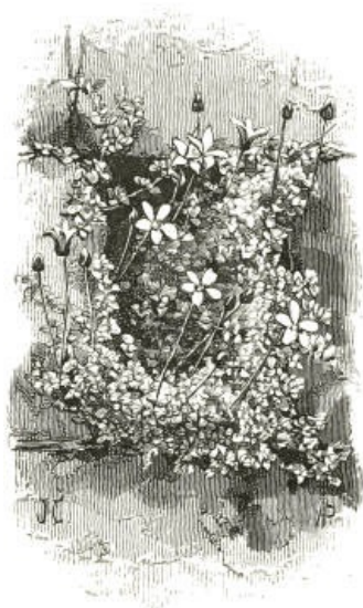
Arenaria balearica , in a hole in wall at Great Tew.

A most interesting example of wall gardening is shown on the opposite page. In the gardens at Great Tew, in Oxfordshire, this exquisite little alpine plant, which usually roots over the moist surface of stones, established itself high up on a wall in a small recess, where half a brick had been displaced. The illustration tells the rest. It is suggestive, as so many things are, of the numerous plants that may be grown on walls and such unpromising surfaces.