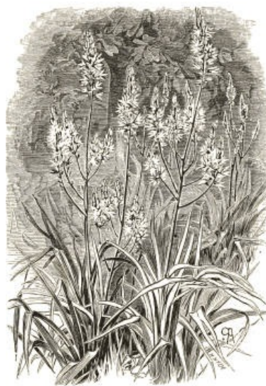
Tall Asphodel in copse.

Sandwort , Arenaria .—A most important family of plants for the wild garden, though perhaps less so for lowland gardens where more vigorous types flourish. There are, however, certain species that are vigorous and indispensable, such as A. montana and A. graminifolia . The smaller alpine species are charming for rocky places, and the little creeping A. balearica has quite a peculiar value, inasmuch as moist rocks or stones suffice for its support. It covers such surfaces with a close carpet of green, dotted with numerous star-like flowers. Some of the smaller species, such as Arenaria cæspitosa ( Sagina glabra var.), better known as Spergula pilifera , might be grown in the gravel, and