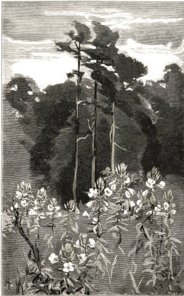
Night effect of large evening Primrose in the Wild Garden ( Enothera Lamarkiana )

Among my reasons for advocating this system are the following: