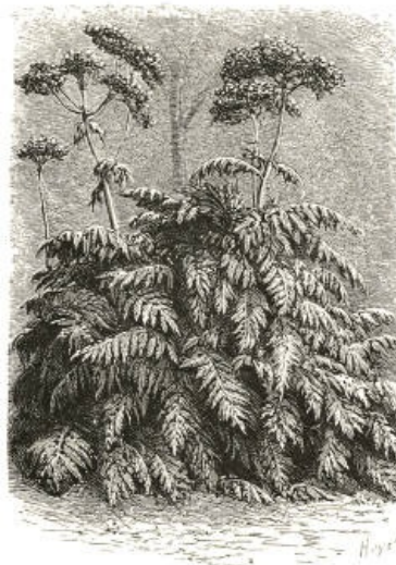
Type of fine-leaved umbellate plants seldom grown in gardens.

There is one exotic species, M. dissitiflora , not inferior in beauty to any of our handsomest native kinds, and which is well worthy of naturalisation everywhere, thriving best on moist and sandy soil.