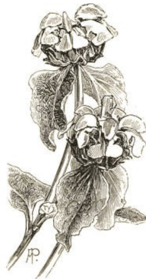
Phlomis. —Type of handsome Labiates; admirably suited for the wild garden. (See p. 154.)

Poppy, Papaver , in var. —The huge and flaming Papaver orientale , P. bracteatum , and P. lateritium , are the most important of this type. They will thrive and live long in almost any position, but the proper place for them is in open spots among strong herbaceous plants. For the wild garden or wilderness the Welsh Poppy ( Meconopsis cambrica ) is one of the best plants. It is a cheerful plant at all seasons; perched on some old dry wall its masses of foliage are very fresh, but when loaded with a profusion of large yellow blossoms the plant is strikingly handsome; it is a determined coloniser, ready to hold its own under the most adverse circumstances. Its home is the wall, the rock, and the ruin. It even surpasses the Wallflower in adapting itself to strange out-of-the-way places; it will spring up in the gravel walk under one's feet, and seems quite happy among the boulders in the courtyard. It looks down on one from crevices in brick walls, from chinks where one could scarcely introduce a knife-blade, and after all it delights most in shady places. No plant can be better adapted for naturalising on rough stony banks, old quarries, gravel pits, dead walls, and similar places, and its large handsome flowers will lend a charm to the most uninteresting situations.