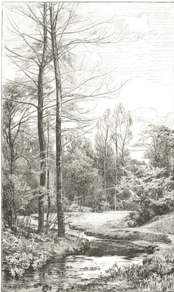
Valley in Somersetshire, with Narcissi, Marsh Marigolds, and Primroses.

Then there is the fine and large N. advena , a native of America, which pushes its leaves boldly above the water, and is very vigorous in habit. It is very plentiful in the Manchester Botanic Garden, and will be found to some extent in most gardens of the same kind. The American White Water Lily ( Nymphæa odorata ) is a noble species, which would prove quite hardy in Britain. It is a pity this noble aquatic plant is not more frequently seen, as it is quite as fine as our own Water Lily. Rose-coloured varieties are spoken of, but are not yet in cultivation here.