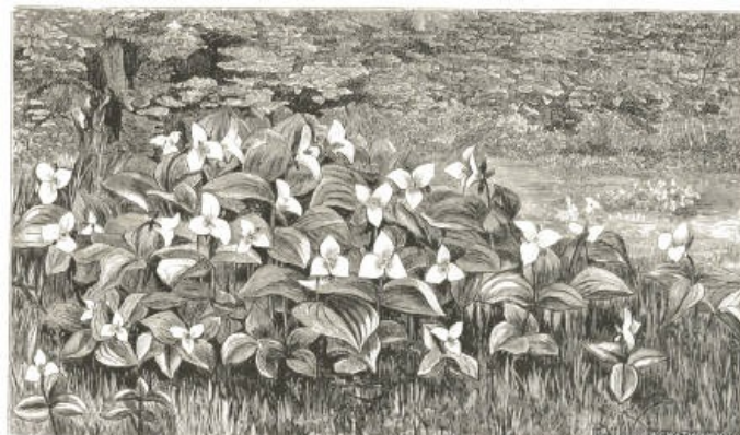
The American White Wood-Lily ( Trillium grandiflorum ) in Wild Garden, in wood bottom in leaf-mould.