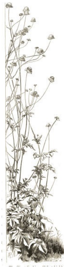
The Giant Scabious (8 feet high). ( Cephalaria procera .)

What first suggested the idea of the wild garden, and even the name to me, was the desire to provide a home for a great number of exotic plants that are unfitted for garden culture in the old sense. Many of these plants have great beauty when in flower, and perhaps at other seasons, but they are frequently so free and vigorous in growth that they overrun and destroy all their more delicate