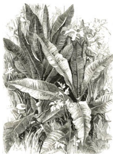
Foliage of Dipsacus , on hedge- bank in spring.

Men usually seek sunny positions for their gardens, so that even those obliged to be contented with the north side of the hill would scarcely appreciate some of the above-named positions. What, the gloomy and weedy dyke as a garden! Yes, there are ditches, dry and wet, in every district, that may readily be made more beautiful than many a "modern flower-garden." But what would grow in them? Many of the beautiful wood and shade-loving plants of our own and similar latitudes—things that love not the open sunny hill-sides or wide meadows, but take shelter in the stillness of deep woods or in dark valleys, are happy deep between riven rocks, and gaily occupy the little dark caves