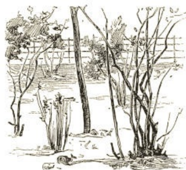
Dug and mutilated Shrubbery in St. James's Park. Sketched in winter of 1879.

In the winter season, or indeed at any other season, one of the most melancholy things to be seen in our parks and gardens are the long, bare, naked shrubberies, extending, as along the Bayswater Road, more or less for a mile in a place; the soil greasy, black, seamed with the mutilated roots of the poor shrubs and trees; which are none the better, but very much the worse, for the cruel annual attention of digging up their young roots without returning any adequate nourishment or good to the soil. Culturally, the whole thing