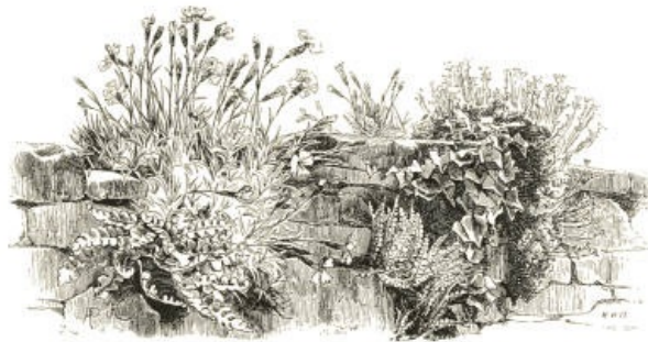
Cheddar Pink, Saxifrage, and Ferns, on cottage wall at Mells.