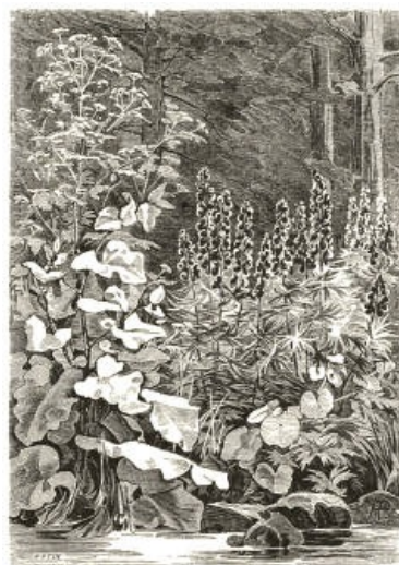
The Monkshood, naturalised by wet ditch in wood.

Monkshood, Aconitum . —These are tall, handsome perennials, with very poisonous roots, which make it dangerous to plant them in or near gardens. Being usually very vigorous in constitution, they spread freely, and hold their own amongst the strongest herbaceous plants and weeds; masses of them seen in flower in copses or near hedgerows afford a very fine effect. There are many species, all nearly of equal value for the wild garden. Coming from the plains and mountains of Siberia and Northern Europe and America, they are among the hardiest of plants. When spreading groups of Aconites are in bloom in copses or open spaces in shrubberies, their effect is far finer than when the plants are tied into bundles in trim borders. The old blue-and-white kind is charming in half-shady spots, attaining stately dimensions in good soil. The species grow in any soil, but are often somewhat stunted in growth on clay.