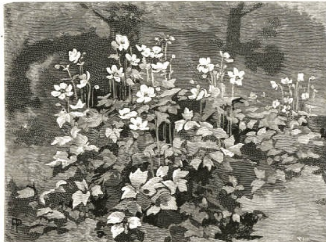
The White Japan Anemone in the Wild Garden.

Few plants are more lovely in the wild garden than the White Japan Anemone. The idea of the wild garden first arose in the writer's mind as a home for a numerous class of coarse-growing plants, to which people begrudge room in their borders, such as the Golden Rods, Michaelmas Daisies, Compass plants, and a host of others, which are beautiful for a season only, or perhaps too rampant for what are called choice borders and beds. This Anemone is one of the most beautiful of garden flowers, and one which is as well suited for the wild garden as the kinds alluded to. It grows well in any good soil in copse or shrubbery, and increases rapidly. Partial shade seems to suit it; and in any case the effect of the large white flowers is, if anything, more beautiful in half-shady places. The flowers, too, are more lasting here than where they are fully exposed.