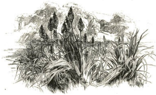
Group of Tritoma, in grass.

Showy Indian Cress, Tropæolum speciosum . —Against terrace walls, among shrubs, and on slopes, on banks, or bushy rockwork near the hardy fernery; in deep, rich, and light soil. This is a brilliant plant, well worth any trouble to establish. Many fail to establish it in the garden proper, but moist, shady, and bushy places, will suit it better.