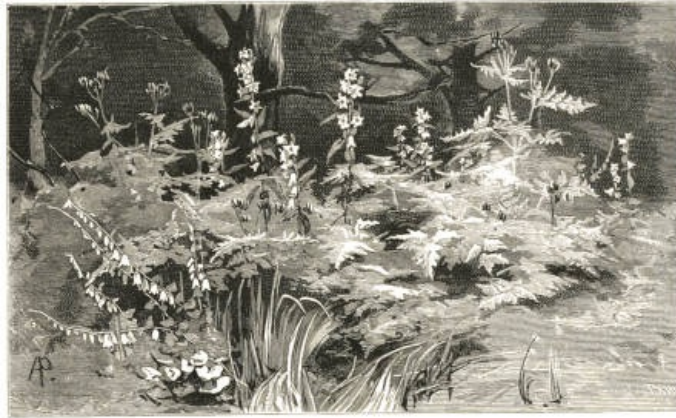
A beautiful accident.—A colony of Myrrhis odorata , established in shrubbery, with white Harebells here and there. (See p. 60.)