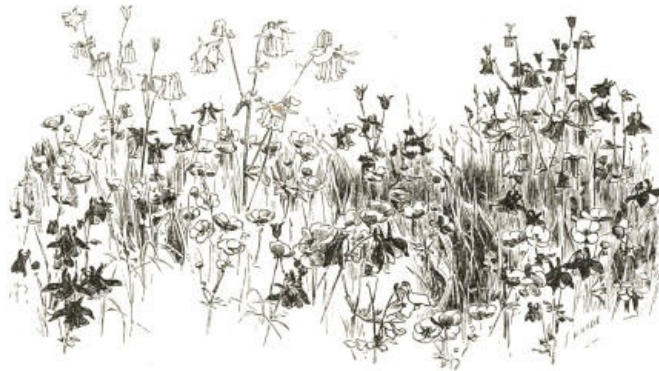
Columbines and Geraniums in meadow-grass.