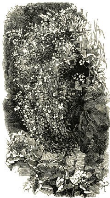
Sun Rose on limestone rocks.

known of which is Helianthus multiflorus fl. pl., of which plenty may be seen in Euston Square and other places in London. As a rule these are all better fitted for rough places than for gardens, where, like many other plants mentioned in these pages, they will tend to form a vigorous herbaceous covert. H. rigidus is a brilliantly showy plant, running very freely at the root, and an excellent subject for naturalisation. H. giganteus , common in thickets and swamps in America, and growing as high as 10 ft., is also desirable. The showy and larger American Rudbeckias , such as laciniata , triloba , and also the small but showy hirta , virtually belong to the same type. All these plants, and many others of the tall yellow-flowered composites that one sees conspicuous among herbaceous vegetation in America, would produce very showy effects in autumn, and might perhaps more particularly interest those who only visit their country seats at that time of year. The Silphiums , especially