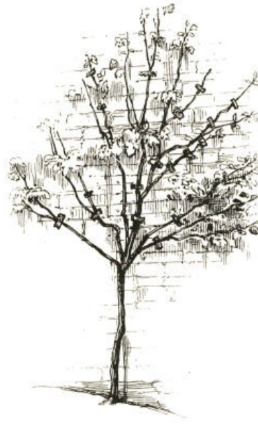
The way the climbing plants of the world are crucified in gardens—winter effect (a faithful sketch).