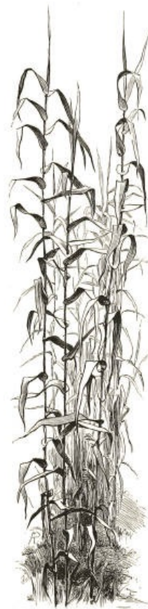
The Great Reed of

Sea Lavender, Statice . —Vigorous perennials, with a profusion of bluish lavender-coloured bloom, thriving freely on all ordinary garden soils. S. latifolia , and some of the stronger kinds, thrive