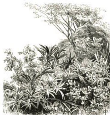
The Green Hellebore in the Wild Garden.

The Winter Aconite ( Eranthis hyemalis ) should be naturalised in every country seat in Britain—it is as easy to do so as to introduce the thistle. It may be placed quite under the branches of deciduous trees, will come up and flower when the trees are naked, will have its foliage developed before the leaves come on the trees, and be afterwards hidden from sight. Thus masses of