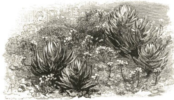
Lilies coming up through carpet of White Arabis.

foliage over the border; and then for a long time in spring it is bedecked with white flowers. Indeed, in fairly good seasons it blooms in winter too. It would take a big book to tell all the charms and merits belonging to the use of a variety of small plants to carpet the ground beneath and between those of larger growth. It need hardly be said that this argument against digging applies to two or three beds of shrubs, and places where the "shrubbery" is little larger than the dining-room, as much as to the large country seat, public park, or botanic garden.