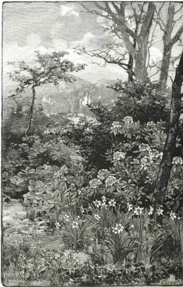
Illustration: Colonies of Poet's Narcissus and Broad-leaved Saxifrage, etc.— Frontispiece.