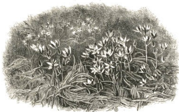
Star of Bethlehem in Grass.