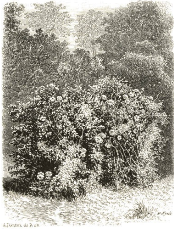
Climbing Rose isolated on grass.

tinge in the centre and at the tips of the petals. This Rose is an evergreen, and makes an excellent stock for grafting or budding. It is either planted in nursery beds, where it quickly throws up a stem suitable for standards in the same way as we employ the Dog Rose, or in hedges, and left to its naturally luxuriant growth to produce its own charming flowers in rich profusion, or rows of cuttings are put in where it is intended to leave them, and subsequently budded with some of the varieties of the diverse tribes we have named.