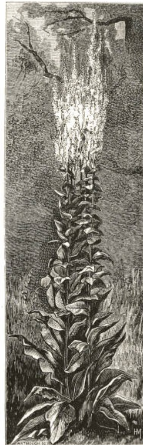
A tall Mullein.

Mullein, Verbascum . — Verbascum vernale is a noble plant, which has been slowly spreading in our collections of hardy plants for some years past, and it is a plant of peculiar merit. I first saw it in the Garden of Plants, and brought home some roots which gave rise to the stock now in our gardens. Its peculiarities, or rather its merits, are that it is a true perennial species—at least on the warm soils, and in this respect quite unlike other Mulleins which are sometimes seen in our gardens, and oftener in our hedgerows. It also has the advantage of great height, growing, as in the specimen shown in our illustration, to a height of about 10 feet, or even more. Then there are the large and green leaves, which come up rather early and are extremely effective. Finally, the colour is good and the quantity of yellow flowers with purplish filaments that are borne on one of these great branching panicles is something enormous. The use of such a plant cannot be difficult to define, it being so good in form and so distinct in habit. For the back part of a mixed border, for grouping with other plants of remarkable size or form of foliage, or for placing here and there in open spaces among shrubs, it is well suited. A bold group of it, arranged on the Grass by itself, in deep, light, and well-dressed soil, would be effective in a picturesque garden. It is also known in gardens by the name of Verbascum Chaixii , which name, we believe, was given to it at Kew.