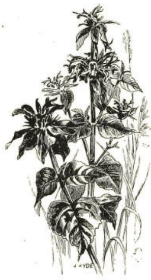
The Bee Balm, Monarda . American wood plant.

has, nevertheless, many merits as a wild garden plant, and for growing in small groups or single specimens in quiet green corners of pleasure-grounds or shrubberies. It does best in rather rich ground, and in such a position will reward all who plant it, being a really hardy and long-lived perennial. The foliage is sometimes over a yard long, and the flower-stems attain a height of over six feet in good soil.