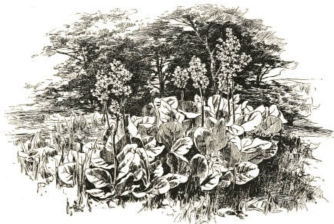
Large-leaved Saxifrage in the Wild Garden.

The only noticeable variation of surface is that of some gravel banks, which are properly covered with Stonecrops, Saxifrages, and the like, which would, as a rule, have a poor chance in the Grass. Surfaces that naturally support a very sparse and dwarf vegetation are valuable in a garden, as they permit of the culture of a series of free-growing alpine and rock plants that would not be able to hold their own among Grass and ordinary weeds and wild flowers. One of the happiest features of this wild garden results from the way in which dead trees have been adorned. Once dead, some of the smaller branches are lopped off, and one or more climbers planted at the base of the tree. Here a Clematis, a climbing Rose, a new kind of Ivy, a wild Vine, or a Virginian Creeper, have all they require, a firm support on which they may arrange themselves after their own