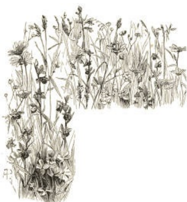
Ophrys in grass.

As it is desirable to know how to procure as well as how to select the best kinds, a few words on the first subject may not be amiss here.