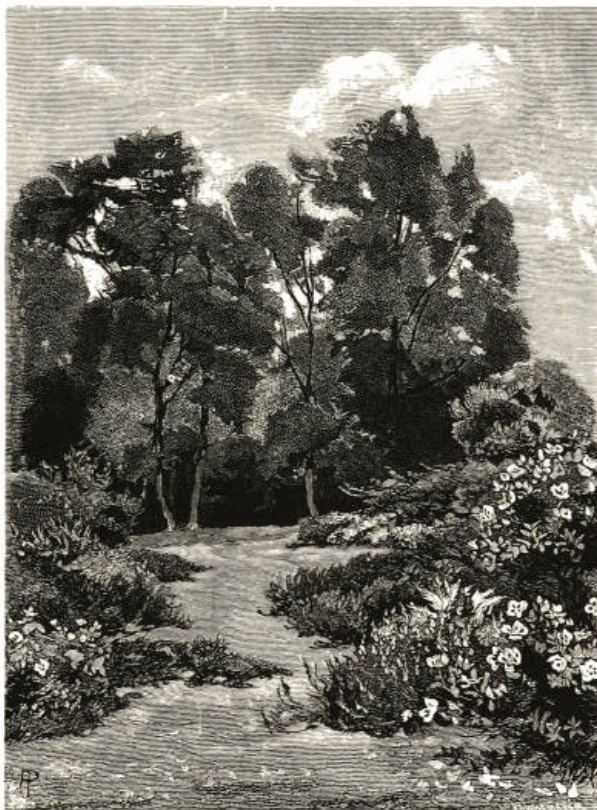
Sun Roses ( Cistus ) and other exotic hardy plants among heather, on sandy slope.

We have a dell with a small stream of spring water running through it. When I first came to Brockhurst I found this stream carried underground by a tile culvert, and the valley sides covered with Rhododendrons, the soil between carefully raked and kept free from weeds, so that it was only during springtime that flowers relieved the sombre effect of this primness. After five years this has all been changed into what I think you would call a wild garden, and we have cheerfulness and beauty all the year round.