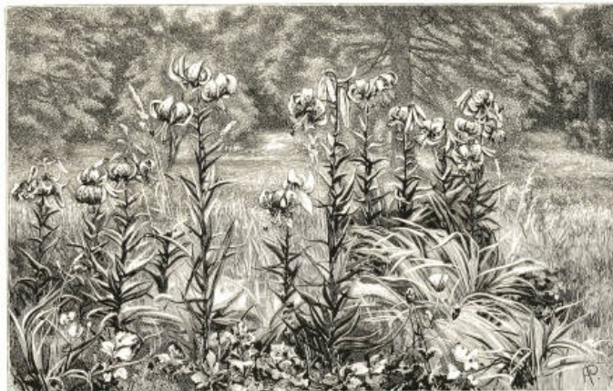
Tiger Lilies in Wild Garden at Great Tew.