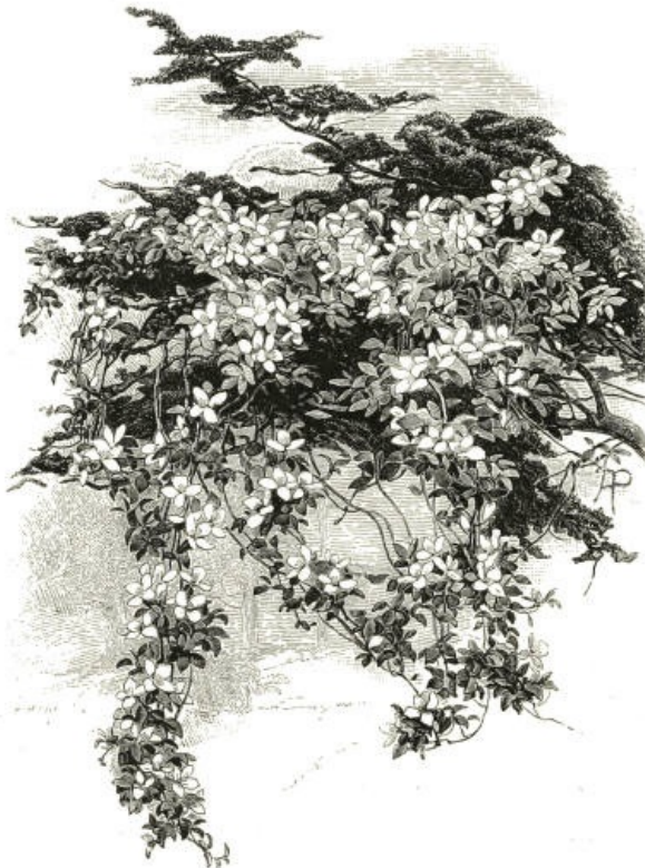
Large White Clematis on Yew tree at Great Tew. ( C. montana grandiflora .)

Some time ago I saw a Weeping Willow, on the margin of a lake, that had its trunk clothed with Virginian Creeper, and the effect in