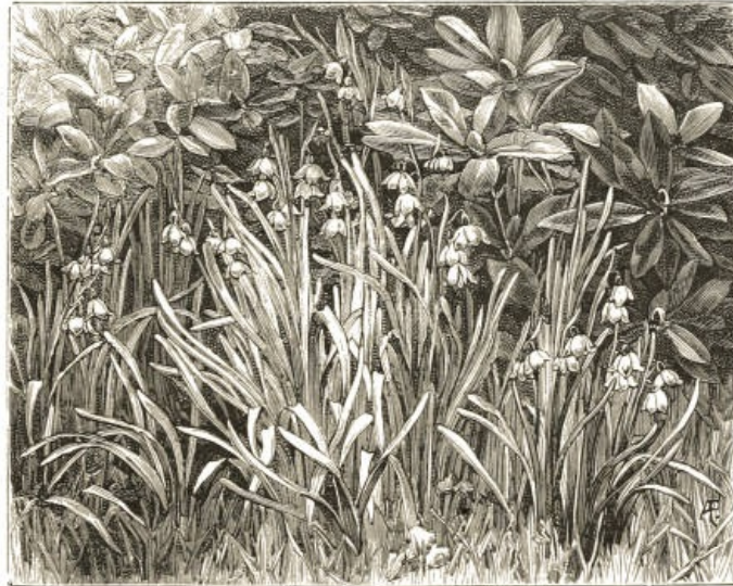
Colony of the Summer Snowflake, on margin of shrubbery.

growing right outside the ordinary boundary, in a little group. Throw away altogether the crowded masses of starved privet and pruned laurel, and let the turf pass right under a group of fine trees where such are found. This turf itself might be dotted in spring with snowdrops and early flowers; nothing, in fact, would be easier than for any intelligent person, who knew and cared for trees and shrubs, to change the monotonous wall of shrubbery into the most delightful of open-air gardens; abounding in beautiful life, from the red tassels on the topmost maples to flowers in the grass for children.