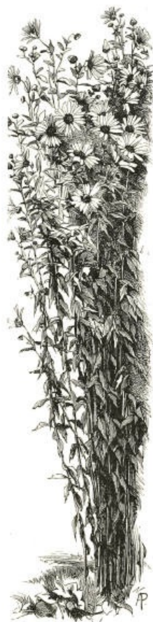
The tall Ox-eye Daisy ( Pyrethrum serotinum ).

Virginian Poke, Phytolacca decandra . —A tall, robust perennial, with conspicuous flowers and long dense spikes of purplish berries. It will grow anywhere and in any soil; but is most imposing in rich deep ones. The berries are relished by birds. It is fine for association with the largest and stoutest herbaceous plants in rough and half-wild places.