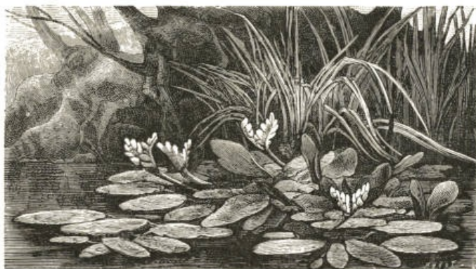
The Cape Pond Weed in an English ditch in winter.

the same applies to not a few other things of interest. Orontium aquaticum is a scarce and handsome aquatic for a choice collection, and as beautiful as any is the Water Violet ( Hottonia palustris ). It occurs most frequently in the eastern and central districts of England and Ireland. The best example of it that I have seen was on an expanse of soft mud near Lea Bridge, in Essex, where it covered the surface with a sheet of dark fresh green, and must have looked better in that position than when in water, though doubtless the place was occasionally flooded. A suitable companion for the Marsh Marigold ( Caltha ) and its varieties is the very large and showy Ranunculus Lingua , which grows in rich ground to a height of three feet or more.