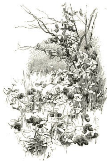
Everlasting Pea, creeping up stem in shrubbery.