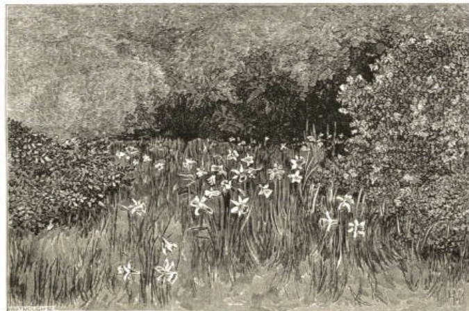
Colony of Narcissus in properly spaced shrubbery.

How do the swarming herbs of the woods and copses of the world exist in spite of the slugs? A good protection for them is hard gravel