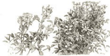
The White-flowered European Clematis ( C. erecta ).

Mostly climbing or trailing plants, free, often luxuriant, sometimes rampant, in habit, with bluish, violet, purple, white, or yellow flowers, produced most profusely, and sometimes deliciously fragrant. They are most suited for covering stumps, planting on rocky places, among low shrubs in copses, for draping over the faces of rocks, sunny banks, or the brows of sunk fences, covering objectionable railings, rough bowers, chalk pits, hedges, etc., and occasionally for isolating in large tufts in open spaces where their effect could be seen from a distance. Not particular as to soil, the stronger kinds will grow in any ground, but the large-flowered new hybrids will thrive best in warm, rich, deep soil.