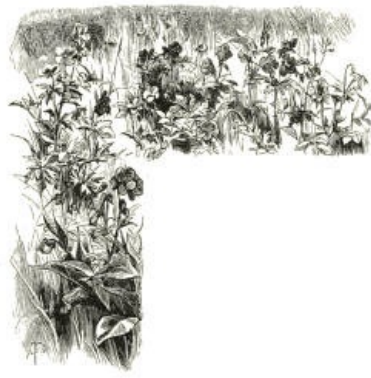
Crane's Bill wild, in grass.

Solomon's Seal. The Solomon's Seal, which is usually effective when issuing forth from fringes of shrubberies, is here best arching high over the Woodruff and other sweet woodland flowers, among which it seems a giant, with every leaf, and stem, and blossom lines of beauty. The additional vigour and beauty shown by this plant when in rich soil well repays one for selecting suitable spots for it. The greater Celandine ( Chelidonium majus ) and its double form are very pretty here with their tufts of golden flowers; they grow freely