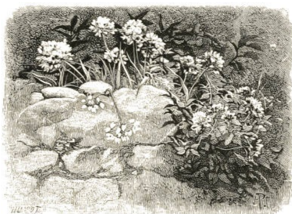
The white Narcissus-like Allium , in the orchards of Provence; type of family receiving little place in gardens which may be beautiful for a season in wild places.

Alstrœmeria .—All who care for hardy flowers must admire the beauty of Alstrœmeria aurantiaca , especially when it spreads into bold healthy tufts, and when there is a great variety in the height of the flowering stems. A valuable quality of the plant is, that in any light soil it spreads freely, and it is quite hardy. For dry places between shrubs, for dry or sandy banks (either wooded or bare), copses, or heathy places, this plant is admirable. I have noticed it thriving in the shade of fir trees. It is interesting as being a South American plant, thriving in any open soil.