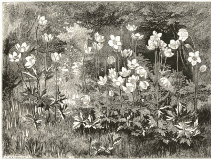
Colony of the Snowdrop-Anemone in Shrubbery not dug. Anemone taking the place of weeds or bare earth.

An essential thing is to abolish utterly the old dotting principle of the mixed border, as always ugly and always bad from a cultural point of view. Instead of sticking a number of things in one place, with many labels, and graduating them from the back to the front, so as to secure the stiffest imaginable kind of arrangement, the true way is to have in each space wide colonies or groups of one kind, or more than one kind. Here is a little bay, for example, with the turf running into it, a handsome holly feathered to the turf forming one promontory, and a spreading evergreen barberry, with its fine leaves also touching the ground, forming the other. As the turf passes in between those two it begins to be colonised with little groups of the pheasant's-eye Narcissus, and soon in the grass is changed into a waving meadow of these fair flowers and their long grayish leaves. They carry the eye in among the other shrubs, and perhaps carry it to some other colony of a totally different plant behind—an early and beautiful boragewort, say, with its bright blue