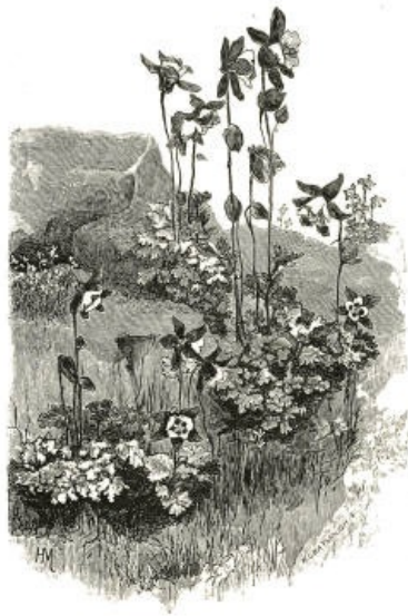
Siberian Columbine in rocky place.

even used to convert bare and sandy places into carpets of Mossy turf. In certain positions in large gardens it would be an improvement to allow the very walks or drives to become covered with very dwarf plants—plants which could be walked upon with little injury. The surface would be dry enough, being drained below, and would be more agreeable to the feet. Removing any coarse weeds that established themselves would be much easier than the continual hoeing and scraping required to keep the walk bare. Of course this only refers to walks in rough or picturesque places—the wild garden and the like—in which formal bare walks are somewhat out of place.