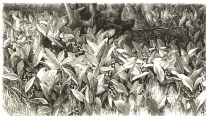
The Lily of the Valley in a copse.