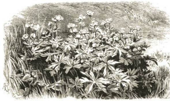
Group of Globe flowers (Trollius) in marshy place: type of the nobler Northern flowers little cultivated in gardens.