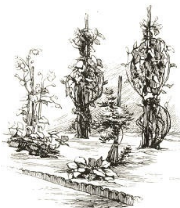
A "mixed border" with tile edging, the way in which the beautiful hardy flowers of the world have been grown in gardens hitherto, when grown at all. (Sketched in a large garden, 1878.)

Thirdly , because, arranged as I propose, no disagreeable effects result from decay. The raggedness of the old mixed border after the first flush of spring and early summer bloom had passed was intolerable, bundles of decayed stems tied to sticks, making the place look like the parade-ground of a number of crossing-sweepers. When Lilies are sparsely dotted through masses of shrubs, their flowers are admired more than if they were in isolated showy masses; when they pass out of bloom they are unnoticed amidst the vegetation, and not eyesores, as when in rigid unrelieved tufts in borders, etc. In a wild or semi-wild state the beauty of