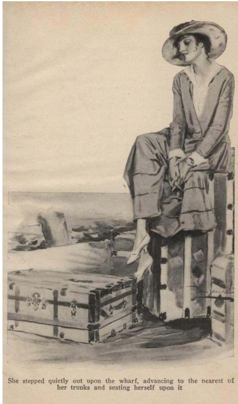
She stepped quietly out upon the wharf, advancing to the nearest of her trunks and seating herself upon it

Eventually, becoming tired of watching the watcher, she stepped quietly out upon the wharf, advancing to the nearest of her trunks and seating herself upon it. She was still studying the observer, wondering whether to speak first or to wait for him to turn, when there came a swift change in the tableau.